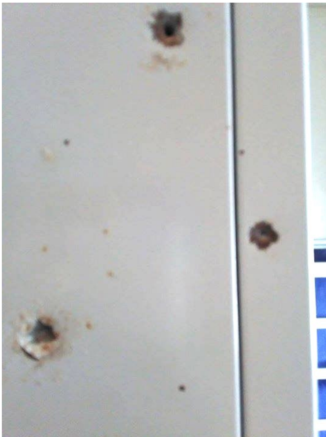
Above: We were being shot at randomly during the outbreak of riot in 2014. Welfare!