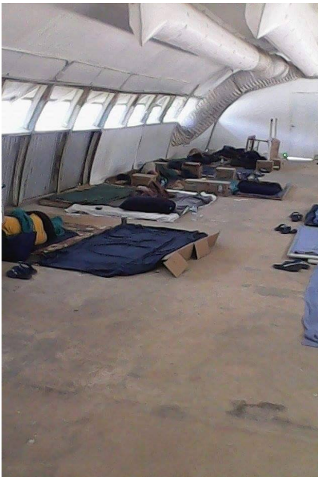
Above: Sleeping area in Foxtrot. We sleep in a small container with four people and a small fan. However, this is an area where no-one lives but the irony is , it has got air-conditioning.