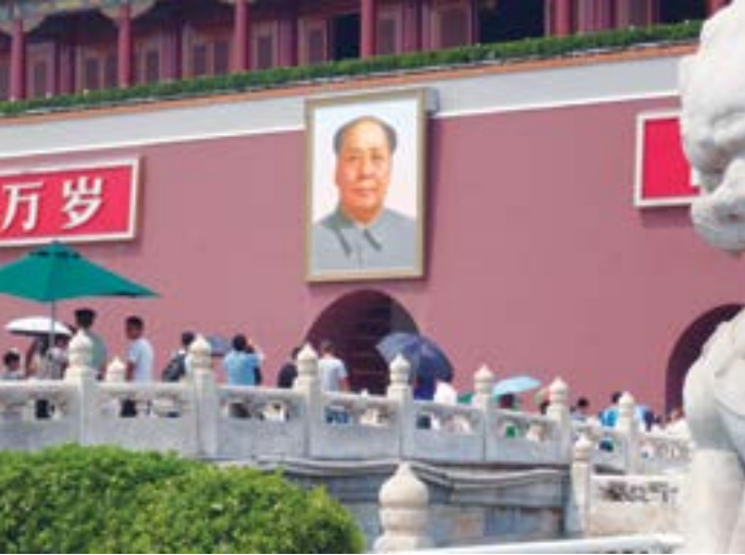
A giant portrait of Chinese communist revolutionary leader, Mao Tse Tung, looks over Beijing's main square.

(North Korea). Furthermore, a strengthened ADF would surely be increasingly used to help Australian business owners and top bureaucrats bully and exploit the peoples of smaller Asia-Pacific neighbours as seen in the past ADF interventions in Bougainville, Solomon Islands, East Timor and Tonga. And from past record and given the instability of the capitalist-dominated world, one can certainly expect the ADF to be mobilised to help the Australian regime's U.S. senior partner to grab control of oil supplies and outmanoeuvre capitalist rivals in the Middle East.