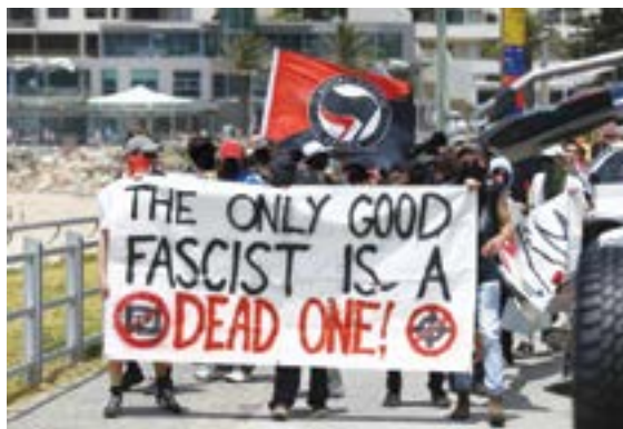
Left, December 2005: Hordes of rednecks bash any coloured or other “ethnic” person they could find on Cronulla Beach and surrounding area. Ten years later (Right), it was militant anti-fascists who formed the loudest, most prominent demonstration in the area. The opposite of ten years earlier, it was any racist filth who were present near the Beach who would have felt the most intimidated, at least if they were within the area near the anti-racist march route.

12 December 2015 – Today, brave people of all colours will take a stand against racism on the shameful anniversary of the racist riot on Cronulla Beach. Ten years ago in Cronulla thousands of racists savagely rampaged against people of Middle Eastern and South Asian backgrounds and, indeed, against anyone without white skin . An Aboriginal youth and many people of Afghan, Bangladeshi, Iranian and Lebanese background were amongst those brutally bashed. The riot was always meant to target all coloured people: it was openly built as “L_b and W_g bashing day.” The disgusting radio shock jocks, like Alan Jones, who promoted the racist riot ranted especially against “Lebanese Muslims.” During the riot, at least one woman who was wearing Islamic head dress had her headscarf pulled off as she fled violent attackers. However, people from all religious backgrounds were attacked