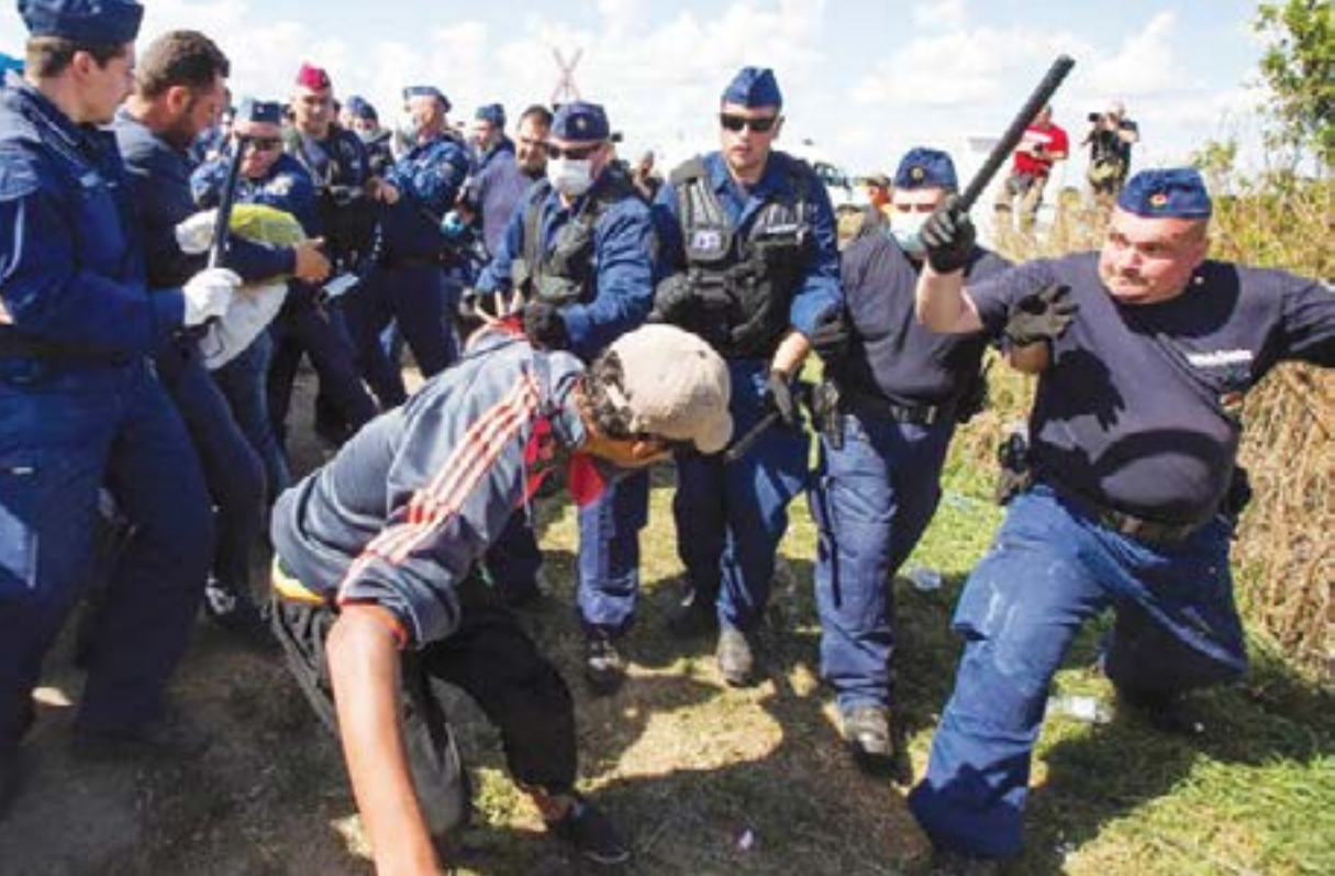
September 2015: Hungarian police brutally attack refugees. Capitalist counterrevolution in Hungary has led to an explosion of racist violence by the Hungarian police and fascist paramilitary groups.

Nevertheless, the presence of a bureaucratic administration – with all its accompanying corruption and the fact that ordinary workers were not involved in decision making – prevented the socialistic economy of the USSR from reaching its full potential, something that became more pronounced the closer that the USSR actually came to catching up with the economies of the richest countries. Furthermore, the material privileges of the bureaucracy (as petty as they were compared to the exorbitant wealth of tycoons in capitalist countries) and the suppression of workers democracy depoliticized the masses and weakened their commitment to socialism – even while socialistic rule had greatly improved their lives. All this made the USSR brittle in the face of the gigantic military, economic and political pressures it faced from the capitalist powers who were/are determined to crush any workers state. When a small layer of capitalist counterrevolutionaries backed by Washington, London, Tokyo and Canberra amongst others made its bid for power in the USSR in 1991, the Soviet masses had, in fact, become so depoliticized that most of them did not resist in any effective way at