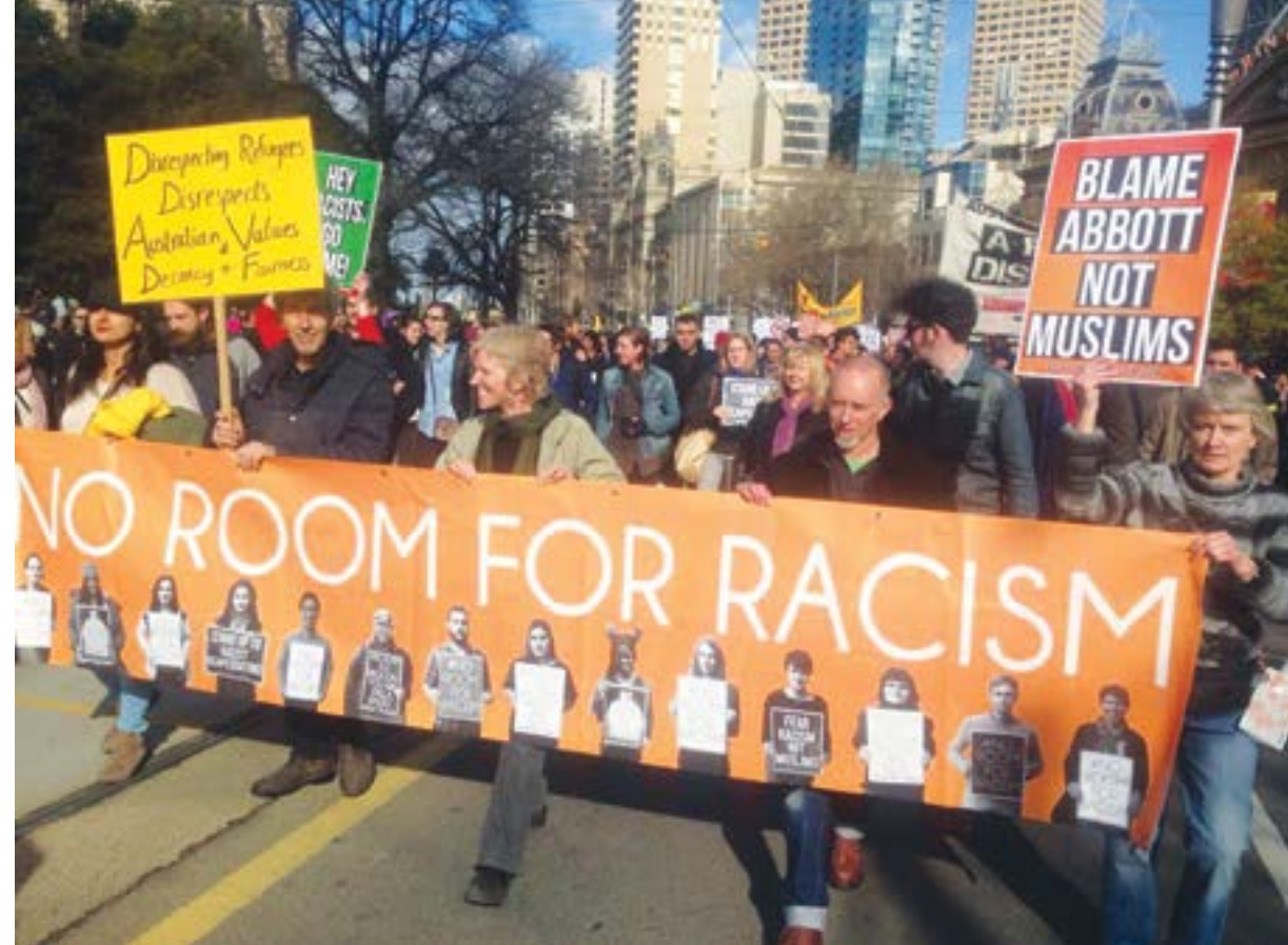
18 July 2015: Over a thousand anti-racists participated in this counter-demonstration to the extreme racist “Reclaim Australia” rally in Melbourne.

Thus, the question that we need to consider in reviewing the lessons of July 19 is not whether SAlt or other groups adopted bad tactics on the day but whether the very strategy that the anti-racist counter-rally was mobilised on actually advanced the cause of building working class-based actions dedicated to sweeping the extreme white supremacists off the streets. It is clear that the official call for the July 19 anti-racist counter-action did not encourage an action that would seek to actually stop the Reclaim rally. The call posed the event as simply a “peaceful” protest against the ideas of the Reclaim movement rather than an action that sought to shut the racist, violence-inciting rally down. This had the effect of guiding those planning on attending onto a certainly well-meaning but, ultimately, counter-productive pacifist path. Of course, such a call would not have affected those anti-fascists who already understand that when the fascists get away with openly rallying it simply spells more racist violence