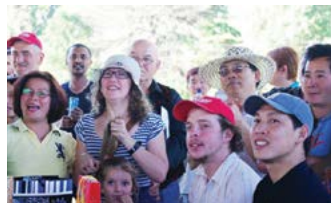
November 2011, Above: Workers at the Baida poultry plant in Laverton, Victoria on the picket line during a two-week long strike for job security and against bullying bosses. Left: Baida workers at a picnic to celebrate their victorious struggle. Even today, when workers are in collective struggle, petty rivalries and jealousies and the racial and sexual divisions and oppressions created by capitalist society are to a degree mitigated. This points to how a future communist society will allow all people to live in very warm and happy friendship with each other in a society without oppression or exploitation – and, hence, no need for a state.