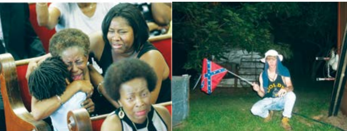
Charleston, South Carolina, United States: Friends and relatives of victims at a ceremony to mourn the murder of nine attendees at the Emanuel African Methodist Episcopal Church. White supremacist activist, Dylann Roof (Right) entered the church – known as a church where black people congregated – and indiscriminately opened fire on churchgoers. Every Reclaim Australia and UPF rally brings Australia closer to a Charleston-style far-right terrorist massacre.

the Adelaide April 4 “Reclaim” action, some of the invigorated fascists followed a group of indigenous activists participating in the counter-protest back to their home and assaulted them. Meanwhile, the emboldening of the “Reclaim” participants – and the bigots “watching at home” – just by the fact that they were able to get away with openly spewing extreme racist filth in the heart of Adelaide can only lead to more racist violence on the streets.