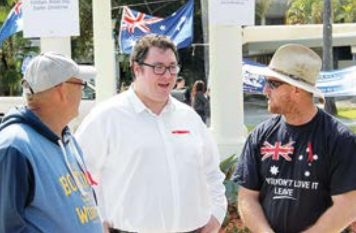
George Christensen (Centre), an MP from the federal Coalition government, spoke at the 19 July 2015 "Reclaim Australia" racist rally in Mackay. Small-l liberal figures and their social democratic promoters claim that mainstream politicians can be won over to the struggle against far-right racism. But, actually, these politicians are a big part of the reason why the extreme racist forces are growing.

Unfortunately, at this point what was warned against in our leaflet is, for the moment, coming to pass. The white supremacists largely got away with being able to foment their race hate on 4 April 2015 (and indeed on July 18/19) and as a result those unorganised racist bigots sitting at home watching became more radicalised. This has contributed at least in some way to the increase in racist attacks on the streets over the last few months. The one partial exception on April 4 (and also on July 18/19) was Melbourne, where the fascists' ability to hold their race-hate provocation was at least