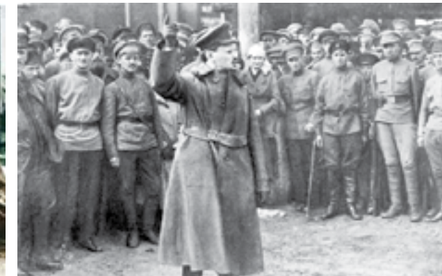
From the time that they overturned capitalist rule in the 1917 Russian Revolution, the Soviet working class had to mobilise the forces of armed power to defend their liberation. Right: Founder of the Soviet Red Army, Leon Trotsky, motivates troops in 1918 during the bloody Civil War against insurgent armies attempting to restore capitalist power. Left: Red Army women snipers during the Soviet Union's struggle to defeat capitalist Nazi Germany's invasion during World War II. It is completely unrealistic that a victorious workers' revolution will be able to immediately build a socialist society without constructing a workers' state to defend the toiling masses' conquests against the deposed capitalists seeking to restore their rule and against international capitalist powers determined to destroy any example of a socialist society.