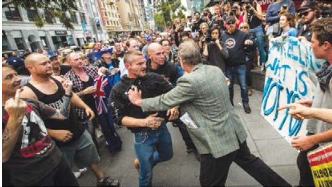
Melbourne, April 2015: Fascists (on the left of picture) participating in the ultra-Islamophobic "Reclaim Australia" rally threaten and use violence against anti-racist counter-demonstrators. Fascist forces not only have disgusting views but are people organised to commit violence against Aboriginal people, non-white ethnic communities, leftists and the workers movement. The idea that fascists can be peacefully debated is not a viewpoint based on reality.

The first "Reclaim Australia" rallies on 4 April 2015 were the biggest open mobilisations of far-right racists in Australia in a long time. With the notable exception of Melbourne, in most places where they rallied on April 4 the racist extremists outnumbered anti-racist counter-protesters. In Sydney, Australia's largest and most multiracial city, the April 4 counter-demonstration was particularly weak. Many long-time anti-fascists did not turn up to the anti-racist counter-rally, organised mainly by the Solidarity group, because the rally leadership's avowed strategy of ruling out any attempt to shut down the white supremacist "Reclaim Australia" mobilisation either positively turned off – or otherwise did not inspire – many staunch anti-fascists.