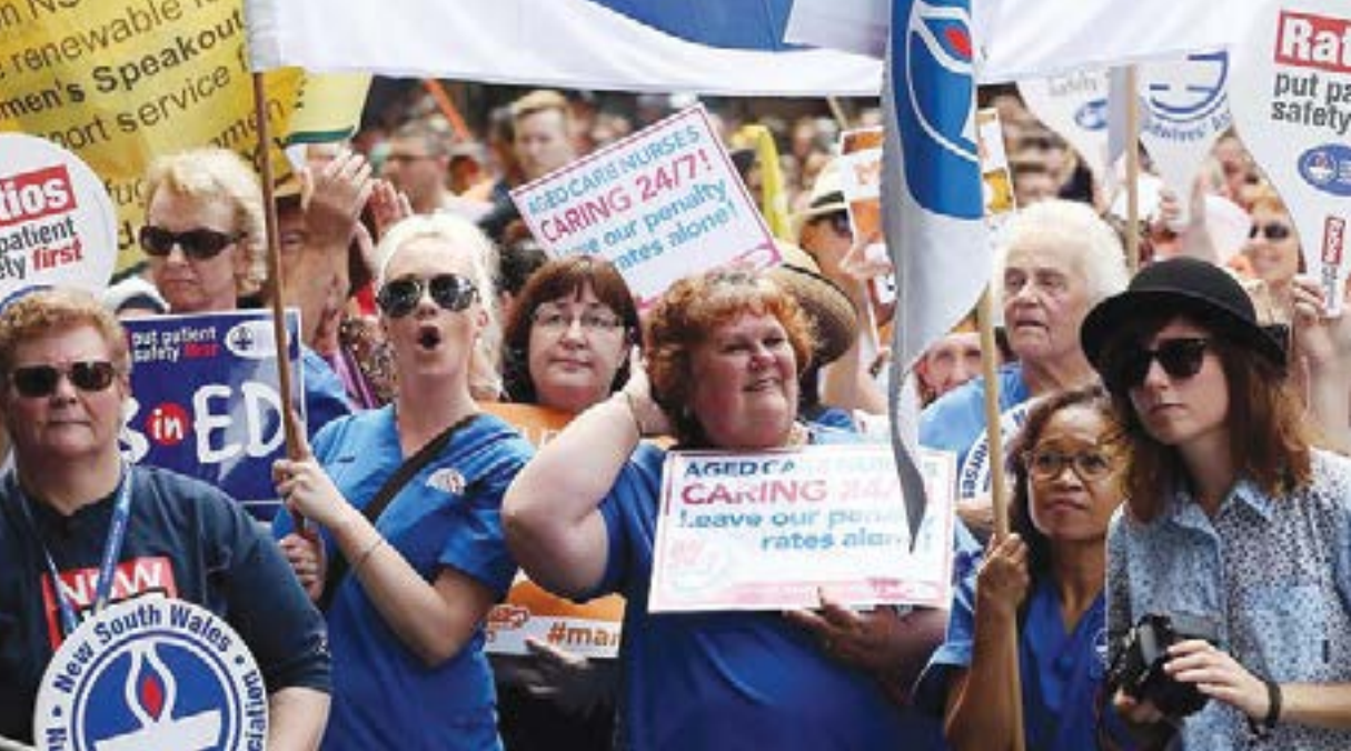
4 March 2015: Thousands of trade unionists march through Sydney city in a rally for workers' rights and against cuts to social services. Workers demanded an increase in nursing jobs, opposed cuts to Medicare and demanded an end to the privatisation of electricity and public hospitals. A united movement – energised by the power of trade union industrial action – must be built to demand free quality public health care for all, truly free public school, TAFE and university education, jobs for all, an end to the sell-off of public housing and a massive increase in public housing.

much lower Newstart Allowance. If this isn't bad enough, those single parents who have part-time jobs were hit with even more savage cuts to their income as the Newstart Allowance is more ruthless than the Parenting Payment in cutting payments to those who do manage to find any part-time work.