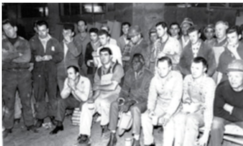
1967: Aboriginal activists from the Gurundji stockmen and domestic hands' strike together with Builders Labourers Federation (BLF) members at a meeting to support the Gurundji struggle for land rights. The leftist-led BLF trade union would later play a key role in the Aboriginal struggle for affordable housing on Redfern's The Block. The workers' movement must stand solidly behind the struggle for justice of Aboriginal people.

that Aboriginal people faced in employment and every aspect of their lives inevitably led to social problems on The Block. These problems were played up by the capitalist-owned media and seized on by the state government to justify their push to drive Aboriginal tenants out of the area. The combined effect of relentless police attacks, the deterioration of the houses, social problems and the AHC's push to move tenants off The Block meant that by late 2010 there were just 35 people living on The Block – down from a peak of over 300. To get the last of the tenants to move, the AHC on the one hand threatened higher rents and eviction orders and, on the other hand, promised residents that they would be able to move back once the re-development took place. Residents, however, were sceptical about being able to move back and expected that the 62 new affordable houses would still be way out of their price range. What really enraged former Block residents and supporters of affordable housing for Aboriginal people was when last year AHC CEO, Mick Mundine, claimed that it was not commercially viable to pursue affordable housing on the Block. "That's on the back burner at the moment," he said. "Our first priority is the commercial build" ( The Sydney Morning Herald , 26 April 2014). It was this confirmation of the fears of many that led Aboriginal activists to establish RATE.