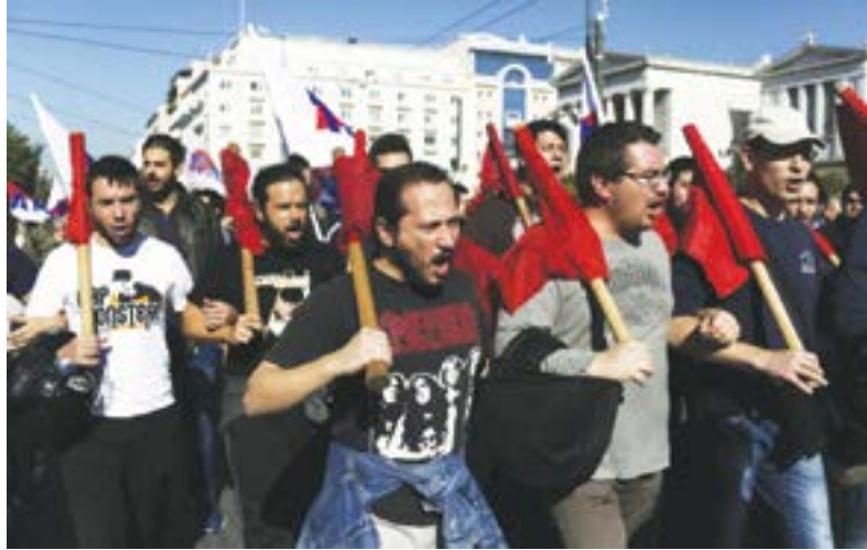
Athens, 12 November 2015: Tens of thousands of Greek workers march during a massive general strike against the austerity policies of the “leftist” Syriza government. The Greek government is implementing cuts to pensions and other social services and large-scale privatisations. Despite calling itself “radical Left”, the fact that the Syriza government accepts capitalist state power means that it must necessarily carry out anti-working class policies. Similarly, despite occasional, very soft “Left” rhetoric, the fact that the ALP and Greens accept capitalist rule means that ALP or ALP/Greens governments always serve the big end of town capitalist exploiters. Working class people can only win gains through class struggle against the capitalist ruling class and can only secure a happy future through the eventual overturn of capitalist rule.

The spectacular advances for public housing in socialistic China point to the potential of a society based on public ownership. One of the reasons China is able to make these advances is that its banks are under public ownership and so are its main construction companies building the public housing. Here in capitalist Australia a lot of the budget for public housing ends up in the pockets of greedy private contractors like that super wealthy firm Spotless which has the contract for repairs. 10