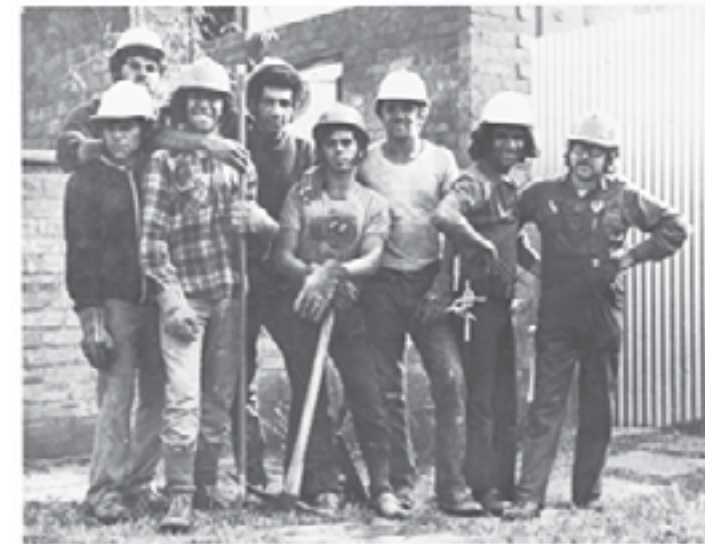
1970s: Aboriginal and non-Aboriginal BLF union members working on the construction of affordable housing for Aboriginal people on The Block.