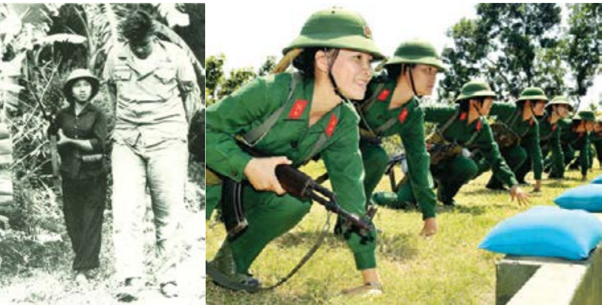
Left, 1966: A Vietnamese communist woman fighter marches a captured American airman through the jungle during the Vietnam war. Right, 2014: Women soldiers in the army of the Vietnamese workers state in training. The founding personnel, traditions and culture of the Vietnamese workers state's organs were, like those of the other workers states in China, Cuba, North Korea and Laos, formed during the heroic liberation struggle against capitalism and imperialism. An important part of these new traditions and culture included placing women's role in society at a much higher level than where it had been during pre-revolutionary times.