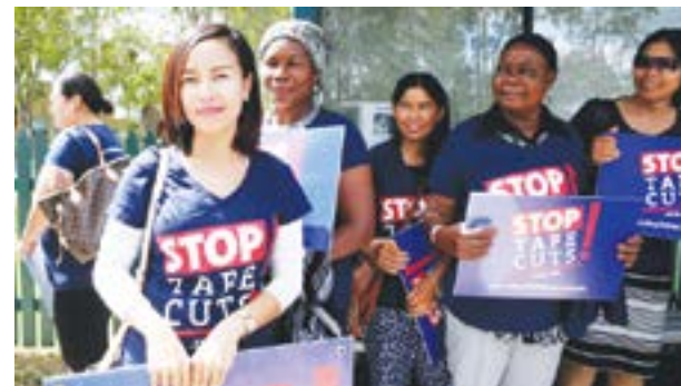
In 2015, teachers, staff and local residents across NSW protested against cuts to TAFE. The government's cuts have seen hundreds of TAFE teaching jobs slashed and whole TAFE courses axed.

As usual the ruling class is doing to Aboriginal people what they are doing to all working class people in an especially severe way. The WA government is trying to forcibly close hundreds of Aboriginal communities and drive Aboriginal people out of their homes and communities. Everywhere federal and state governments are refusing to fund