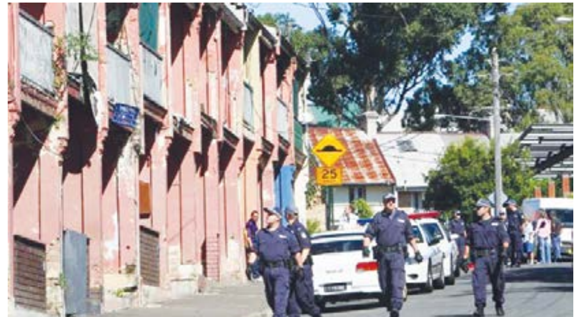
Police stampeding around Redfern's The Block. The Aboriginal community on The Block faced decades of violent police raids and racist bullying.

Aboriginal people have been living on The Block in low-rent housing since the early 1970s. This affordable housing had been won through a struggle by Aboriginal militants and the militant Builders Labourers Federation trade union. That struggle which triumphed in early 1973 forced the then Whitlam Labor federal government to provide a grant for Aboriginal people to collectively buy up the area. The Aboriginal housing in the area came to be managed by the Aboriginal Housing Company (AHC) which was established by the activists who fought for The Block for the sole purpose of providing comfortable and happy low-rent accommodation for Aboriginal people. Despite facing much racist discrimination – including from banks reluctant to do dealings with an Aboriginal organisation – the AHC's work in its early days ensured that low-rent accommodation came to be provided for up to 300 Aboriginal people on The Block.