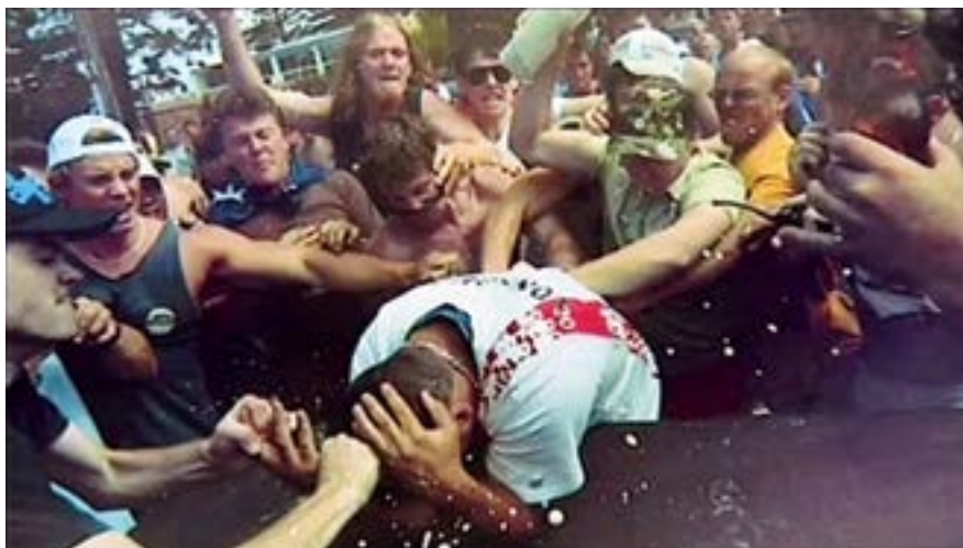
Sydney, December 2005: Racist white mobs bash any coloured person they can find on Cronulla Beach. Since then coloured people have been fearful to go to Cronulla Beach, which had been (due to its location near a train station) up until the riots Sydney's most multi-racial beach. That this defacto state of apartheid on Cronulla Beach remains in place and the effects of the riots have not been overturned is a source of inspiration for violent racists throughout Australia. There needs to be a huge anti-racist convoy of trade unionists, 'ethnic' youth and anti-racists that will travel from the multiracial, working class southwest of Sydney to Cronulla to finally ensure that Cronulla Beach can be safely accessed by coloured peoples.

mainstream media and police assistance. Yet, every day working class Aboriginal, Middle Eastern, Asian and African people are getting attacked or abused on the streets, in public transport, in the school playgrounds and at nightspots with little or no official redress... and that's when racist cops are not the actual perpetrators themselves!