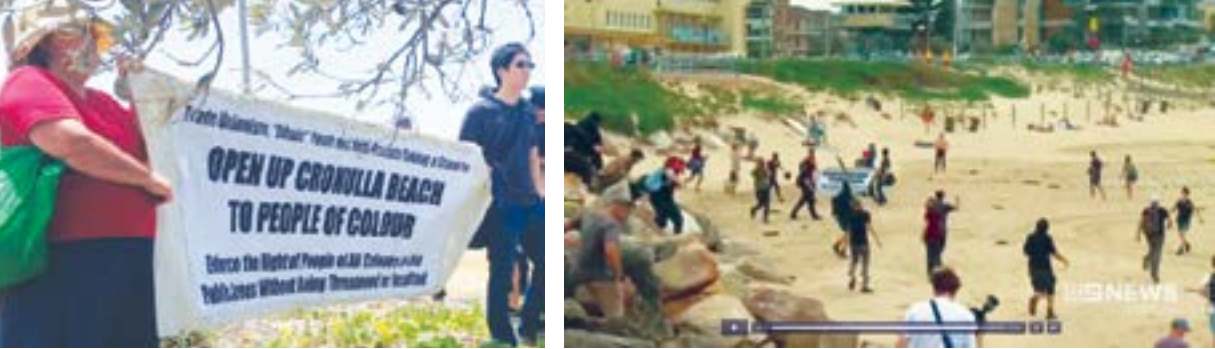
Taking the Beach: A chunk of the demonstrators at the 12 December 2015 anti-racist action in Cronulla jumped down rocks to symbolically stand on part of the beach where ten years earlier it was racist hordes who violently rampaged and where since the riot the number of coloured people using the beach has drastically diminished. A task remains for the workers movement and Left to build a mass convoy of trade unionists, coloured people and anti-racists to go from Sydney's multiracial, working class southwest to Cronulla Beach to assert the right of people of all colours to safely use this public space and to finally re-open the beach to coloured people. One of the Trotskyist Platform banners carried at the December 2015 demonstration (Left) advocated this perspective.

oppressed – need to mobilise now to oppose racist anti-terror laws, to demand freedom for the refugees and full rights of citizenship for all asylum seekers, immigrants, international students and “guest workers.” The struggle against racist attacks must be connected to a struggle to unleash a class struggle fight against the unemployment, casualization of jobs and cuts to social services that cause some all too misguided souls to seek salvation in radical racist so-called “solutions.” As part of building such a class-struggle fightback we must also put shoulders to the wheel within our unions and replace the current pro-ALP politics that leads the union movement with a militant class struggle and internationalist perspective.