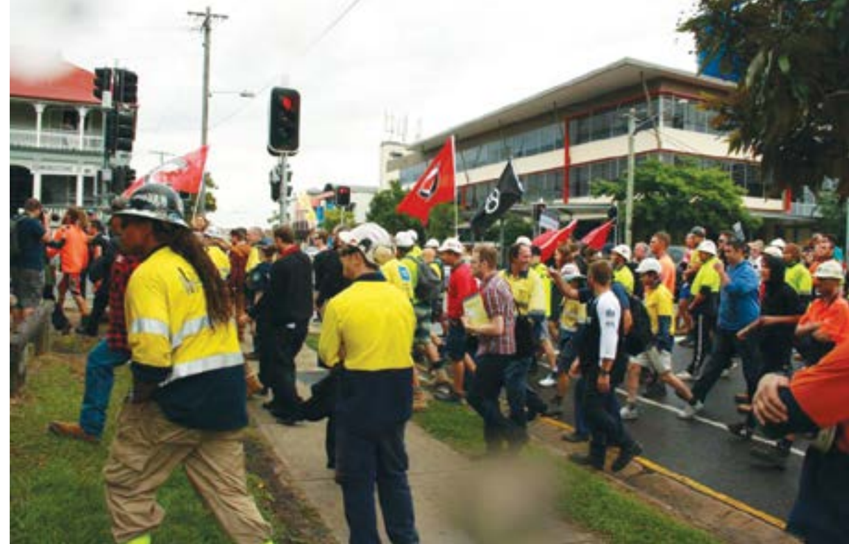
Brisbane, 2 May 2014: Trade unionists from the construction industry were in the forefront of an action that swept the white supremacist Australia First Party off the streets. Mobilising trade union contingents is crucial to anti-fascist struggles. Union contingents represent social power and carry with them the implied threat of industrial action if they are attacked. Workers' contingents at anti-fascist mobilisations have the potential to compel police intent on defending the fascists to stand aside, thus allowing the fascists to be driven off the streets.

It is true that the fascists, right now, do not have the strength that they had in the days of the Old and New Guards. However, their neo-Nazi counterparts in Europe have been breeding at an alarming rate feeding off the huge unemployment and insecurity caused by decaying capitalism and its severe economic crises. Right now, white supremacist outfits are succeeding in whipping up more and more violent racist attacks on coloured individuals. Working class people cannot allow non-white members of our class to be terrorised in this way. We cannot afford to allow people from a non-white background to be so intimidated that they will be unable to undertake the crucial role that they have often played in the struggle for all of our collective rights. We cannot and will not allow Hitler-loving lunatics to divide our side with racism.