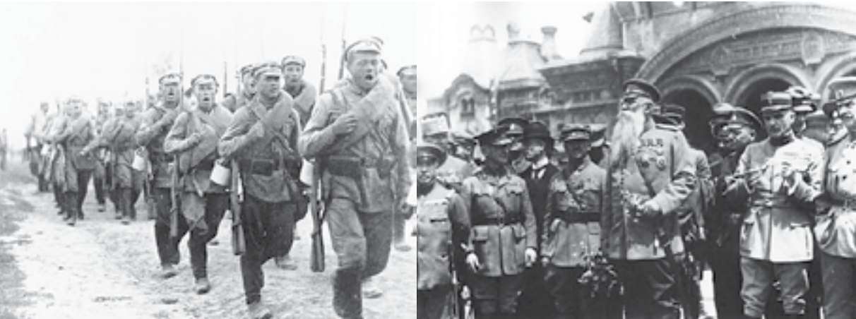
After the October 1917 workers' revolution in Russia, the deposed capitalists and world capitalist powers joined together to organise a bloody civil war to attempt to overthrow the new socialist-based system. Right: Officers from Western imperialist powers meet with representatives of counterrevolutionary Russian leader Alexander Kolchak. Left, March 1920: Troops from the counterrevolutionary Russian White Army march forward.

We must be on high alert after the workers' revolution for the former exploiters will still have plenty of money, the networks, the connections, the knowledge and the expertise to inflict harm upon the fledgling, socialist society. We can have no doubt about it: these vestiges of the former ruling capitalist class will agitate for a counter-revolution.