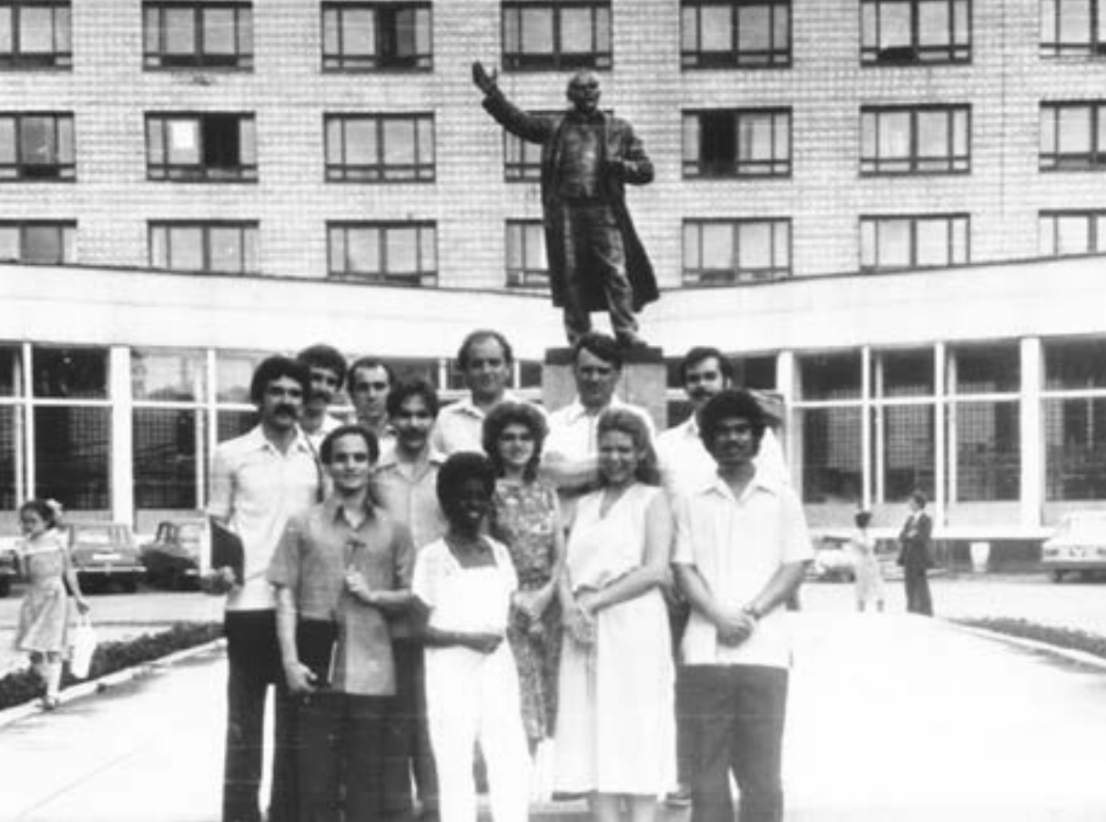
Days of the Socialistic USSR: International and local students at Novosibirsk State Technical University pose for a photo in front of a statue of Russian Revolution leader, Vladimir Lenin.

the various Central Asian nationalities faced brutal suppression of their national rights. However, the 1917 October Socialist Revolution in Russia changed all that. The victorious revolutionary workers created their own state, the Soviet Union (USSR) workers state, that over time led to a massive improvement in the status of the Kazakh, Uzbek, Tadzhik, Turkmen, Kirghiz, Georgian, Armenian, Azeri and other peoples of Central Asia and the Caucasus. From the time the communist-led workers took state power, they mobilized to smash the fascist and other anti-Semitic gangs. 6