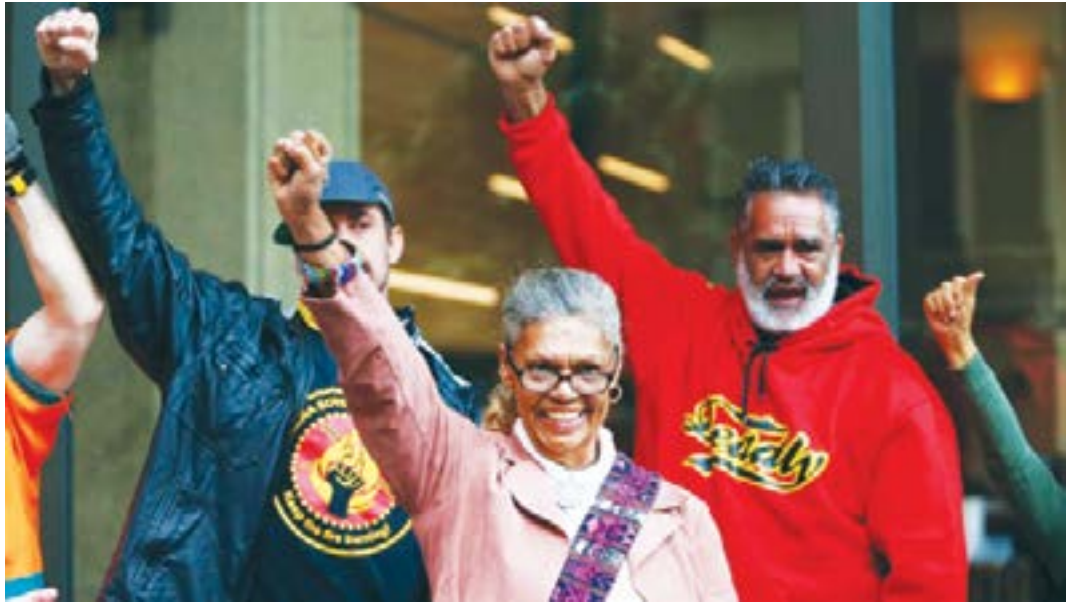
27 August 2015: Key Aboriginal activists spearheading RATE confident as the struggle heads towards securing gains for affordable housing for Aboriginal people.

development planned by Deicorp and the Aboriginal Housing Company.