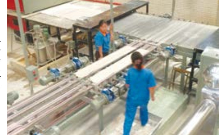
Workers at North Korea's Taedongang Tile Plant. North Korea has a relaxed and friendly work environment where at least two people are stationed at assembly line node points that would, in places like Australia or Indonesia, have only one worker doing all the work.