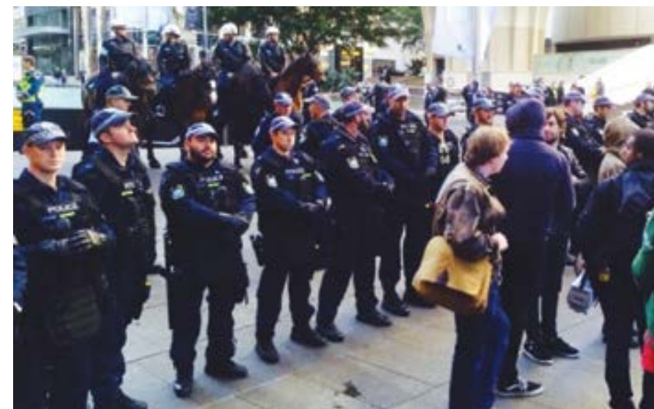
Sydney, 19 July 2015: A large police mobilisation prevents an anti-racist demonstration from being able to effectively counter a rally by the fascist "Reclaim Australia" movement. It was notable how the police and police horses faced in the direction of the anti-fascists – confirming that the police were siding with the far-right racists against the anti-racists.

Given the white racist forces seen on Sunday [i.e. on 11 December 2005], a union/immigrant mobilisation would not take place at Cronulla Beach until the forces for such an action had been adequately built up. But these forces need to be urgently strengthened right now through one, or a series of, preparatory demonstrations in the heartlands of Sydney's multiracial working class – suburbs like Bankstown or Auburn. When our side is sufficiently strong, the decisive union-centred action at Cronulla Beach can be launched possibly via a huge cavalcade from a rallying point in Sydney's West.