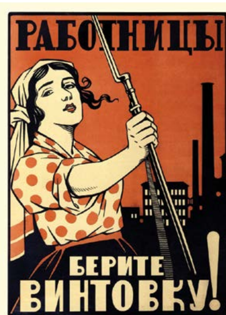
Top of previous page: “Beat the Whites with the Red Wedge” Famous Russian Civil War poster. “Whites” was the name given to the capitalist-landlord forces that sought to overthrow the young Soviet workers state. By the great Soviet designer/artist El Lissitzky, this poster was made in the Byelorussian town of Vitebsk and flyposted on its streets in 1920 at the time of the threat of invasion by the forces of bourgeois and landlord Poland. A fusion of Bolshevism's new communist politics and Kasimir Malevich's equally new art movement of Suprematism, it became an almost mythical symbol in the revolutionary struggle, representing as it does the Reds, surrounded by light, stabbing the heart out of the old feudalist and capitalist world surrounded by darkness.

“Women Workers, Take Up Your Rifles” declares a poster from the early days of the Russian Civil War, circa 1918, calling upon working class women to join the fight against the increasingly foreign-armed enemies of the workers' and peasants' revolution in Russia.