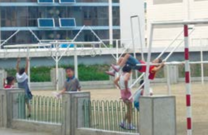
North Korean children having fun at a playground near a housing complex.