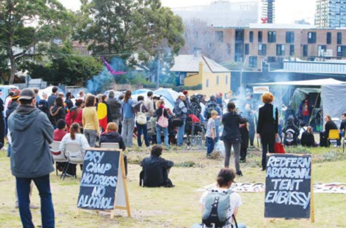
15 June 2014: Hundreds gather to defend the Redfern Aboriginal Tent Embassy (RATE). RATE attracted broad support from supporters of Aboriginal rights and campaigners for affordable housing.

and the strong drive that was key to success. The Aboriginal activists spearheading the movement deeply understood not only how the lack of affordable housing has forced many Aboriginal people into homelessness but also the importance of saving the Aboriginal character of The Block given its special significance as a historic centre for militant black resistance against racial oppression. Many non-Aboriginal people also supported the RATE struggle. This included people from various non-white “ethnic” communities – who especially identify with the Aboriginal rights struggle because of their own experiences in racist white Australia – as well as committed anti-racist white activists. Special mention here must be made to activists with links to the anarchist Black Rose collective who did a lot of heavy lifting in terms of staffing and protecting the embassy at night. Trotskyist Platform activists also did regular night and graveyard shifts to guard the embassy. Also participating in the struggle were activists from Socialist Alliance and individuals from a wide range of different anti-racist political standpoints. When RATE held rallies – both