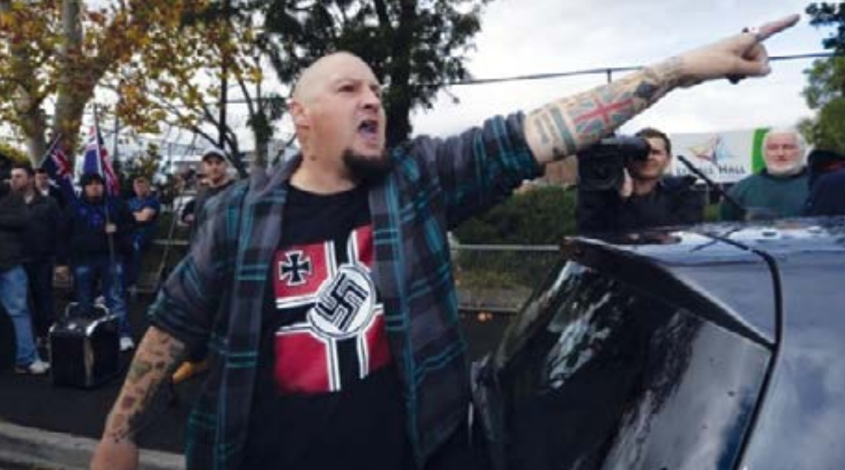
Melbourne, May 2015: An activist with the fascist United Patriots Fund (UPF) proudly brandishes Nazi symbols at their rally against communism and Islam. The UPF and Reclaim Australia are avowedly anti-Islam and anti-communist. In truth they are not only bigots opposed to Muslims but are extreme white supremacists intent on stirring up racist violence against all coloured people – they are against Aboriginal people and against people from Asian, African, Middle Eastern and Pacific Islander backgrounds.

The capitalist bosses and their politician mates know this well. That's why they have been deliberately whipping up racism to divide the ranks of the working class and divert their fire . They have been demonising refugees and Muslims and ever more viciously vilifying and locking up Aboriginal people. Serving the exploiting class in this agenda are several extreme right-wing groups. These outfits, including open neo-Nazis, don't simply want to spread prejudice. They actually want to incite and unleash violent racist attacks.