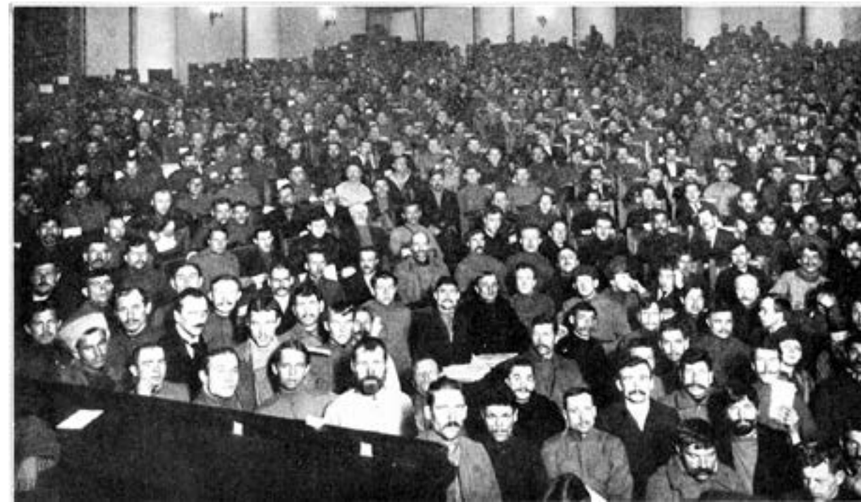
Meeting in Petrograd of the Third All Russia Congress of the Soviets in January 1918 – two and a half months after the Russian Revolution. The Soviet Congress was the highest body of the workers state. It consisted of delegates of workers – and also peasants and soldiers – elected by local grassroots soviets in which the active masses exercised direct political power. The early years after the Russian Revolution saw the workers state administered through this system based on proletarian democracy. Although the system of soviet democracy was strangled by the subsequent bureaucratic degeneration of the USSR, the USSR remained a workers state until it was destroyed by capitalist counterrevolution in 1991-92.