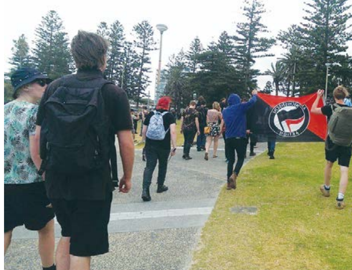
12 December 2015: Anti-fascists on the march at an anti-racist action on Cronulla on the tenth anniversary of the white supremacist riot there.

Participating in yesterday’s anti-racist action were student activists from Sydney University, anarchists, supporters of Socialist Alternative, Aboriginal activists and Trotskyist Platform supporters. A weakness of the mobilisation was that it was not able to win many newer people into the anti-racist struggle – that is individuals not connected to any of the activists circles involved in organising the demonstration. Furthermore,