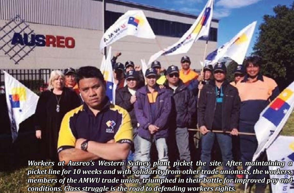
Workers at Ausreo's Western Sydney plant picket the site. After maintaining a picket line for 10 weeks and with solidarity from other trade unionists, the workers, members of the AMWU trade union, triumphed in their battle for improved pay and conditions. Class struggle is the road to defending workers rights.