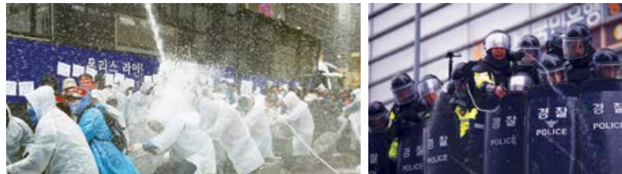
14 November 2015, Seoul: Capitalist South Korea’s brutal police unleash water cannon, pepper spray and tear gas to disperse a 70,000 strong anti-government demonstration of workers and civil rights activists.

For the brutal, anti-working class South Korean regime to be talking about “human rights” is truly the height of hypocrisy. Yet its attacks on the socialistic North are totally expected. Whilst the DPRK was founded by Korean leftists who heroically fought the Japanese imperialist occupiers