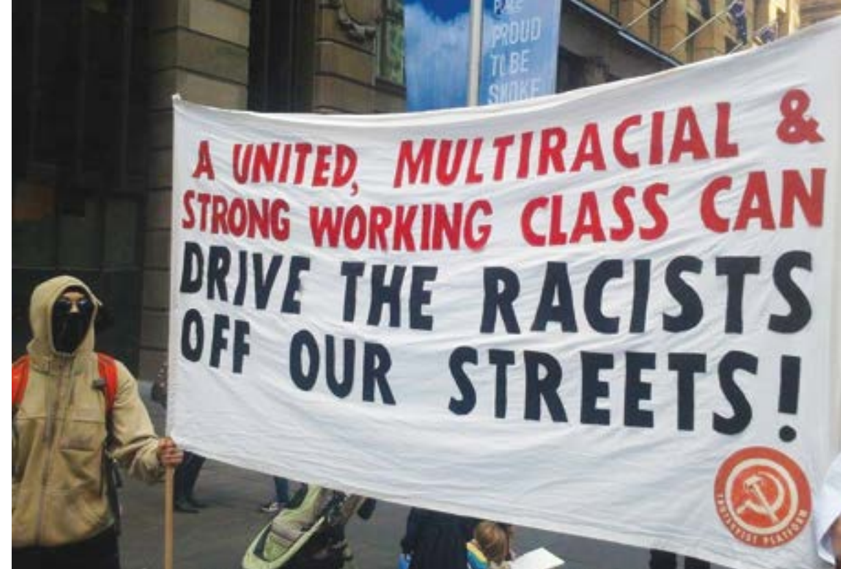
Trotskyist Platform banner, placards and leaflets at the 19 July 2015, anti-racist rally in Sydney promoted the strategy of trade union contingents uniting with coloured people and anti-racists to crush the fascist scum.

Yet by and large, with support from the police, the extreme right-wing forces were able to hold their racist violence-inciting