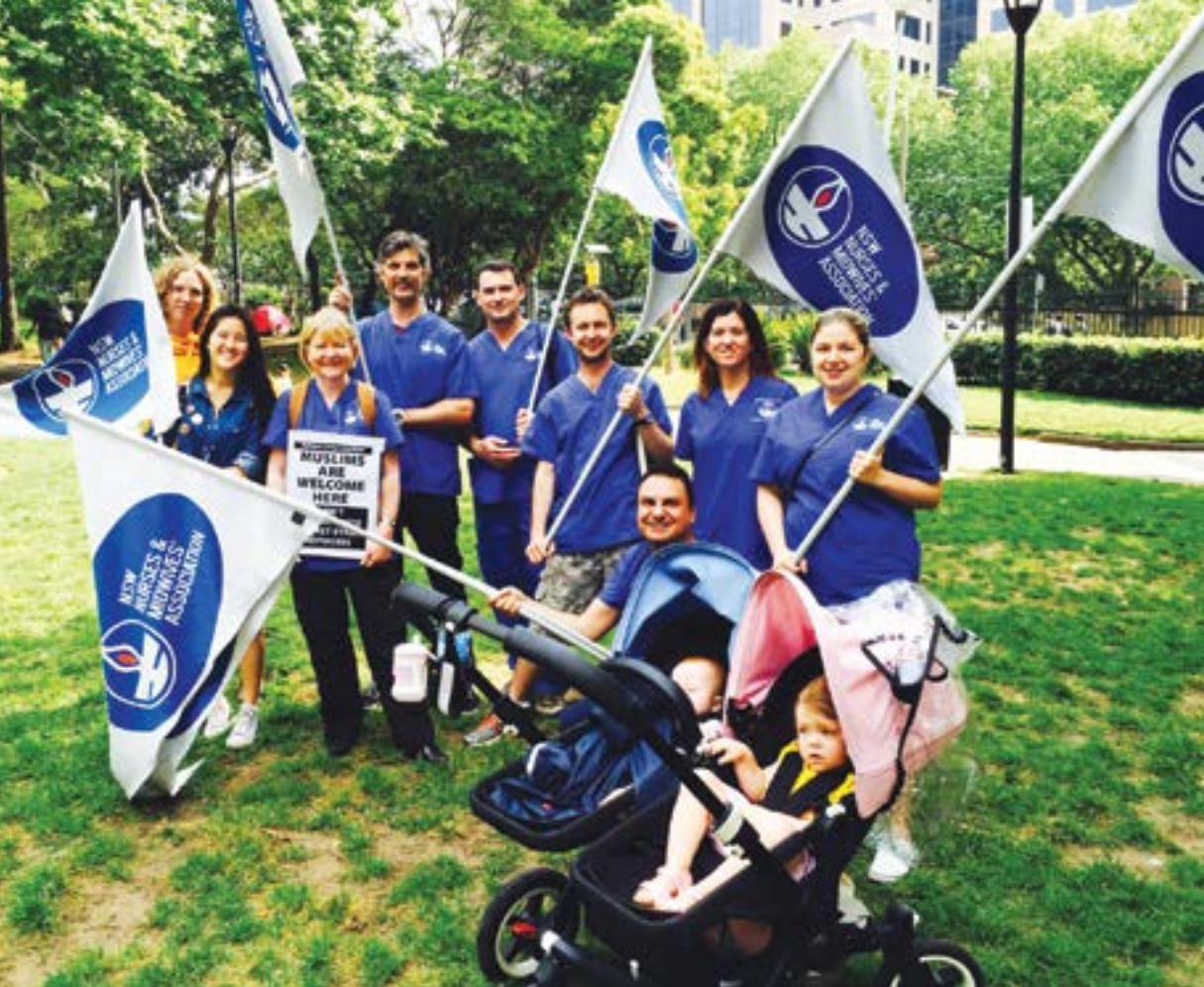
Sydney, 11 October 2015: Proud members of the Nurses and Midwives Association pose for a photo in Hyde Park on the day of the rally in Sydney protesting against the racist Turnbull government's attacks on refugees.

so badly needs to fight for its own rights. Making such an appeal is essential in order to enhance the possibility of winning class-conscious workers to joining the anti-racist struggle.