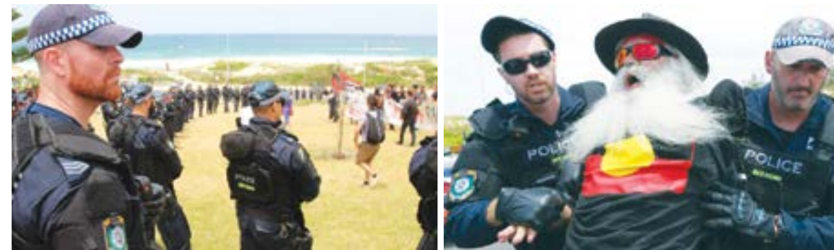
On the day of the December 2005 Cronulla riot the police forces present were strikingly minimal even though the police's own intelligence made clear to them that a large, explosive rate hate mobilisation would occur. Yet when anti-racists mobilised ten years later, the police were unleashed in massive numbers to corral the anti-racist demonstrators (Left) and to protect the violent racists who had gathered to celebrate the December 2005 riot. The police even in a very cowardly manner arrested a one-armed Aboriginal man in his late 50s (Right) – one of two anti-racists that they arrested on the day.

The behaviour of the police, courts and government during and after the Cronulla riot was no aberration. Police and prison guards throughout Australia have killed large numbers of Aboriginal people in and