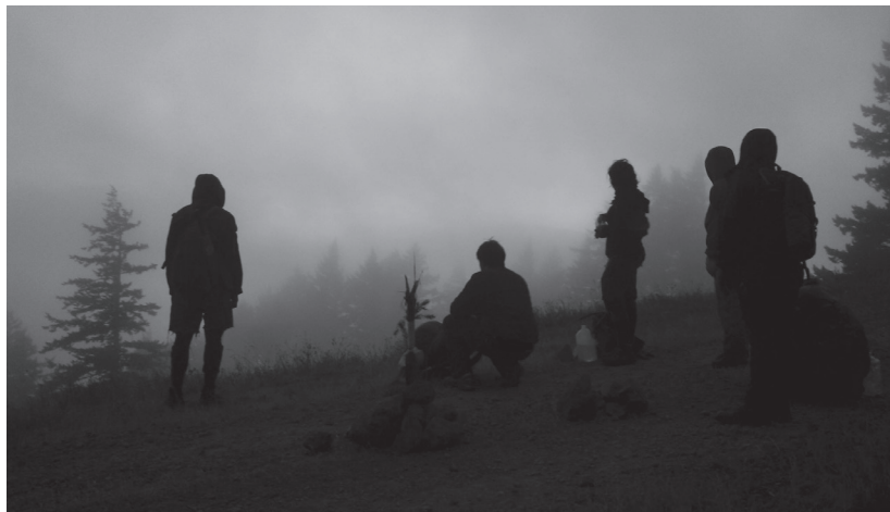
Fog rolls over the Mattole forest in Humboldt County, CA, currently under threat from HRC's logging plans.

At the turn of the century, the monkeywrenchers decided to make their forest home more permanent and set up shop at the company's main entrance. This encampment was dubbed the "Mattole Free State." Taking turns living in tarp shelters, activists worked on and off for several years, saving two-thirds of the living forest from destruction and bankrupting the MAXXAM Company, who was in charge of the clearcutting. Now the Humboldt Redwood Company (HRC) is attempting