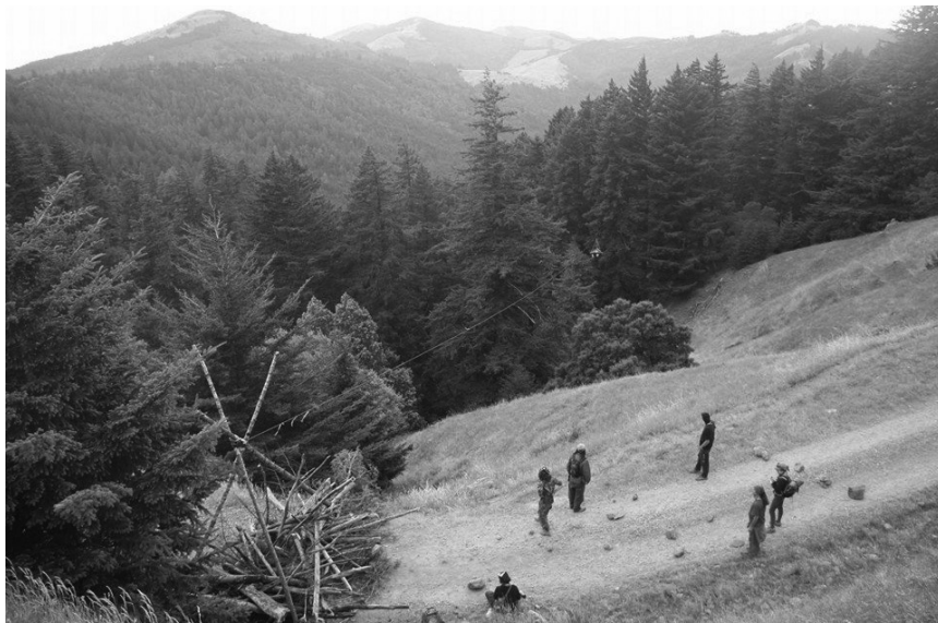
A treesitter occupies a platform suspended 100 feet in the air, with their main support line attached to a barricade in the road.

The forest defenders attempted several times to set up a meeting with community members, activists and representatives of the company. Following rejection after rejection, on July 8 (just two days after the 2014 Earth First! Round River Rendezvous in northern California) a slash pile and tripod were set up in the Mattole, blocking the forest. On the third day of the barricade—the day after the HRC realized they couldn’t continue work—sheriffs and workers arrived. A support persyn was placed in handcuffs after she attempted to explain to the police that there was a lifeline going from the slash pile to a persyn suspended in a tripod, and that if this line was cut the persyn would fall and possibly die.