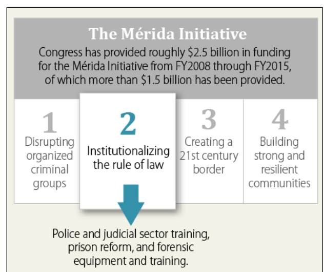
Figure 1. Current Status and Focus of the Mérida Initiative

Appendix for overall U.S. assistance to Mexico since FY2010). In the beginning, Congress included funding for Mexico in supplemental appropriations measures in an attempt to hasten the delivery of certain equipment. Congress has also earmarked funds in order to ensure that certain programs are prioritized, such as efforts to support institutional reform. From FY2012 onward, funds provided for pillar two have exceeded all other aid categories. In FY2015, Congress provided $28.6 million above the Administration's request, with additional funding for justice sector programs and efforts to help secure Mexico's southern border.