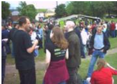
Make Poverty History