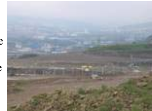
Parkwood Landfill site— home to another 650,000 tonnes of waste per year