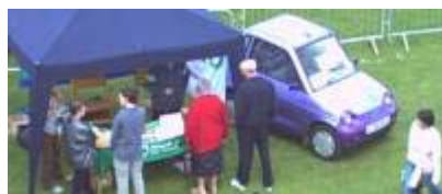
The Sheffield Mayfest—May 2005