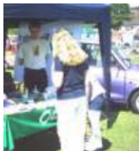
The Sheffield Friends of the Earth stall at Mayfest