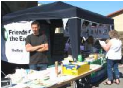
The Sheffield Green Fair—July 2005

Sheffield Friends of the Earth received £100 from head office in London to purchase a camera to record our campaigning work. The camera will also be useful for sending quality pictures to the media and for improving our web site. Budding photographers in the group have been busy taking photos with the new camera at our stalls and other events we have attended.