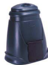
30-35% of household waste is organic and suitable for composting.