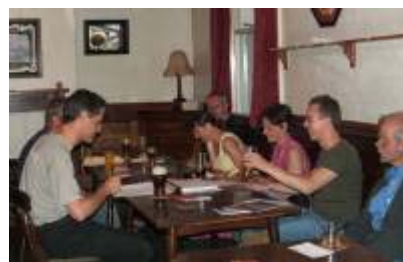
July meeting at the Red Deer pub.