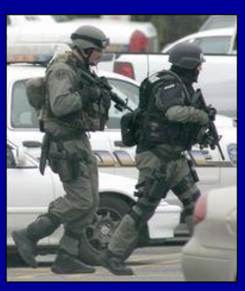
Police respond to Tacoma Mall Shooting