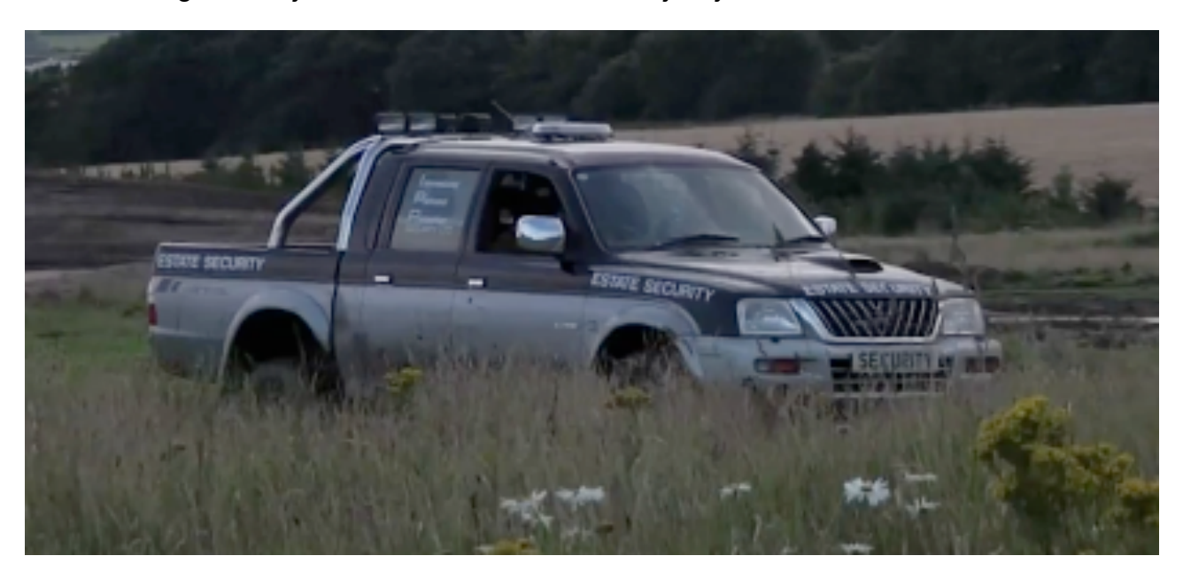
Figure 15 Trump Organisation estate security vehicle (note lack of licence plates)

"The security were really annoying at first because they came down six times a day. They just came down and then turned and went back and then about half an hour after they were back again ...... just for nae reason ..... it was just just hassle."<sup>38</sup>