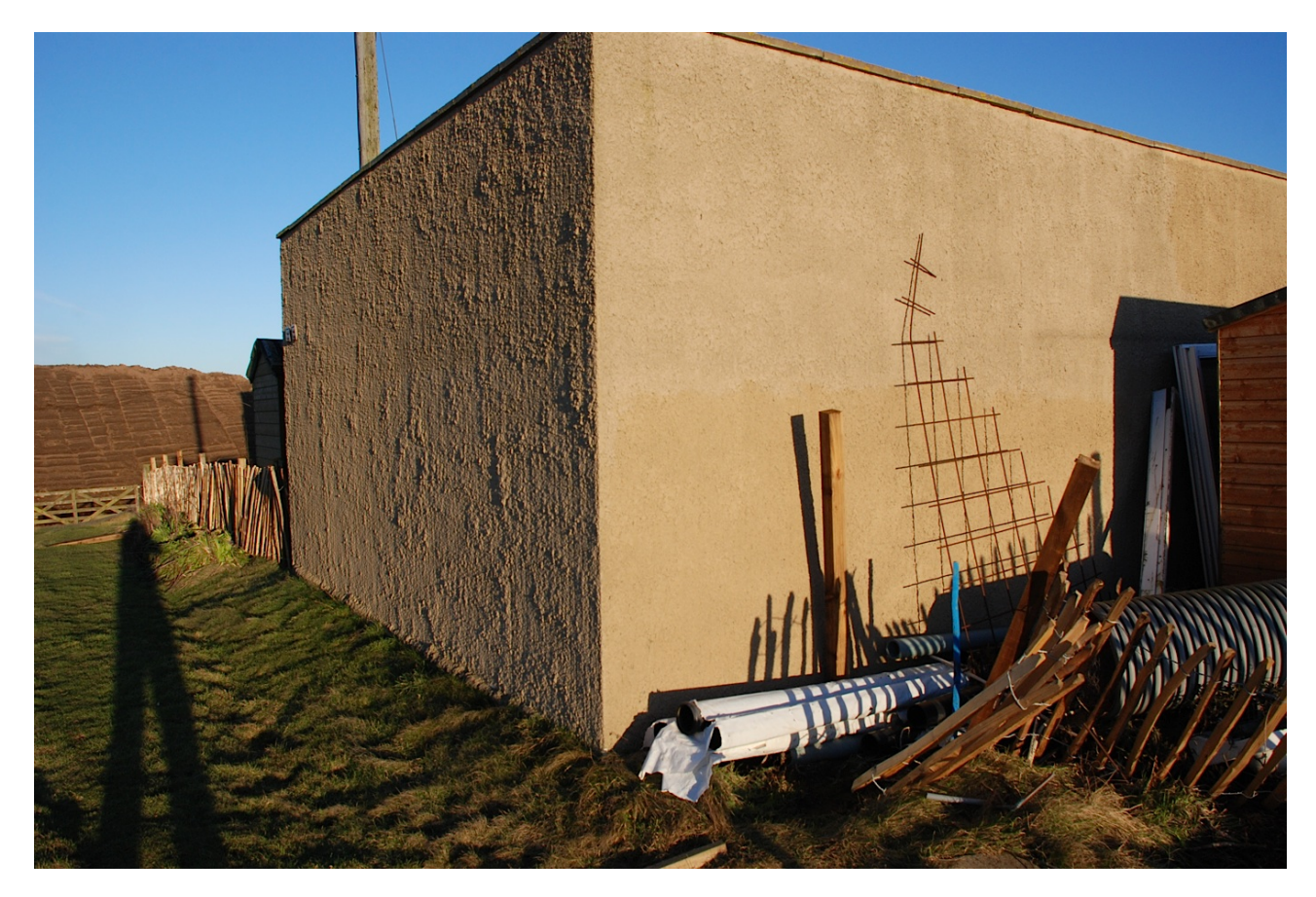
Figure 10 Blue post erected by Trump Organisation demarcating their alleged boundary