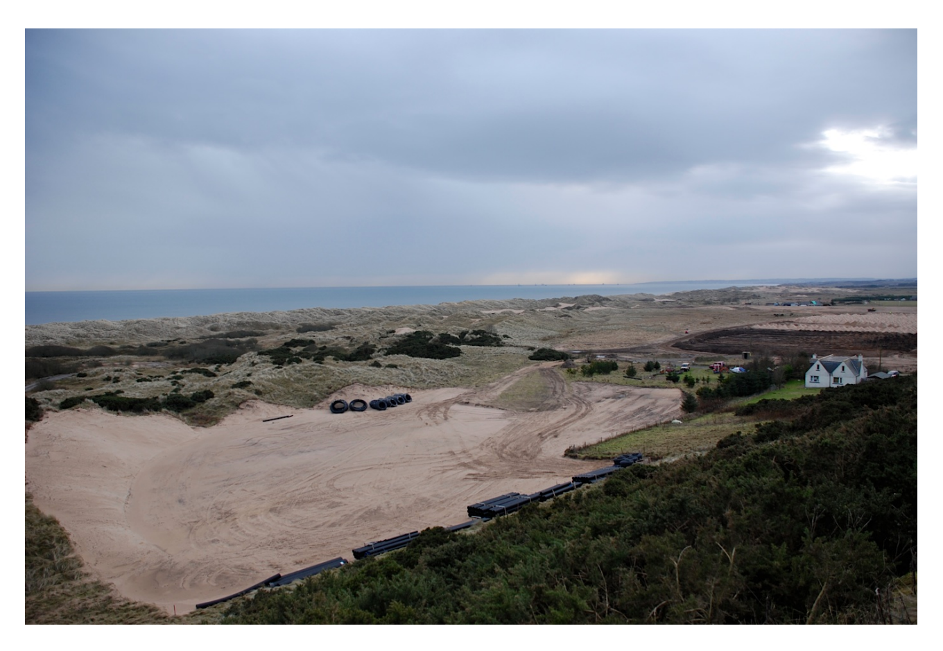
Figure 13 Extensive vegetation stripped in contravention of planning consent