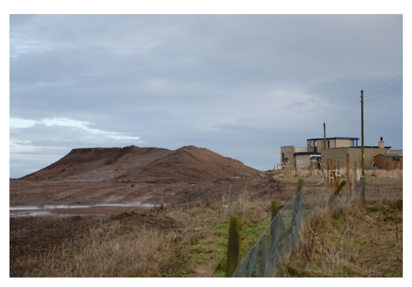
Figure 11 Bund constructed behind Hermit Point

On 21 October 2010, after TIGLS removed the existing fence, a large 20 ft high mound of earth - a bund or "berming" as Donald Trump referred to it - began to be erected on the north-west side of Hermit Point (see Fig. 11). On 27 October more soil was added to the bund.