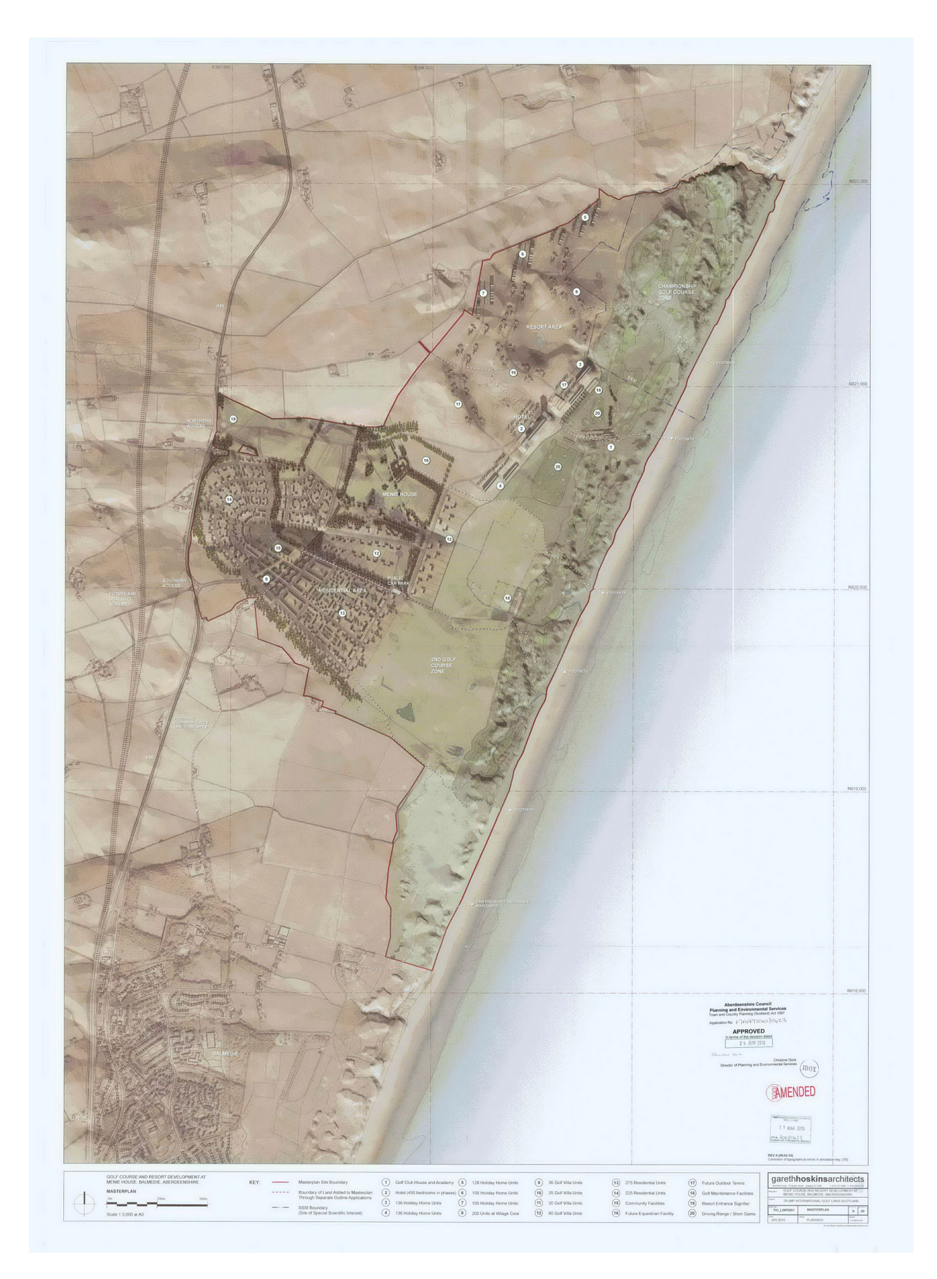
Figure 2 Approved Masterplan for Menie Estate