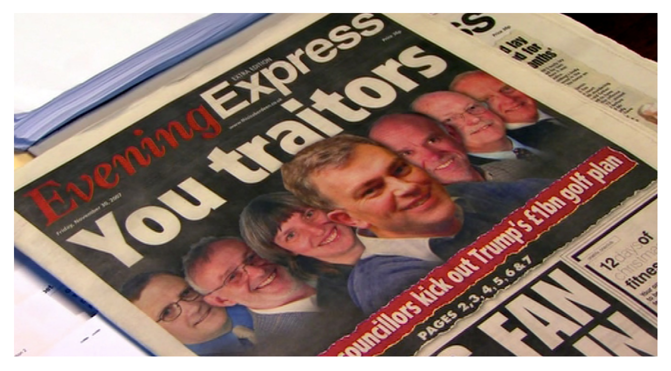
Figure 17 Evening Express 30 November 2007

Perhaps the most notorious example of this was following the planning decision on 29 November 2009 to reject the planning application. The Evening Express published the pictures of all seven councillors who had voted against the application under the headline "You traitors". The paper's editorial, "Betrayed by stupidity of seven", described the councillors as "small-minded numpties", "misfits", "buffoons in woolly jumpers", traitors to the North-east" and "no-hopers".<sup>66</sup>