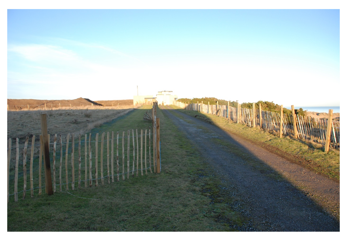
Figure 9 New fence erected by TIGLS along drive to Hermit Point