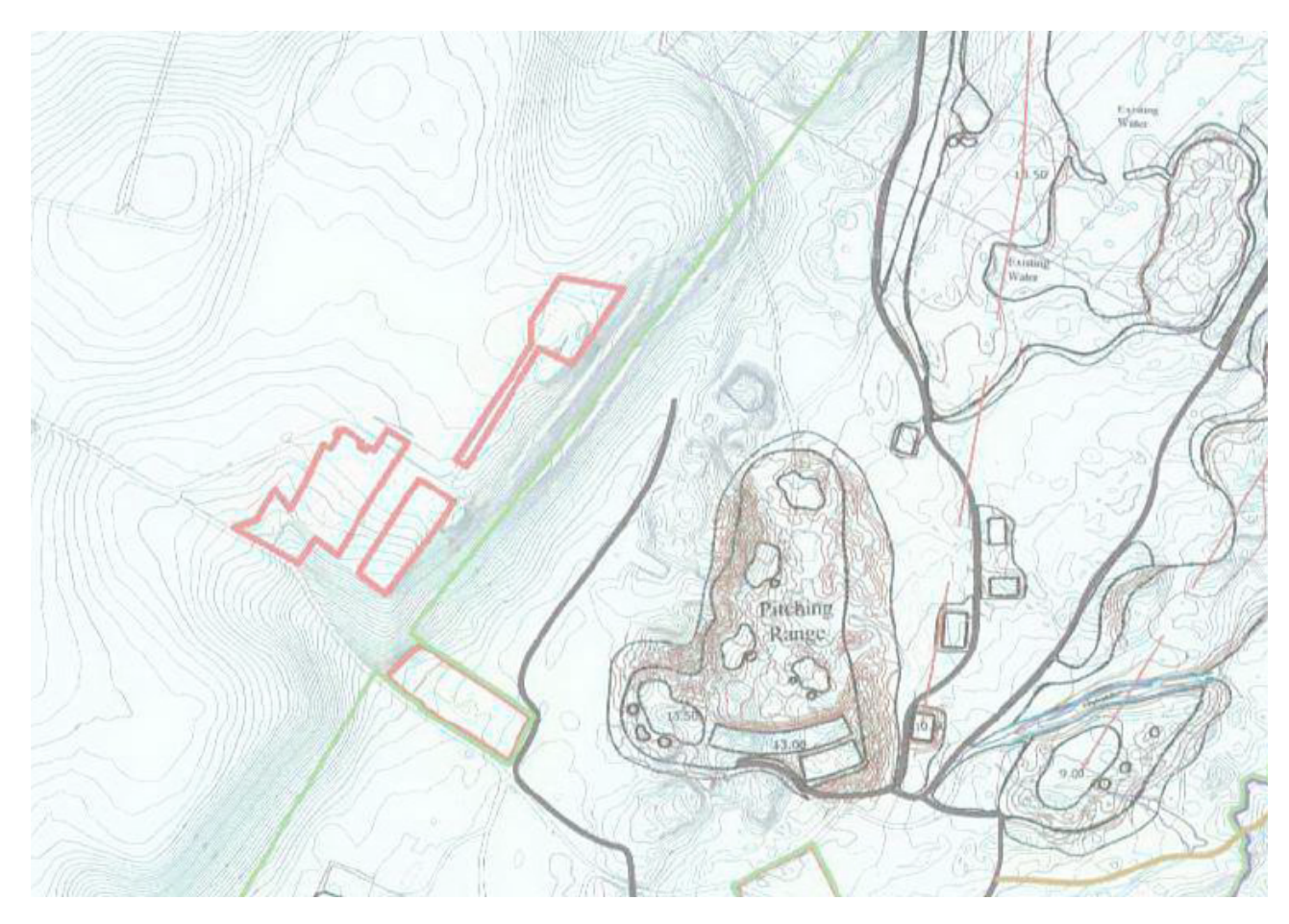
Figure 14 Approved Earthworks Plan showing no planned bunds or removal of vegetation as shown in Figures 11 and 13. Extract from Planning Consent APP/2010/1535 "Approved Earthworks 5.7.2010