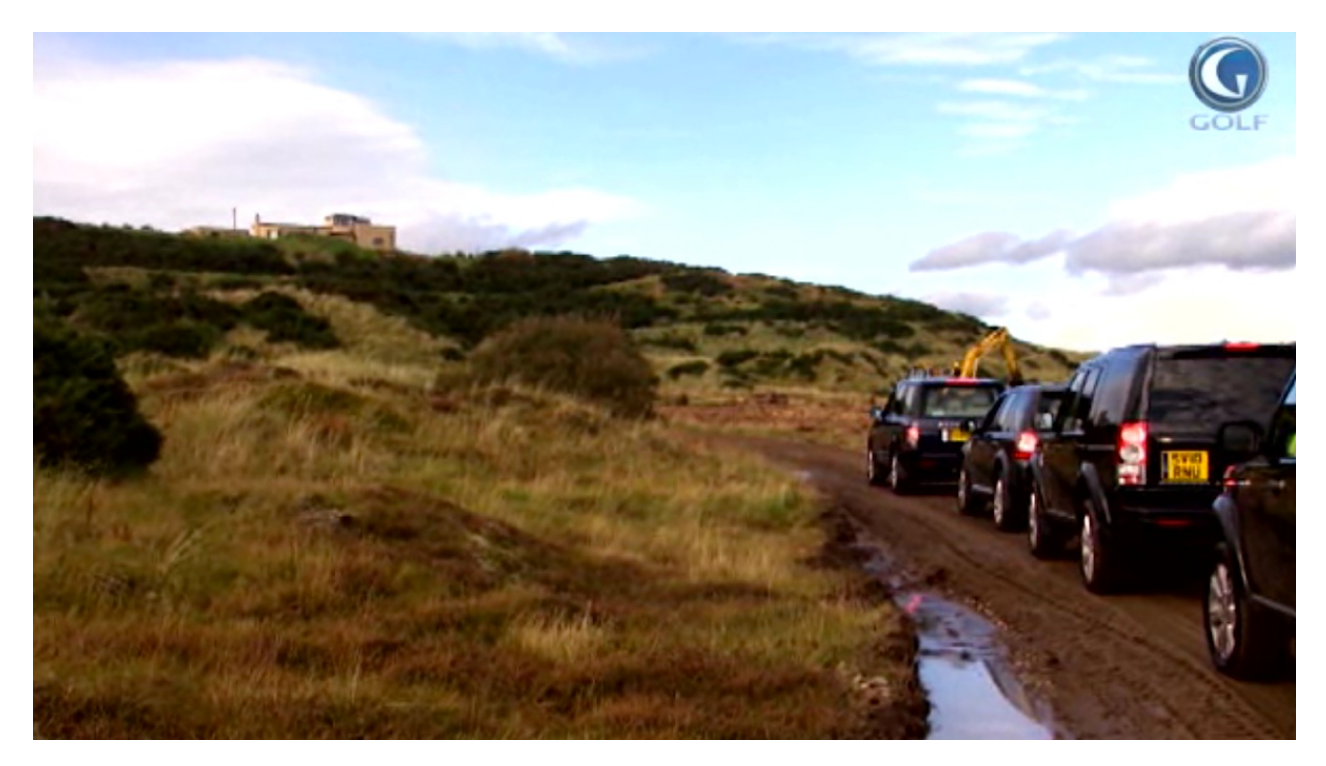
Figure 6 Donald Trump's convoy 7 October 2010

boundaries defined on the Ordnance Survey map.<sup>24</sup> The boundaries of the Milnes' property is shown in Figure 5.