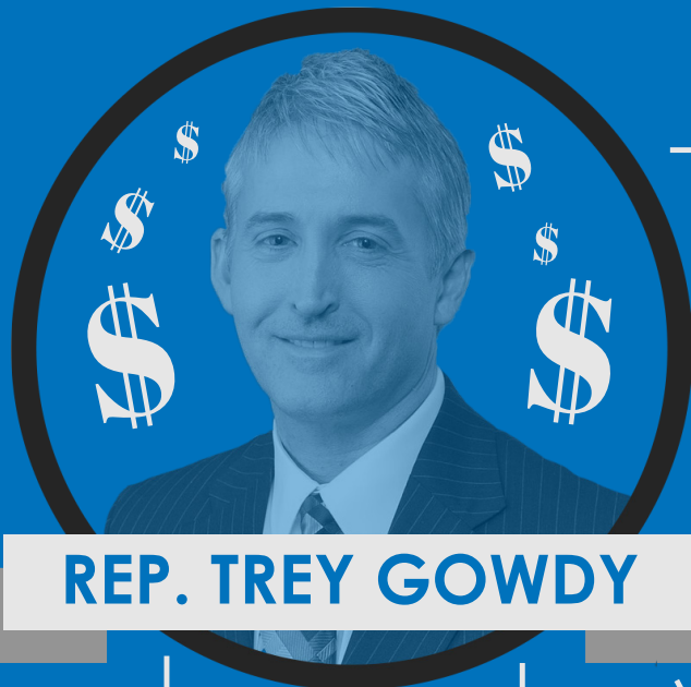
REP. TREY GOWDY

Trey Gowdy was a special guest at a fundraiser for Congressman and Benghazi Committee member Peter Roskam.