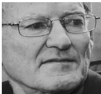
George Gilder, an ASOCS investor and chair of its Advisory Board, says Israel is a leader of scientific progress, civilization, freedom, morality and democracy.

Praised by Rush Limbaugh as “a true American genius,” Gilder opposes evolution and government welfare. Although he argues that “Native American culture” is “corrupt,” “unsuccessful” and “failed,” and that African cultures are “destructive,” “a