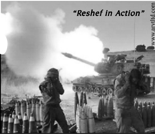
"Reshef in Action"