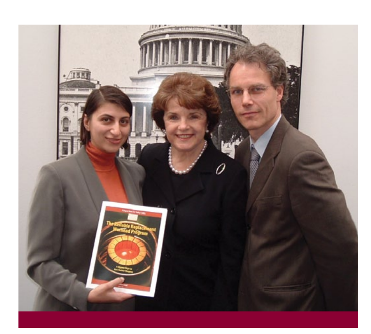
Your advocates in DC: Tri-Valley CAREs members discuss our report on new nuclear weapons with Senator Dianne Feinstein.