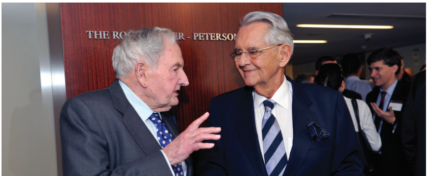
David Rockefeller and Peter G. Peterson, former chairs of the CFR Board of Directors, at a CFR event.

Madeleine K. Albright, Director Emerita Leslie H. Gelb, President Emeritus Maurice R. Greenberg, Honorary Vice Chairman Peter G. Peterson, Chairman Emeritus David Rockefeller, Honorary Chairman