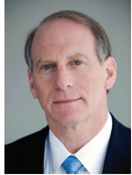
Richard N. Haass

Founded in 1921, the Council on Foreign Relations’ ranks include many of the most prominent leaders in the foreign policy arena. With over 4,900 members, CFR’s roster includes government officials, renowned scholars, business leaders, acclaimed journalists, prominent lawyers, and distinguished nonprofit professionals. The membership is divided almost equally among those living in New York, Washington, DC, and across the country and abroad, and it is a group unmatched in accomplishment and diversity in the field of international affairs.