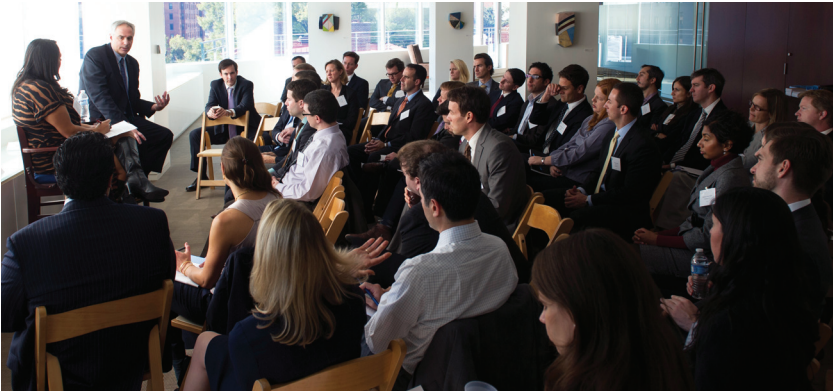
Term members participating in the annual conference.

The Stephen M. Kellen Term Member Program, established to cultivate the next generation of foreign policy leaders, encourages promising young men and women from diverse backgrounds to engage in a sustained conversation on international affairs and U.S. foreign policy. Each year a new class of term members between the ages of thirty and thirty-six is elected to serve a five-year term. Term members enjoy a full range of activities, including events with high-profile speakers, an annual Term Member Conference, roundtables, trips to various sites, including military bases, international organizations, and U.S. governmental agencies, and one weeklong study trip abroad every two years.