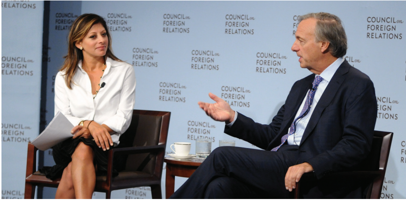
CFR member Maria Bartiromo discusses global economics with Ray Dalio, founder and co-chief investment officer of Bridgewater Associates, L.P., as part of the CEO Speaker series.