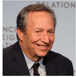
Lawrence H. Summers