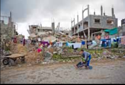
Palestinian children play in front of rubble in a destroyed street in Beit Hanoun, 18 February 2015. © Activestills; An UNRWA school in az-Zaitoun, used as a shelter for Palestinians displaced during Operation Protective Edge, 14 September 2014; Palestinians sit by the rubble of destroyed homes in the northern Gaza Strip. © UN Photo/Shareef Sarhan.