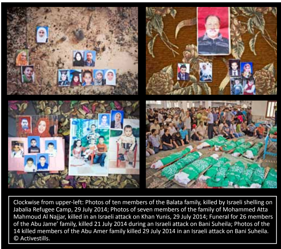
Clockwise from upper-left: Photos of ten members of the Balata family, killed by Israeli shelling on Jabalia Refugee Camp, 29 July 2014; Photos of seven members of the family of Mohammed Atta Mahmoud Al Najjar, killed in an Israeli attack on Khan Yunis, 29 July 2014; Funeral for 26 members of the Abu Jame' family, killed 21 July 2014 during an Israeli attack on Bani Suheila; Photos of the 14 killed members of the Abu Amer family killed 29 July 2014 in an Israeli attack on Bani Suheila.

of the organized fighting forces of a non-state party 65 may be targeted when there is fighting, this is not true for those who assume exclusively political, administrative or other non-combat functions. 66 Mere membership of a political entity with an armed component – such as is the case with Hamas - cannot be said to satisfy this requirement, and Israel’s targeting of such individuals on this basis alone 67 represents a clear breach of Rule 1 of Customary International Humanitarian Law. To this end, all efforts must be made to verify the identity and activity of the civilian alleged to be participating in hostilities.