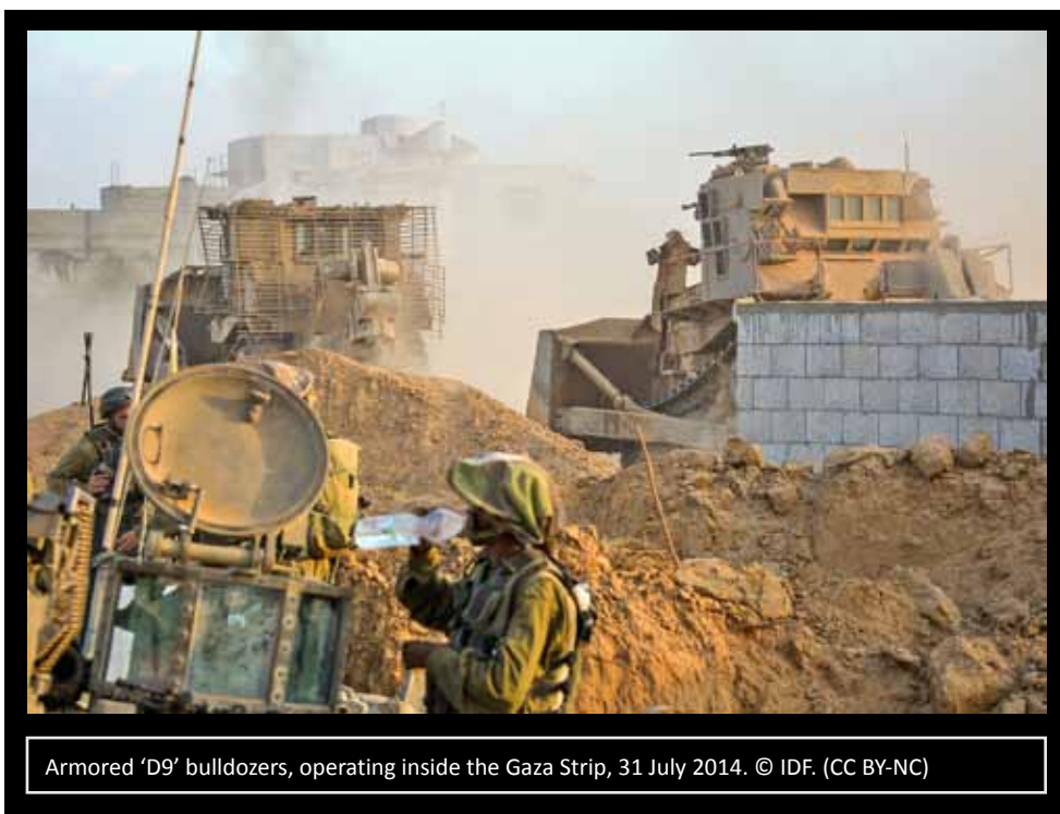
Armored 'D9' bulldozers, operating inside the Gaza Strip, 31 July 2014.

of the ground incursion, and was accompanied by the forced displacement of Palestinians in the northern Gaza Strip – in Shuja'iyya, az-Zaitoun, Jabalia, Beit Hanoun, and Beit Lahiya (which have a combined population of 298,137 131 ), whilst in the south of the Gaza Strip, residents in East Khan Yunis were advised to evacuate to the city center; and to Rafah in the south. Civilian objects in these areas were then apparently subject to intentional and systematic destruction by the Israeli military.