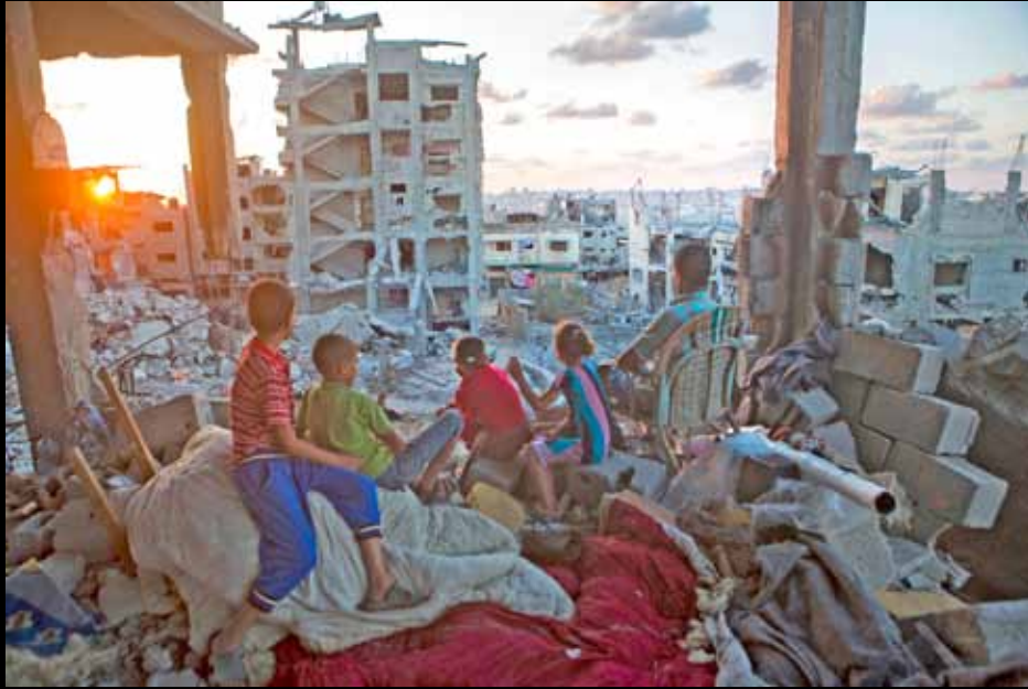
A Palestinian family sits in their destroyed home, in at-Tuffah district of Gaza City, 21 September 2014.

160. In the same month, a report from Save the Children found that an average of 75% of children surveyed inside the Gaza Strip experienced unusual bedwetting regularly; up to 89% of parents reported their children suffering consistent feelings of fear, while more than 70% of children said they worried about another war. On average seven out of ten children interviewed suffered regular nightmares. Furthermore, Israeli actions not only directly contribute to widespread mental illness among children in the Gaza Strip, but also prevent the effective treatment of such illness: