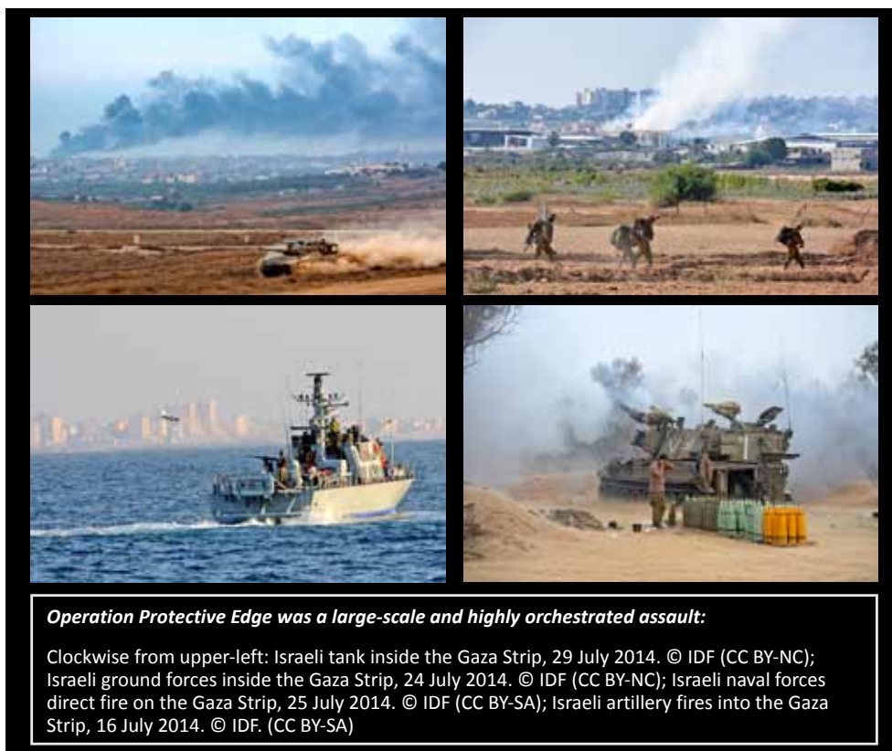
Operation Protective Edge was a large-scale and highly orchestrated assault:

Clockwise from upper-left: Israeli tank inside the Gaza Strip, 29 July 2014. © IDF (CC BY-NC); Israeli ground forces inside the Gaza Strip, 24 July 2014. © IDF (CC BY-NC); Israeli naval forces direct fire on the Gaza Strip, 25 July 2014. © IDF (CC BY-SA); Israeli artillery fires into the Gaza Strip, 16 July 2014. © IDF. (CC BY-SA)