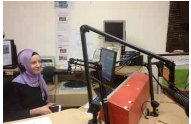
Girls Radio Club hit the airwaves