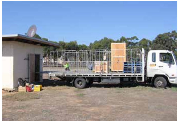
The new transmitter arrives on site

It's not installed yet, but when it is we hope to be able run at somewhat higher power than our current 2kW, the maximum the Harris can do. In 2000 3CR applied to ACMA for a power increase to 3.5kW, which was granted. Now we have a transmitter that could achieve it.