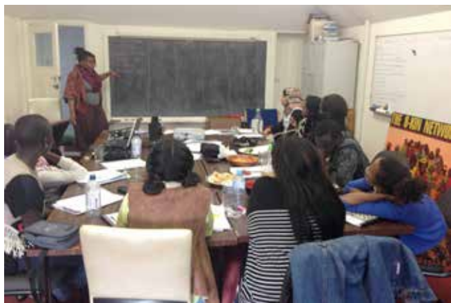
Girls Radio Club training