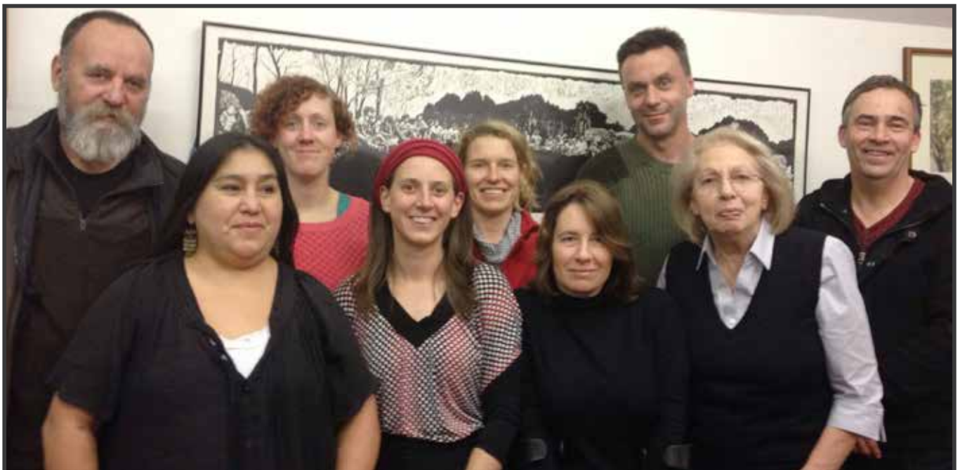
3CR Committee of Management

Ethiopian Community Association Federation of Community Legal Centres Friends of the Earth Hararian Community Association of Australia Hepatitis C Council of Victoria Housing for the Aged Action Group Latin American Info Centre LICAU_SED Maritime Union of Australia Melbourne Unitarian Church Mental Illness Fellowship National Union of Workers Ogaden Community Of Australia Roominations Save Albert Park Short Statured People of Australia (SSPA) Squatters and Unwaged Workers Airwaves Tenants Union Of Victoria The Boite Victorian Jazz Club Victorian Labour College Voice of West Papua