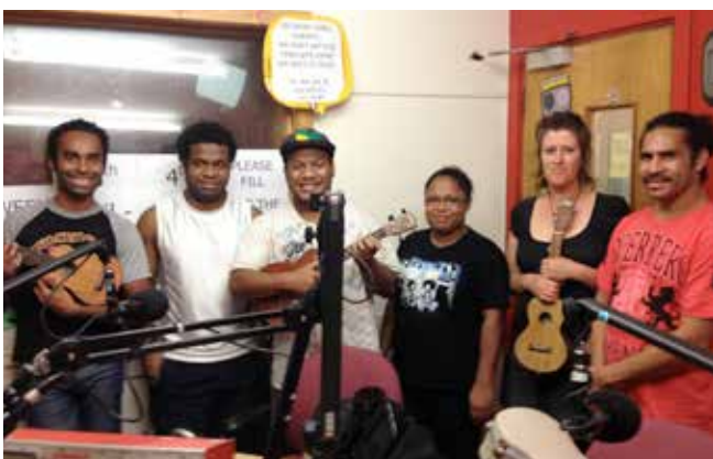
Voice of West Papua live in the studio