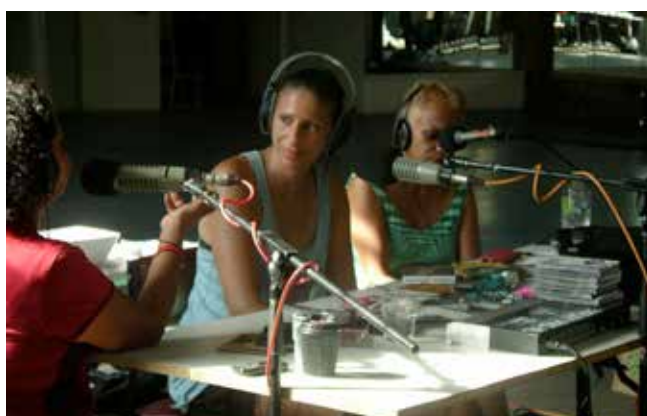
IWD broadcast from Fitzroy Stars Gym (MAYSAR)