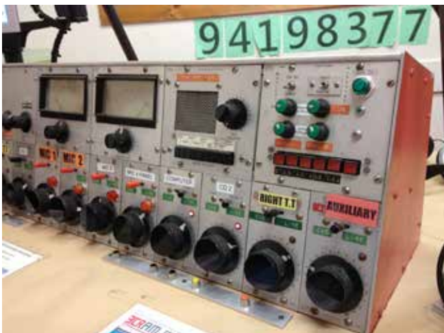
Studio 1 panel

We also facilitated paid station tours, studio hire and other station services.