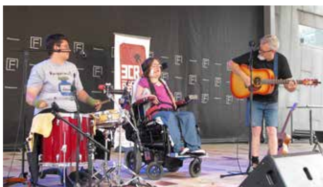
Welcome to Our World, IDPWD broadcast