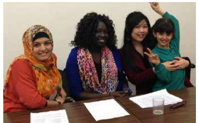
Girls Radio Club participants