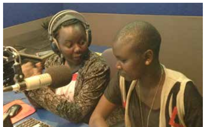
Girls Radio Club participants