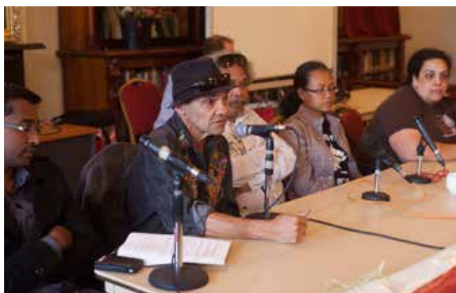
Sovereignty and the Struggle for Independence public forum