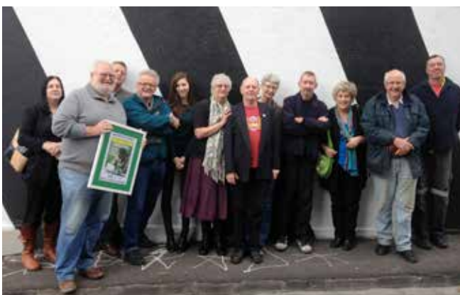
The presenters and supporters of the Connolly Association