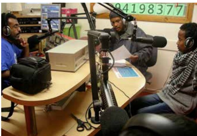
Live in studio 1