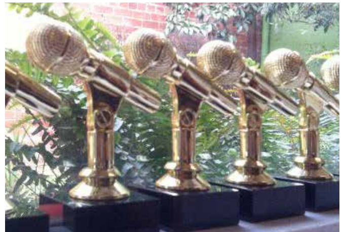
The line up of golden mics ready for the 2013 3CR radio awards night

New volunteers bring new perspectives, enthusiasm and contribute to the continuing success of community radio at 3CR