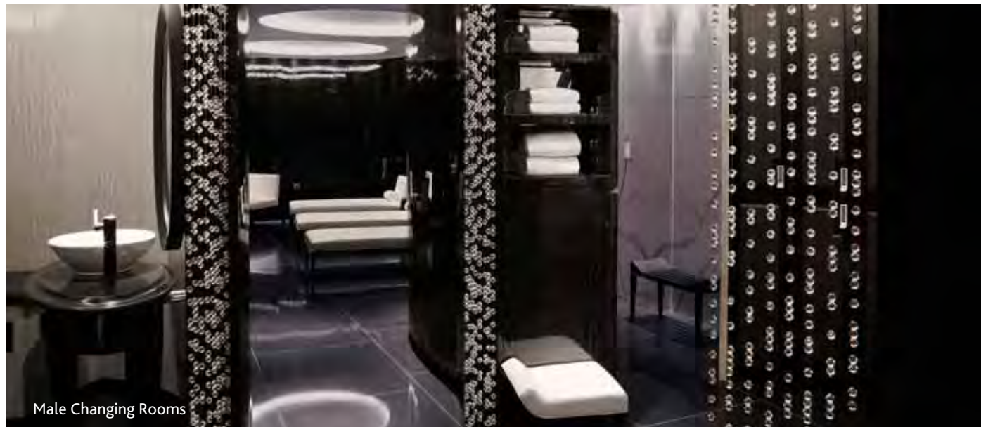
Male Changing Rooms

Our Lifestyle Programmes help to optimize your wellbeing and vitality and can last a day, a week or run over a period of months. They address everyday health and lifestyle issues such as stress, sleep problems, detox and fertility and are adjusted according to your needs and time available.