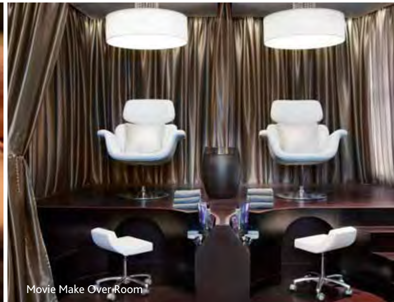
Movie Make Over Room