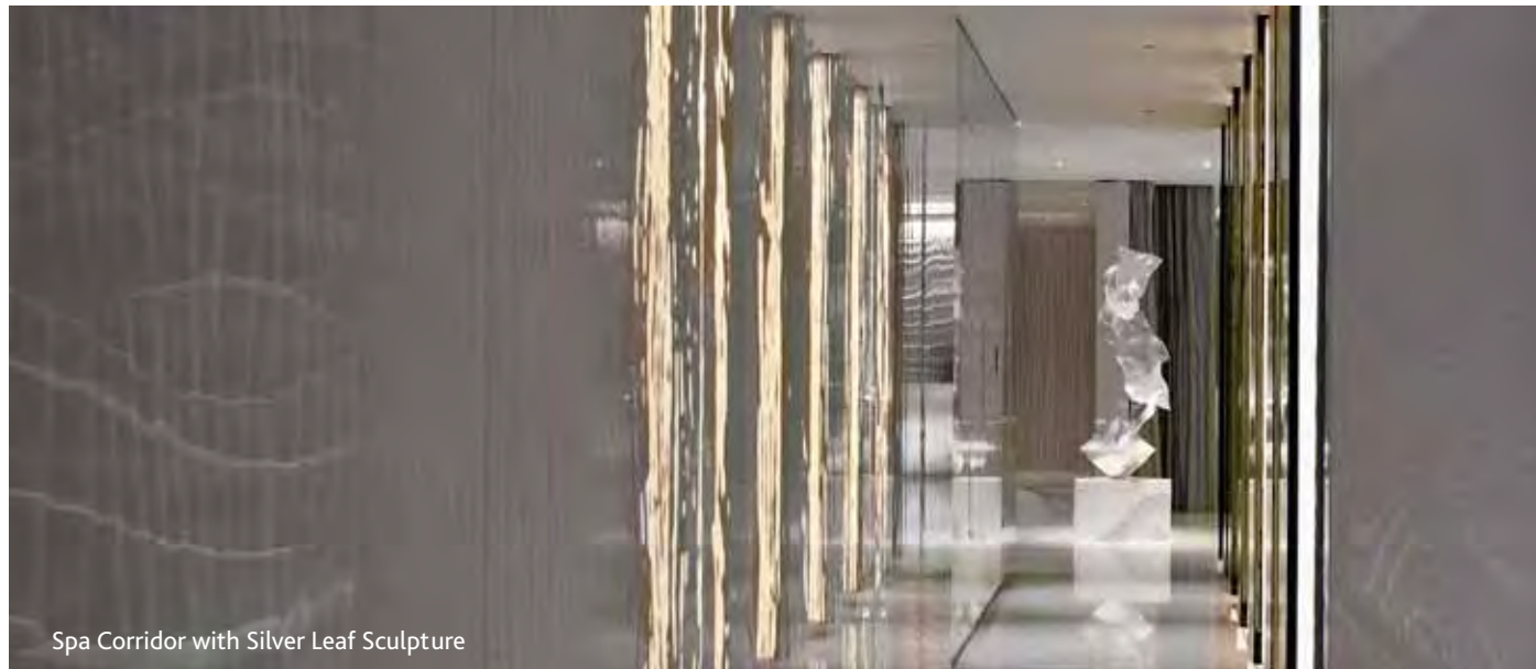
Spa Corridor with Silver Leaf Sculpture

A highly experienced naturopathic practitioner, your Gatekeeper is the first person we recommend meeting to be expertly assessed through an in-depth medical and lifestyle consultation and Iris diagnosis. Functional Diagnostic Laboratory tests may be suggested which can be performed on site or in the comfort of your own home. This information is then used to tailor your personal path to wellness and oversee each step of the journey.