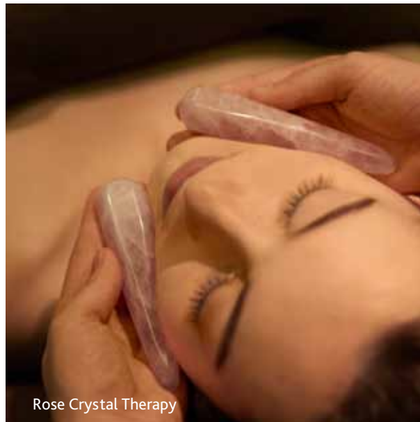
Rose Crystal Therapy

This is the ultimate Day Spa destination.