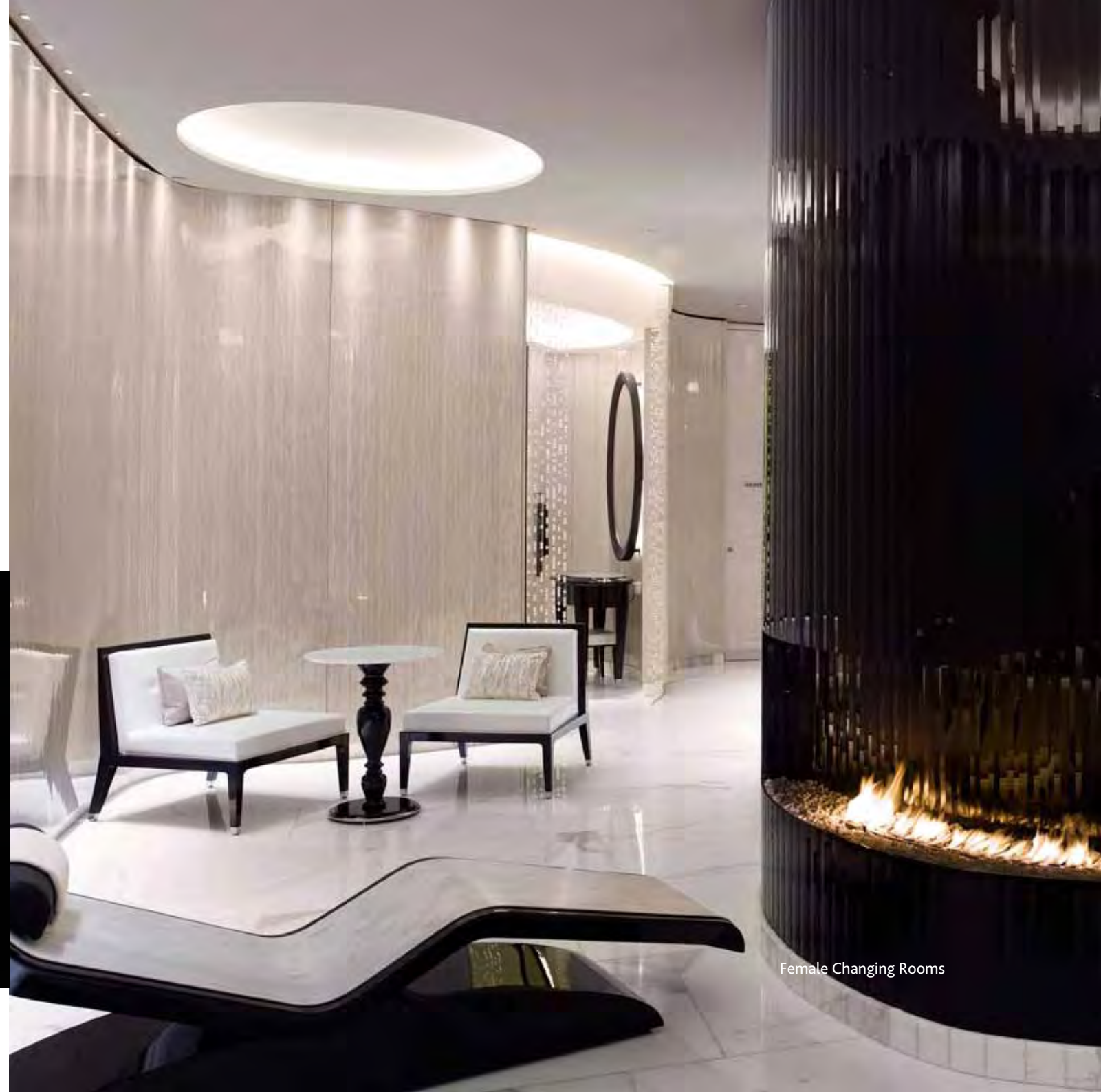
Female Changing Rooms