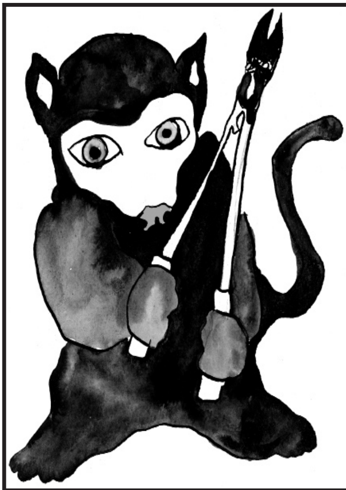
Artwork credit: Brandon Bright

7/21: In England , seven large trucks were sabotaged at the Cutacre Coal Mine. Reports said that metal hair pins were cut to length, coated in superglue and inserted deep into the locks of the vehicles.