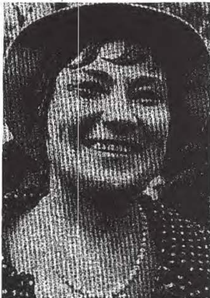
(U) Bella Abzug

(S-CCO) Abzug chaired the Government Information and Individual Rights Subcommittee of the Committee on Government Operations. In mid-1975, with the Church Committee holding preliminary investigations in executive session, Abzug got hold of some of the more sensational information relating to Shamrock and Minaret. (The information was apparently leaked by Church Committee staffers.) 69 The climate for a