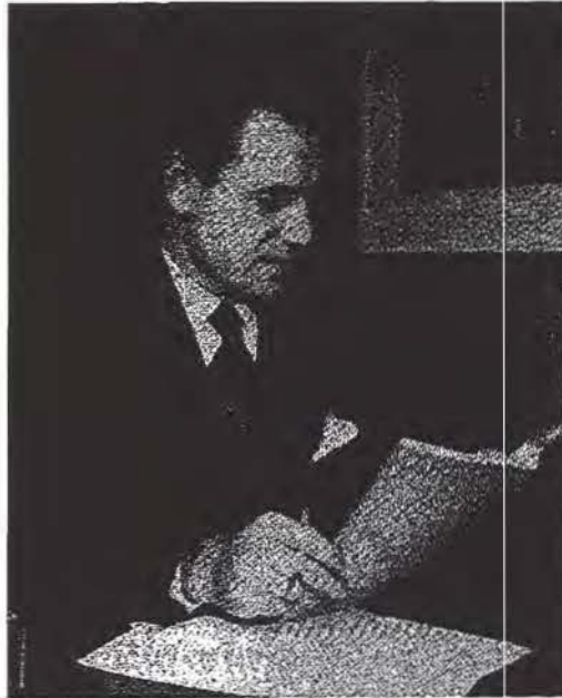
(U) Nelson Rockefeller

future transgressions, and it set forth specific prohibitions of certain activities like illegal wiretaps and participation in domestic intelligence operations. (It declined to rule on assassinations, pleading lack of time to get to the bottom of these allegations.) But by then no one was listening. 47