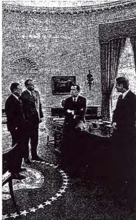
(U) President Nixon and his inner circle, 1973

(U) The Nixon administration managed to cover over the political effects of the break-in until after the elections in November. But when Congress returned in January, it was ready to investigate. In February 1973, the Senate voted to establish a Select Committee, commonly referred to as the Ervin Committee after Senator Sam Ervin, Democratic senator from North Carolina, to hold hearings. At the time, no one associated with the committee knew where they would get information, since the administration was keeping a tight lip, and the Watergate burglars weren't talking. But on March 23, one of the burglars, James McCord, turned state's evidence. The federal judge, John Sirica, had been pressuring the defendants by threatening lengthy prison terms if they did not cooperate. Now McCord was cooperating, and the entire thing began to unravel. The president, concerned with getting on with his second term, tried to shush the whole thing.