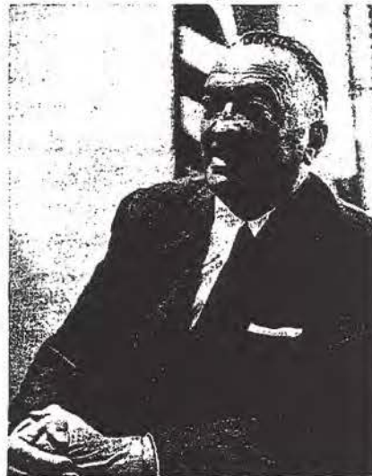
(U) J. Edgar Hoover

Withheld from public release Pub. L. 86-36