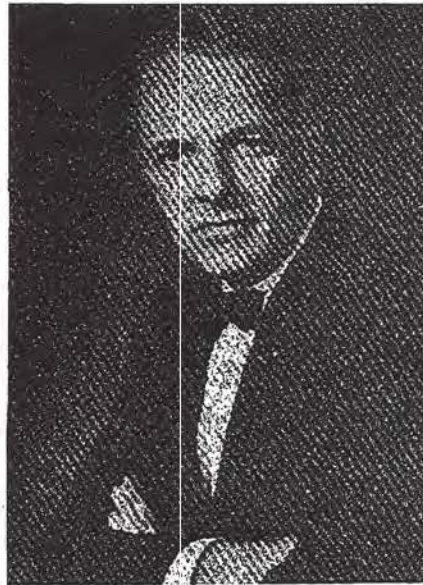
(U) Otis Pike