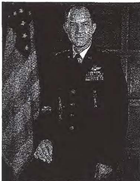
(U) Lieutenant General Sam Phillips