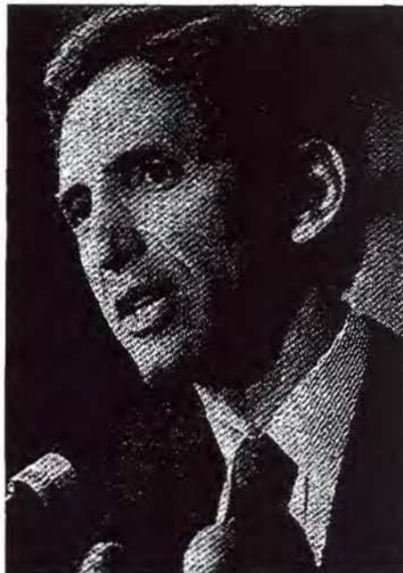
(U) Daniel Ellsberg

(U) It was a very large document indeed - over 7,000 pages - and Ellsberg spent thousands of dollars making copies. For several years he tried to use the papers to convince policy makers (Henry Kissinger and William Fullbright, among others) to change U.S. policy in Southeast Asia, but in vain. As a last resort, then, in 1971 he turned the documents over to the newspapers. 4