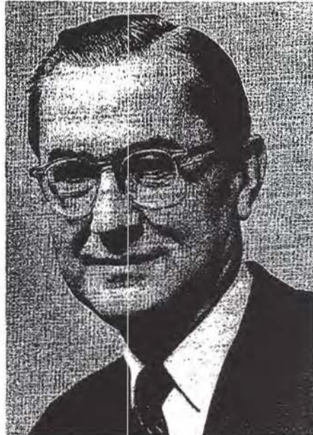
(U) William Colby

(U) The "Family Jewels" was a 693-page report of possibly illegal CIA activities through the years. Colby, who had become DCI by the time the report was finished, informed the four chairmen of the House and Senate committees which had oversight of the CIA and succeeded in convincing all of them that the matter was over with and that CIA would clean up its own house. But by then so many people within the CIA knew about the report that its eventual exposure became almost inevitable.