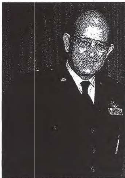
(U) Lieutenant General Lew Allen

(TS-CGO-TK) Lew Allen once described candidly the baggage that he brought with him to NSA. Schlesinger was convinced that NSA was too large and too expensive, and he told Allen to look into the charge. (He found it to be unsubstantiated.) He had always been impressed with the technical competence resident at NSA, but he felt that "NSA, like many large bureaucracies, had a lot of turf. . . ." Having come from the NRO side of the satellite business, he knew firsthand of NSA's desire to control SIGINT satellites and ground stations, and he felt that NSA harbored "ambitions for responsibilities that somewhat exceeded the grasp." He had heard that NSA had enormous warehouses of undecipherable tapes. (This too he found to be exaggerated.) 41