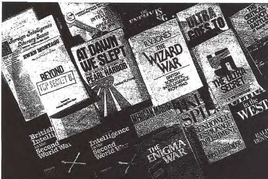
(U) World War II SIGINT histories