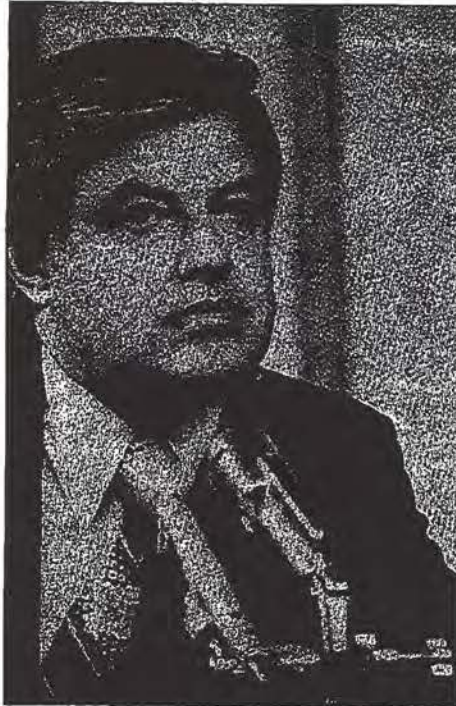
(U) Frank Church

some Defense paperwork relating to domestic wiretaps which referred to NSA as the source of the request. The committee was not inclined to make use of this material, but the two staffers leaked the documents to Representative Bella Abzug of New York, who was starting her own investigation. Church terminated the two staffers, but the damage had been done, and the committee somewhat reluctantly broadened its investigation to include the National Security Agency. 49