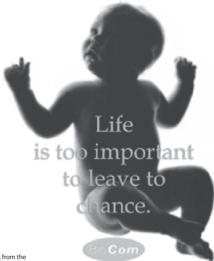
Artwork from the Critical Arts Ensemble