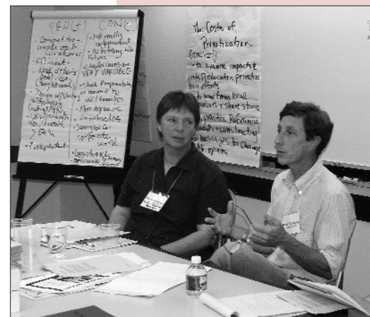
Photo from August 2004 newsletter of Independent Community of Educators-United Federation of Teachers, New York.

Our research conscientiously monitors publications, conferences, web sites, and activities of the full spectrum of the U.S. Political Right, from the Christian Right's political agenda, to the militarism and world view of neoconservatives, to the hateful and the racist propaganda of nativist anti-immigrant groups.