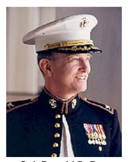
Col. Ronald D. Ray

WTC Building 7 was 610 feet tall, 47 stories. It would have been the tallest building in 33 states. Although it was not hit by an airplane, it completely collapsed into a pile of rubble in less than 7 seconds at 5:20 p.m. on 9/11. However, no mention of its collapse appears in the 9/11 Commission's "full and complete account of the circumstances surrounding the September 11, 2001 terrorist attacks." (Video of WTC 7's collapse is at <a href="http://www.whatreallyhappened.com/IMAGES/WTC7">http://www.whatreallyhappened.com/IMAGES/WTC7</a> Collapse.wmv.) And six years after 9/11, the Federal government has yet to publish its promised final report that explains the cause of its collapse.