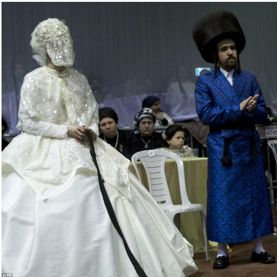
The rabbis and the groom dance to fulfil the Mitzvah tantz part of the ceremony as onlookers snap pictures of the wedding