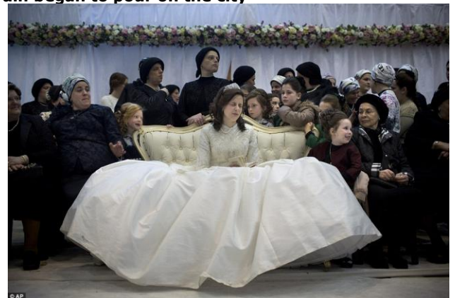
Guests share a joke as the bride closes her eyes in prayer, her dress spread out around her