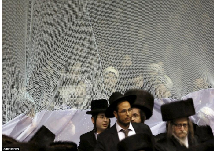
A thin gauze curtain separates the male guests from the female guests at the large wedding