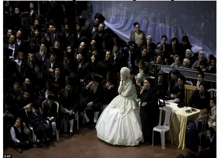
Captivated: The guests watch, fascinated by the dancing as the bride looks on