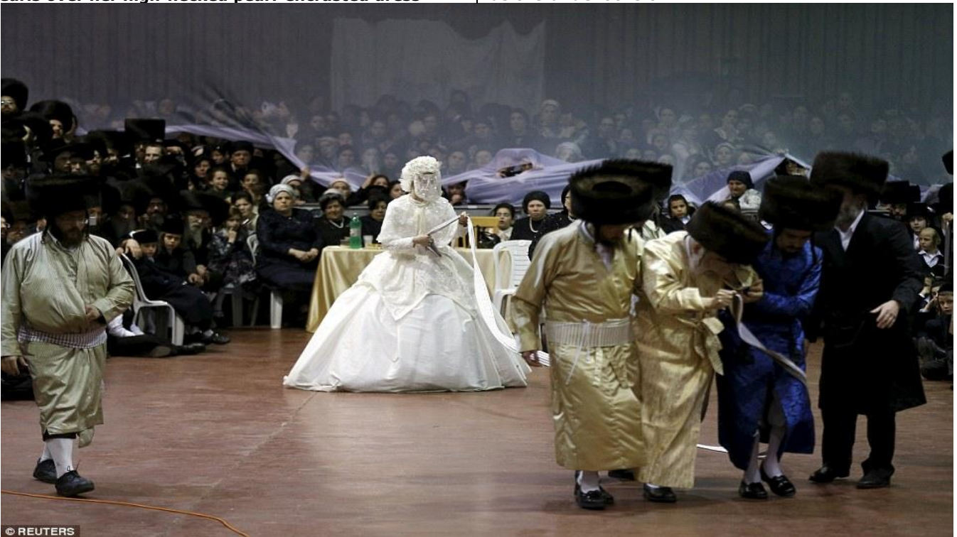
The bride takes part in the 'mitzva tantz', the custom in which relatives dance in front of the bride after her wedding ceremony