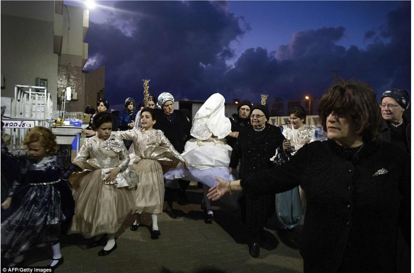
The family of the bride, dressed in their wedding finery, guide her into the venue before the rain began to pour on the city

The wedding venue was so full that some guests were forced to use binoculars just to catch a closer glimpse of the bride and groom as they were married. Members of the congregation held hands and danced during the ceremony and sweets were handed out to children before the wedding party enjoyed a traditional meal.