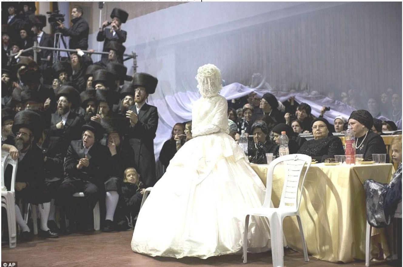
Dance for me: The veiled bride arrived in the men's section of the wedding as the male well-wishers, wearing their traditional shtreimel hats, danced to fulfil the Mitzvah tantz part of the wedding, where men and honoured rabbis are invited to dance for the bride

Inside, a floor-to-ceiling gauze curtain separated men from women and male well-wishers dressed all in black wore the traditional shtreimel hats.