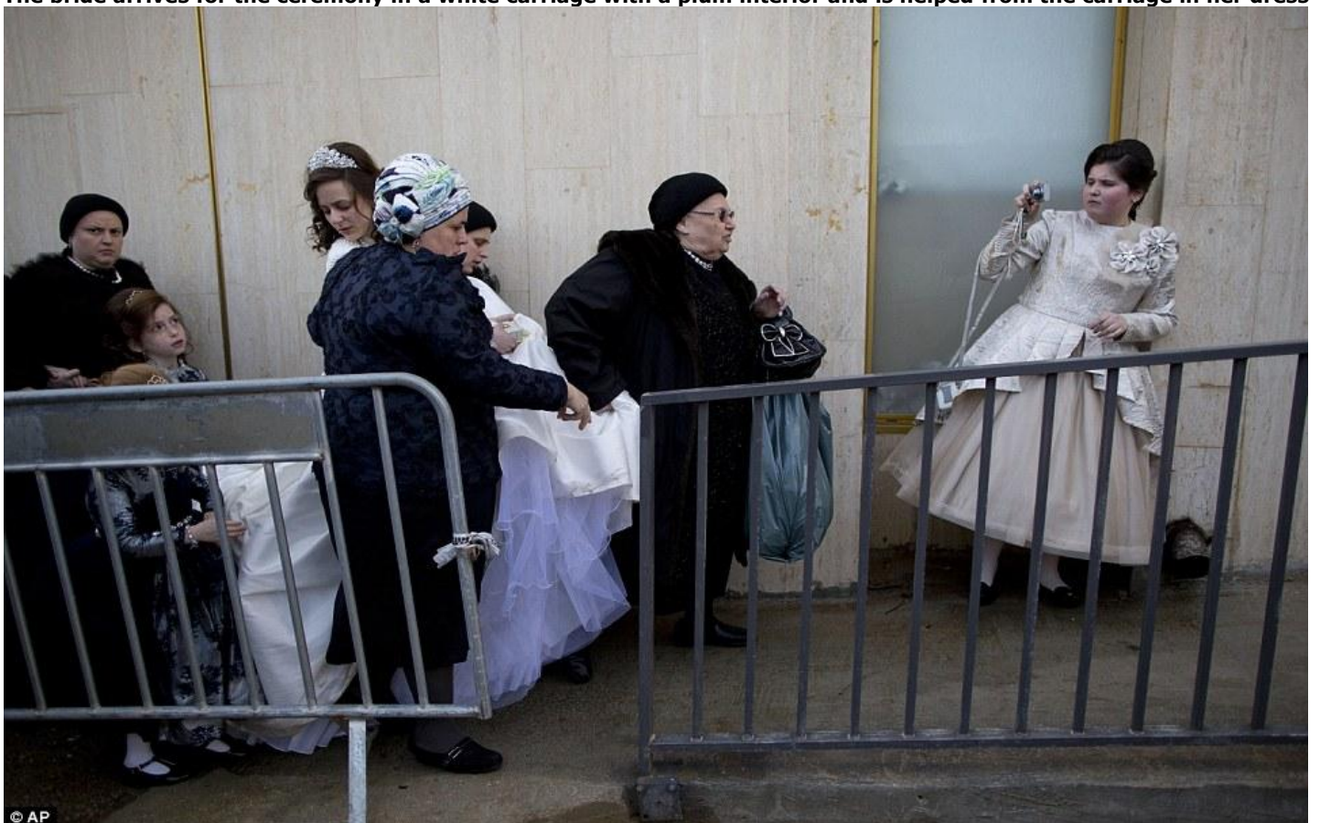
The bride arrives for the ceremony in a white carriage with a plum interior and is helped from the carriage in her dress