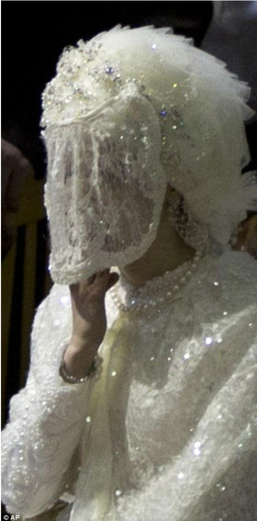
The bride wore a tiara under the intricate veil and a string of pearls over her high-necked pearl-encrusted dress