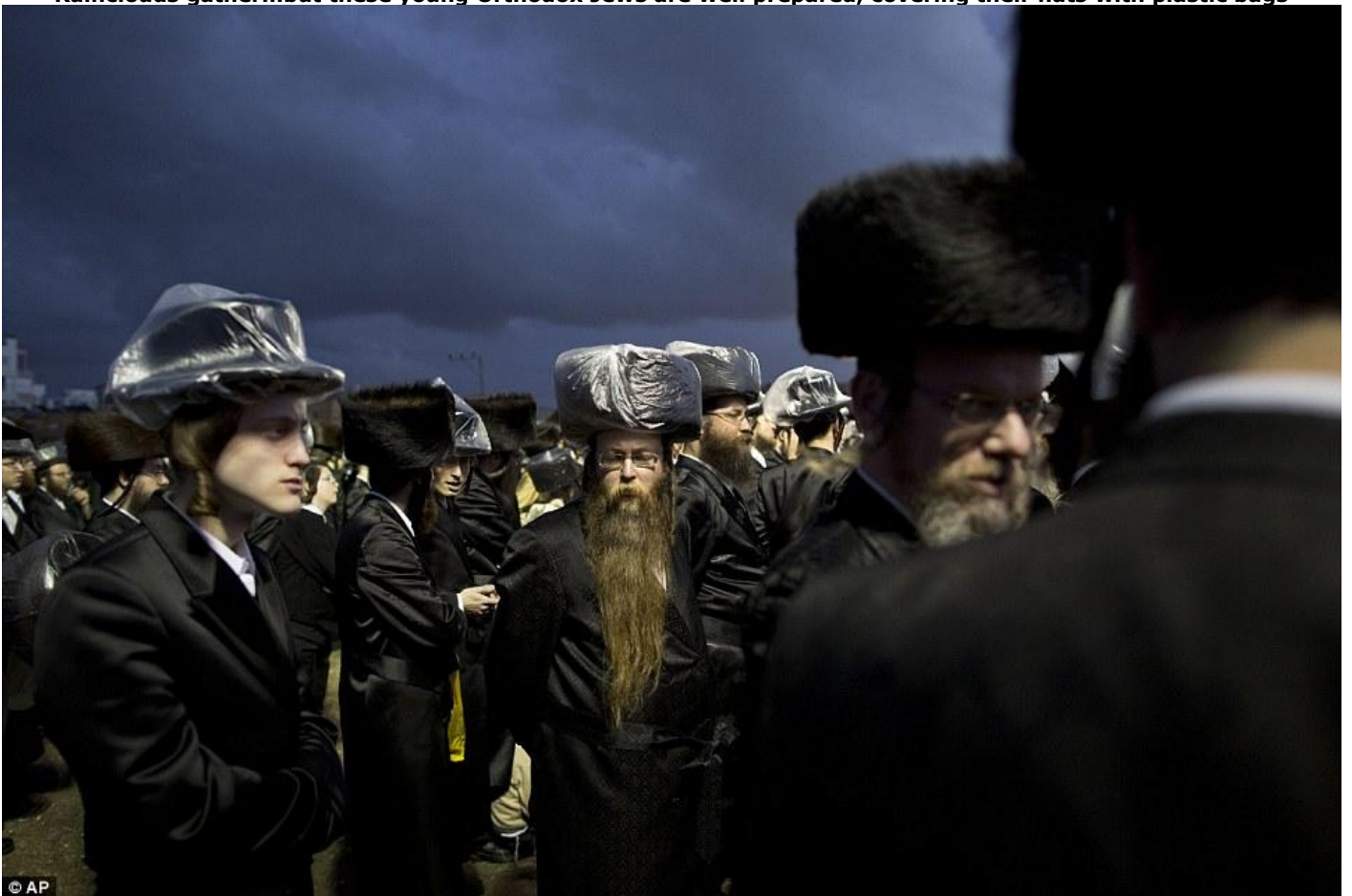
Rainclouds gather...but these young Orthodox Jews are well prepared, covering their hats with plastic bags