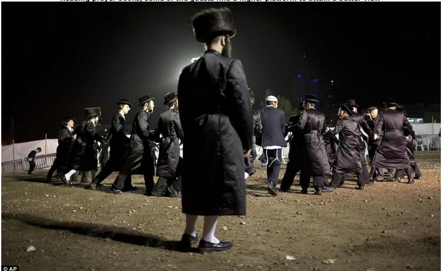
Reading prayer books, some of the guests find a higher platform to attain a better view