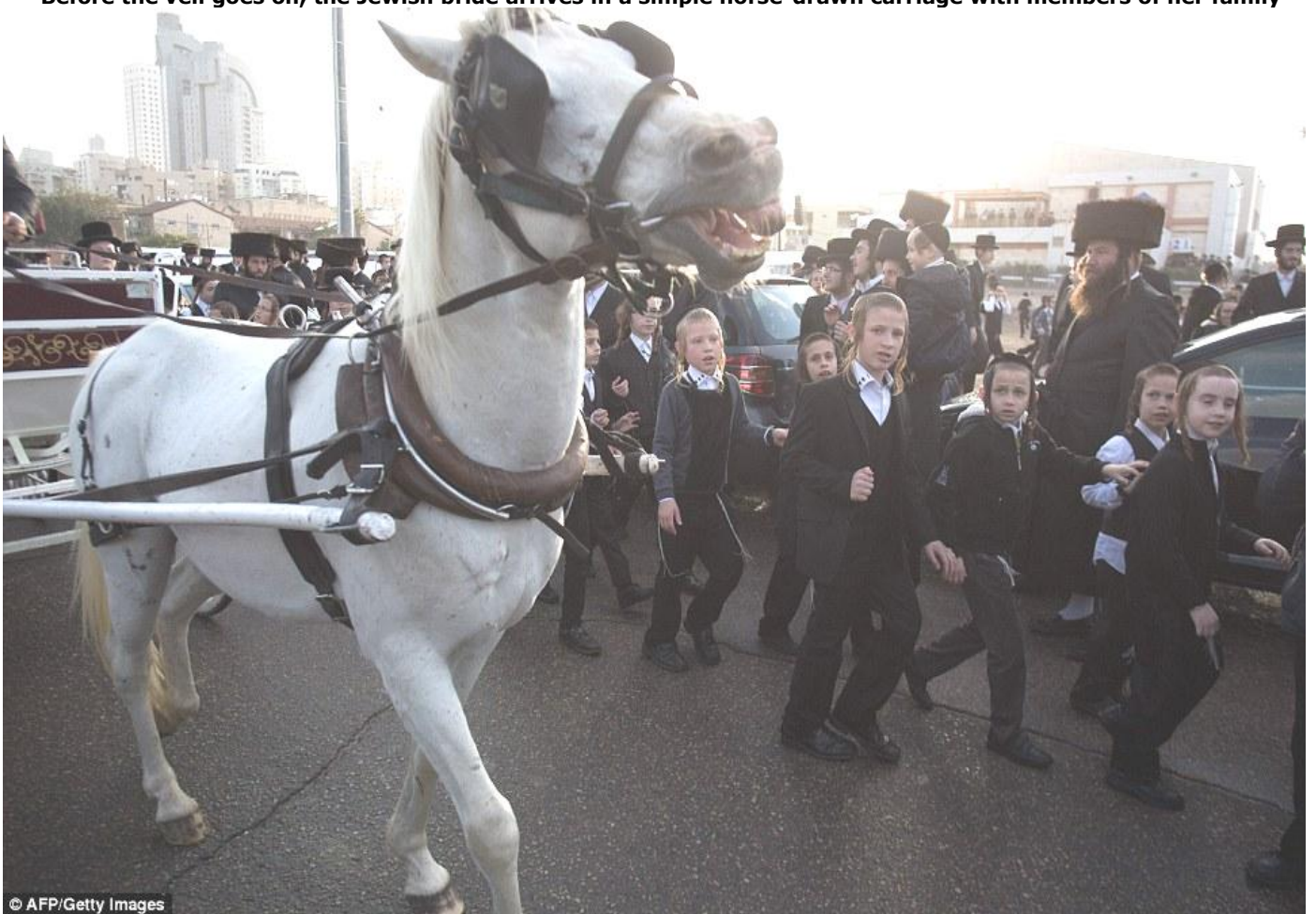
Before the veil goes on, the Jewish bride arrives in a simple horse-drawn carriage with members of her family