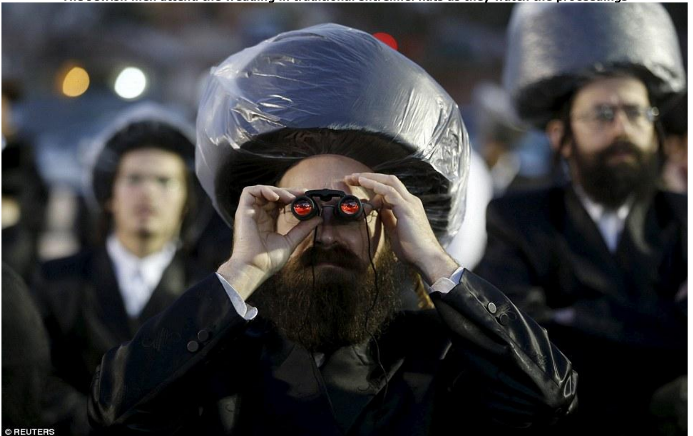
The Jewish men attend the wedding in traditional shtreimel hats as they watch the proceedings