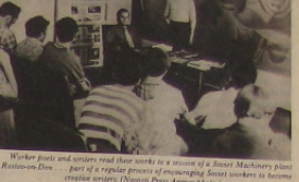
Workers poets and writers read their works at a session of a Soviet Workers' party in Moscow.