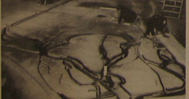
Soviet scientific workers build a model of the Neva River inlet and the Gulf of Finland to test anti-flood measures.

Highlights of the afternoon included performances by young ballet students of Yalpine and Russian dancing, a Greek Folk Dancing group, a young Polish pantina, a Chinese