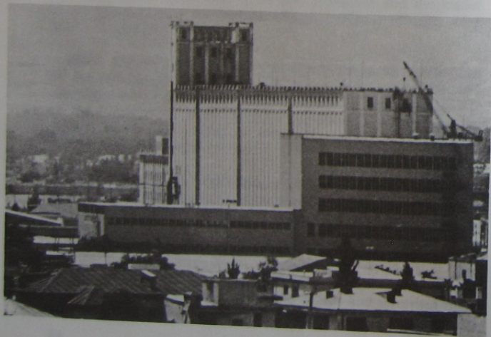
For over 60 years the Soviet Union has been assisting Afghanistan to build up its economy, build roads, educational establishments and other facilities. The picture shows a grain elevator in Kabul built with the technical and economic assistance of the USSR.