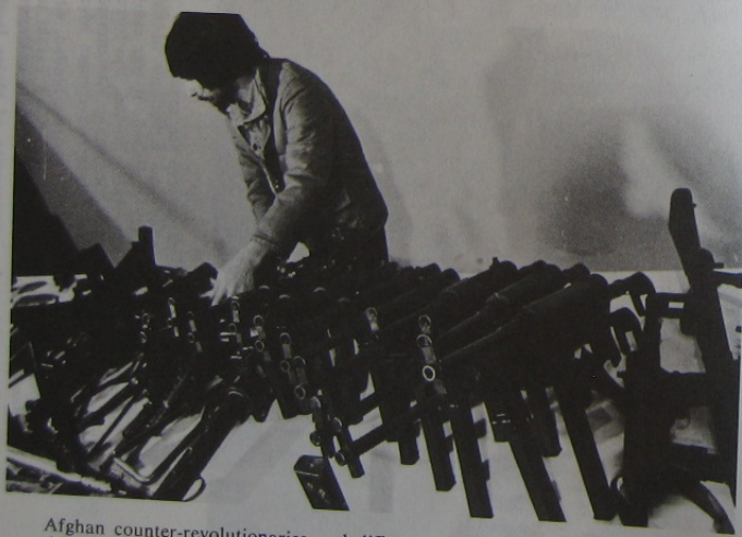
Afghan counter-revolutionaries and different groups of bandits, trained by American and Chinese instructors at camps in Pakistan are using these arms against the people of the DRA. The US and Chinese weapons shown in this picture have been captured.