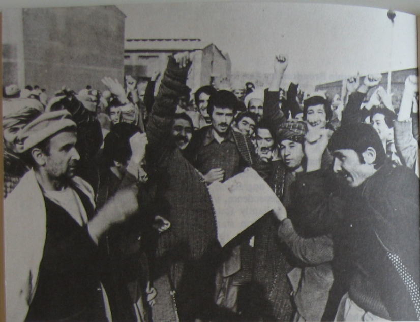
The citizens of Kabul read the news of a change in government and the defeat of Amin.