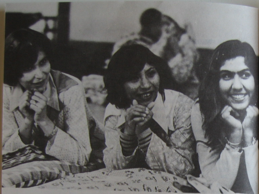
The new Afghanistan government is calling for all-out efforts to lift production and improve living standards. Personnel of the Kabul knitted goods factory.