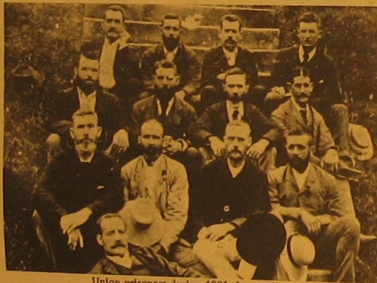
Union prisoners during 1891 shearers' strike. This strike gave impetus to the formation of the Labor Party.

The CPA's election statement urges their supporters to give second preferences to either the ALP or the Australia Party, making no distinction at all between them. The Australia Party of course is a thoroughly bourgeois party, and in no circumstances should socialists support them electorally, either on their own, or in any sort of electoral