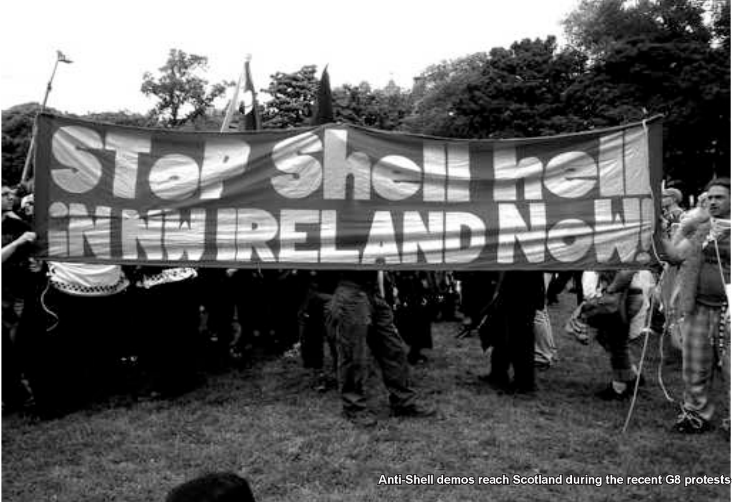
Anti-Shell demos reach Scotland during the recent G8 protests

The jailing of 5 Rosspoint men for refusing to allow Shell to install a potentially lethal pipeline has suddenly focussed attention on the whole project. But it has done more than highlight safety issues. It has highlighted the cosy relationship between business and the Irish State.