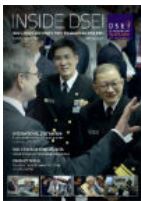
Download INSIDE DSEI, October 2014