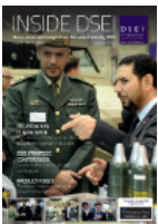
Download INSIDE DSEI, February 2015