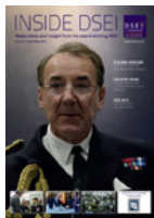
Download INSIDE DSEI, April/May 2014