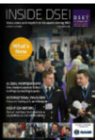
Download INSIDE DSEI, June 2015