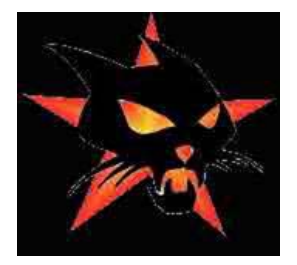
more info: actforfree.nostate.net en.contrainfo.espiv.net

Assembly for solidarity to political prisoners, imprisoned and persecuted fighters.