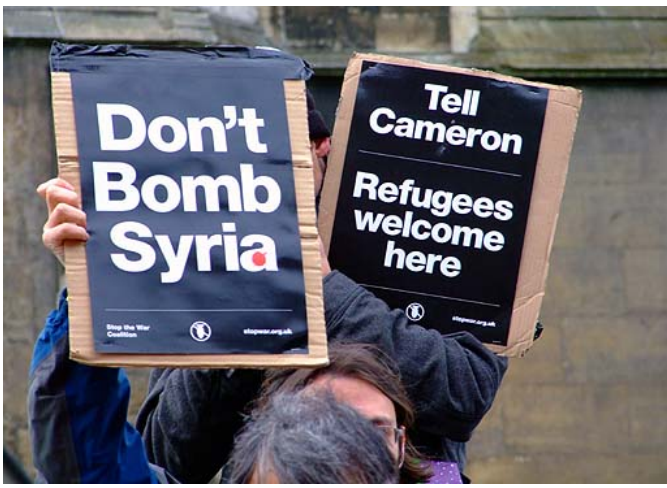
Placard Art #1