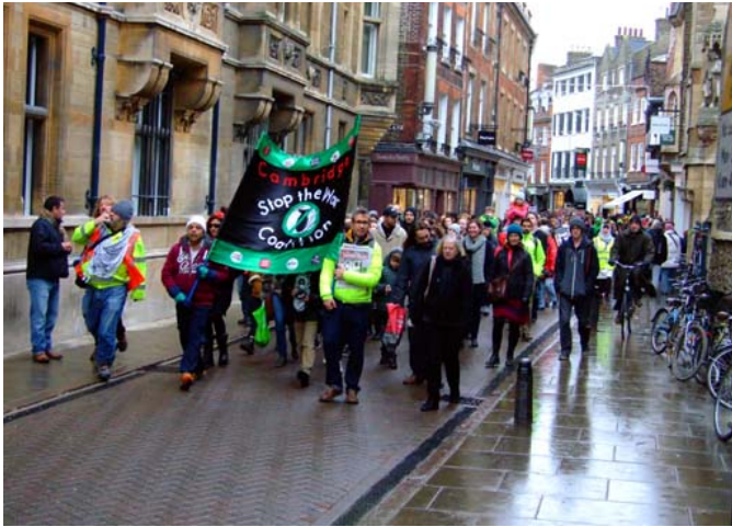
Heading back to the Market Square, from Trinity Street.