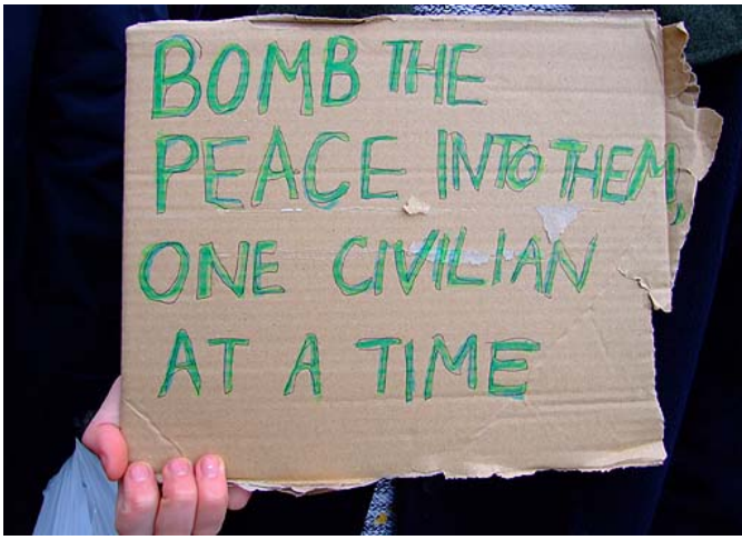
Placard Art #4 (Western Foreign Policy in a nutshell?)