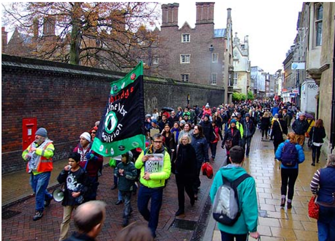
The march, heading towards Round Church Street.