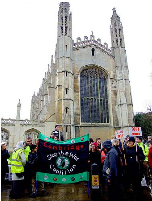
The start, a static rally in front of Kings College.