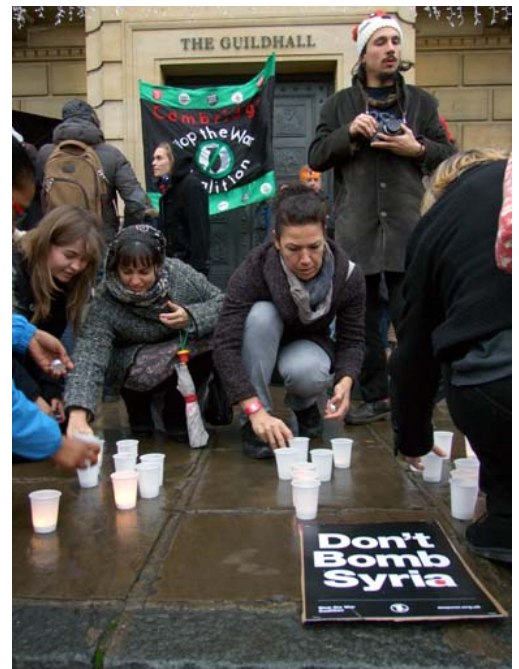
Despite wet, blustery weather, a diligent attempt was n

It was a grey, overcast day with some drizzle (a pain for