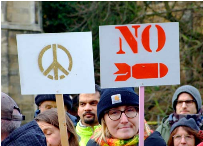
Placard Art #2

[Indymedia does blah. Content is good, and free to use for non-commercial purposes under the Open Content license. if you have questions, email someone.]