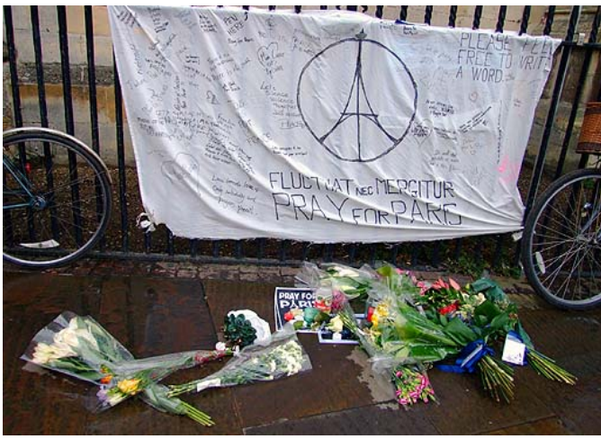
The Paris street shrine was passed by the march, outside of Great St Marys.