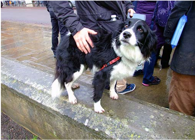
Even our local 'Riot Dog' turned up!