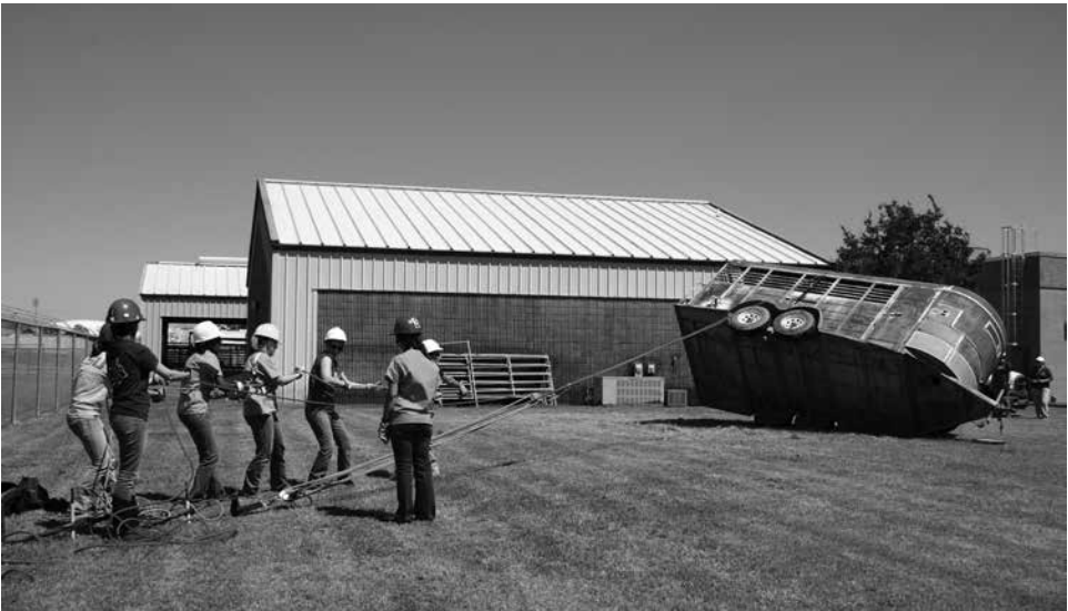
Veterinary students get the opportunity to learn about disaster preparedness and response. Here, they learn how to get an overturned horse trailer back onto its wheels.

All fees are estimates and the LSU Board of Supervisors may modify tuition and/or fees at any time without advance notice. Current tuition and fees can be found at www.bgtplan.lsu.edu/fees.htm .