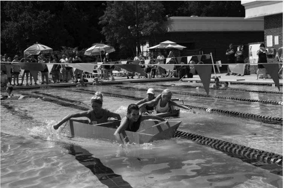
BELOW: First-year students begin orientation with the Freshman Leadership Experience, which ends with a boat race featuring boats constructed by the students out of cardboard and duct tape.