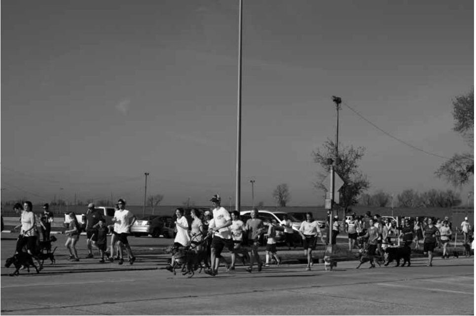
ABOVE: The LSU SVM hosts the annual Great Rover Road Run, which consists of a 5K and then a 1 mile fun run/walk with your dog.