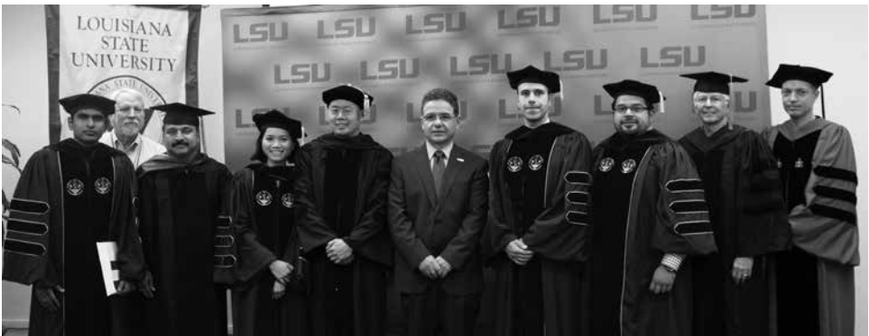
The LSU SVM offers MS and PhD degrees in addition to the DVM. We also have a combined DVM/PhD program.

hours. May be taken for a maximum of 12 hours of credit. Necropsy of various vertebrate animal species, with emphasis on domesticated animals; application of diagnostic procedures and techniques in anatomic and clinical pathology; case-based, problem-oriented approach to diagnostic problem solving utilizing current teaching hospital and referral cases and prepared materials that illustrate the aspects of disease mechanisms, pathogenesis, tissue changes, and factors needed for accurate diagnoses.