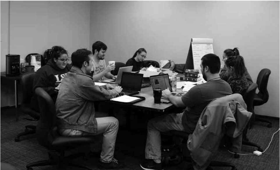
Problem-based learning allows veterinary students to learn about clinical cases before they begin their hospital rotations in their third year of veterinary school.

5253 Epidemiology and Public Health (3) 45 contact hours. Basics of veterinary epidemiology and public health; including regulatory medicine, environmental issues, food safety, foreign animal disease, food- and water-borne diseases of humans, agro- and