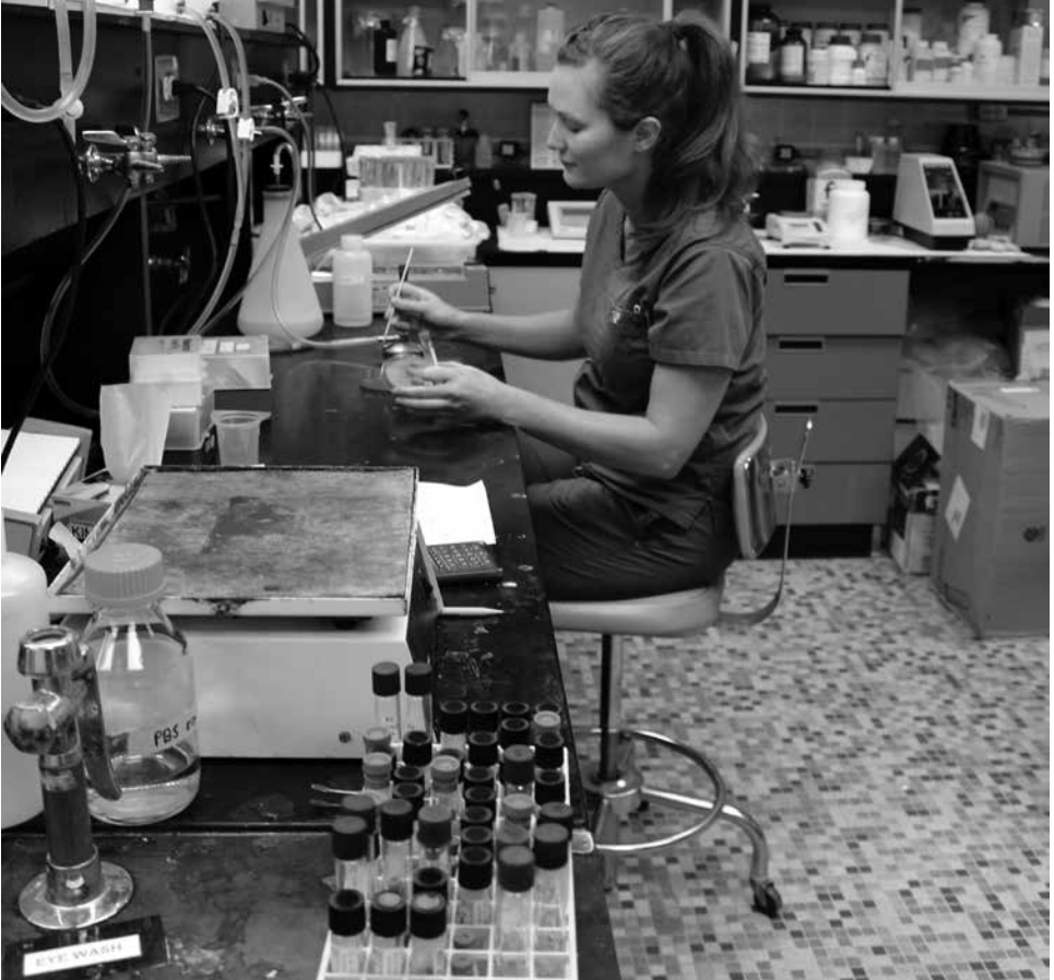
Veterinary students can conduct research as part of the Summer Scholars Program.

The Department of Pathobiological Sciences provides residency training in morphological and clinical pathology and also laboratory animal medicine through the Division of Laboratory Animal Medicine. Residency training programs are designed to prepare you to meet the requirements for certification in the corresponding veterinary specialty. Residents in this program generally complete an MS or PhD degree in veterinary medical sciences.