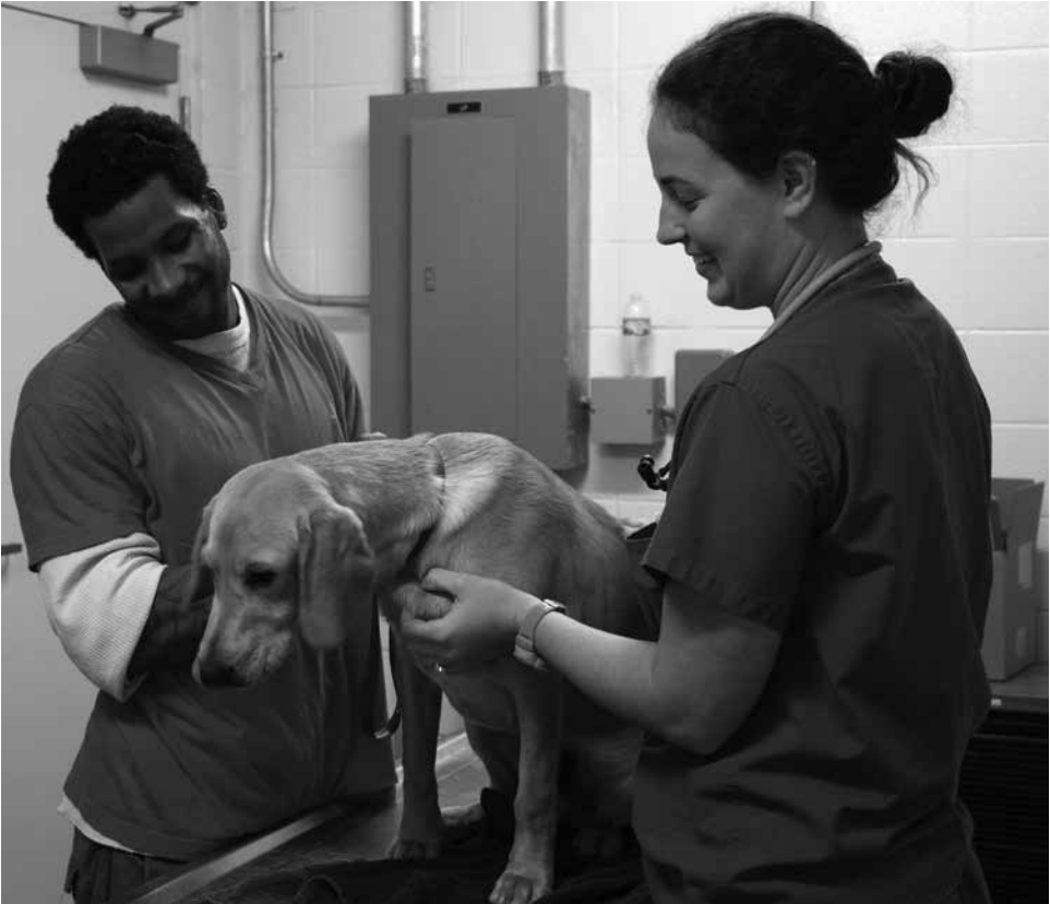
Our Shelter Medicine Service assists 30 animal shelters and four prisons with stray and abandoned animals.

of Animals (1-2) V Prereq.: DVM degree or equivalent. May be taken for a max. of 6 sem. hrs. of credit when topics vary. Necropsy of various animals submitted for postmortem examination: gross, light, and electron microscopy; and immunohistochemistry; correlation and synthesis of clinical information, anatomical finding, and other ancillary laboratory results, for an accurate determination of disease diagnosis and pathogenesis.