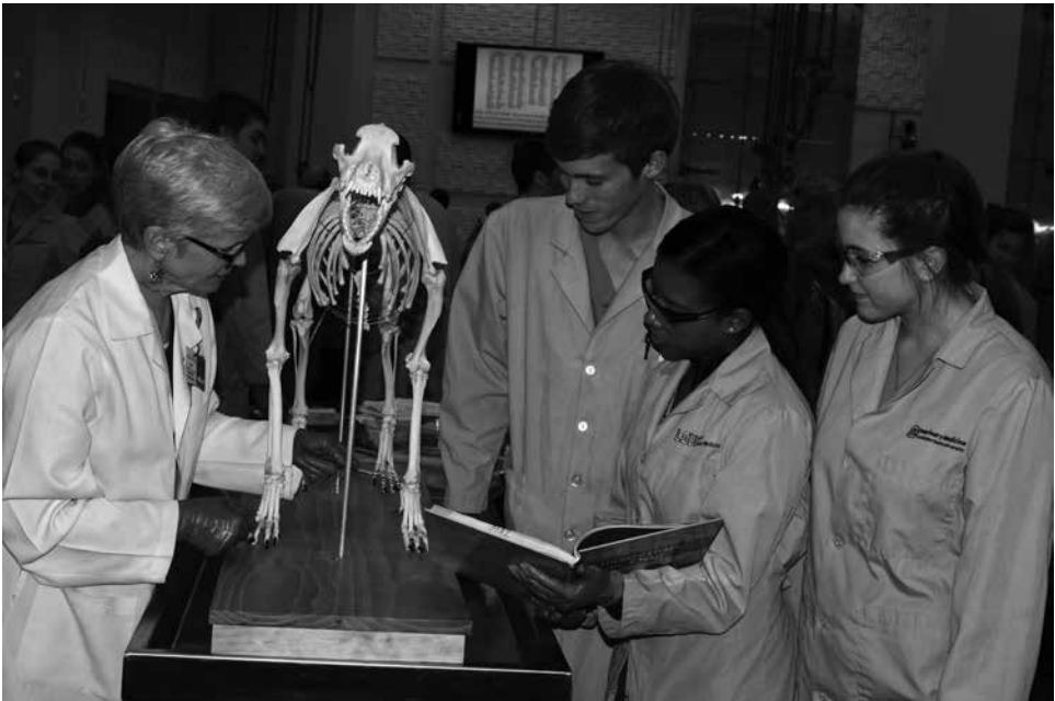
First-year students spend up to 10 hours a week in anatomy lab.

5103 Principles of Problem Solving (1) 20 contact hours. Introduction to problem solving methodology, clinical problem solving, problem-based learning, problem-oriented approach, and information management.