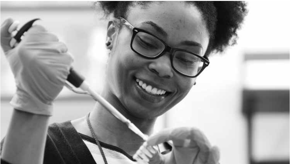
The LSU SVM boasts a robust research program. Studies cover a wide range of diseases and injuries.