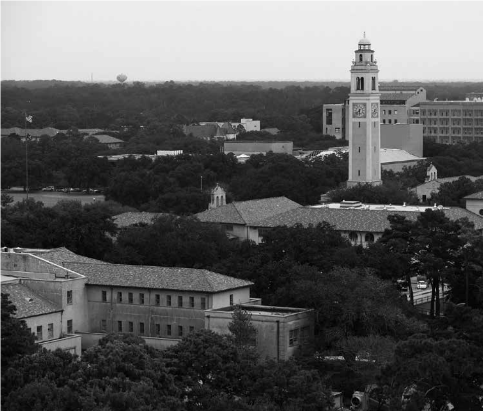
Louisiana State University campus

As the flagship institution of the state, the vision of Louisiana State University is to be a leading doctoral research–extensive university, challenging undergraduate and graduate students to achieve the highest levels of intellectual and personal development. Designated as a land-grant, sea-grant, and space-grant institution, the mission of Louisiana State University is the generation, preservation, dissemination, and application of knowledge and cultivation of the arts.