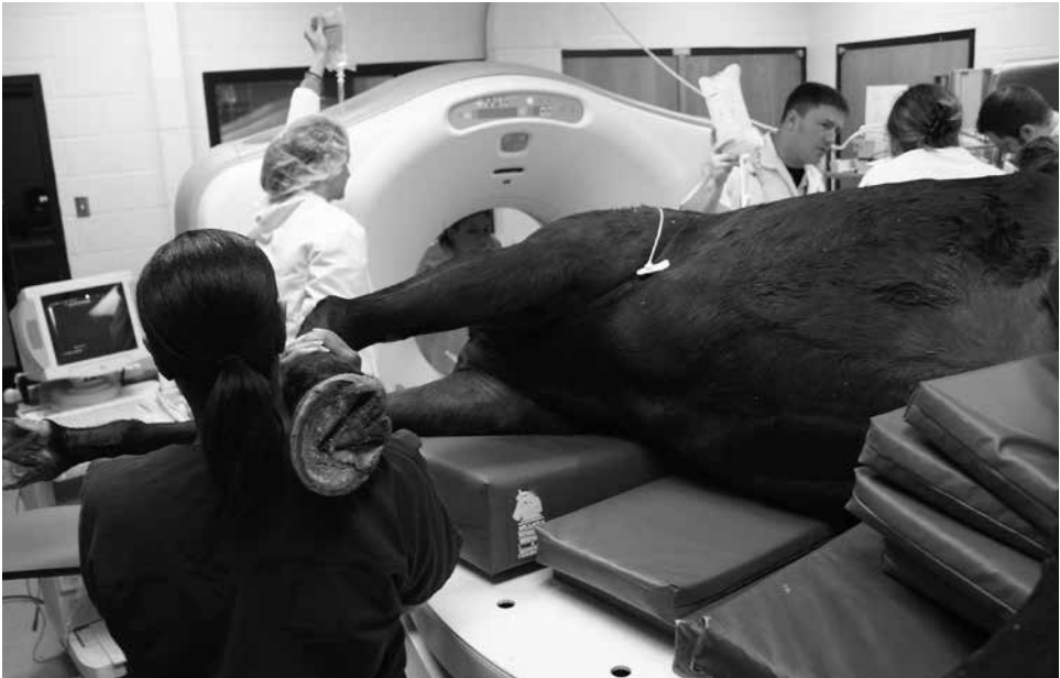
A horse being prepped for computed tomography.

All fees are estimates and the LSU Board of Supervisors may modify tuition and/or fees at any time without advance notice. Check current tuition and fees at www.bgtplan.lsu.edu/fees.htm .