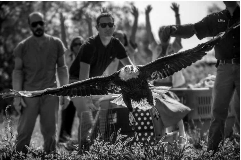
A bald eagle is released back into the wild after receiving care at LSU's Wildlife Hospital of Louisiana.

In order to practice veterinary medicine in the state of Louisiana, graduate veterinarians must submit a passing score on the North American Veterinary Licensing Examination to the Louisiana Board of Veterinary Medicine. You should inquire into the policies of other states in which you may intend to practice. The time, place, and application procedures for this examination are announced each year. Only after graduate veterinarians have successfully completed this examination do they receive their licenses to practice.