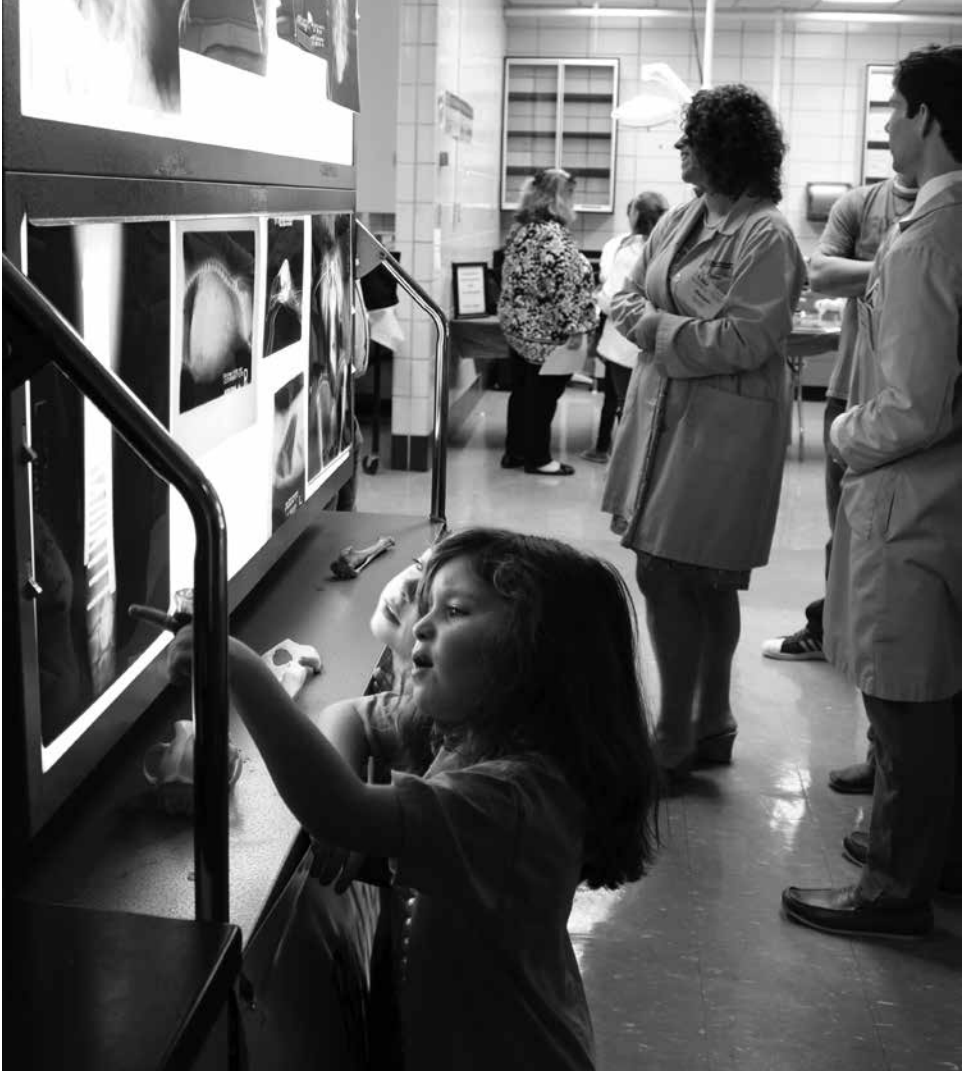
Thousands of people visit the LSU SVM for its Open House. Visitors take a walking tour of the LSU SVM and the Veterinary Teaching Hospital.