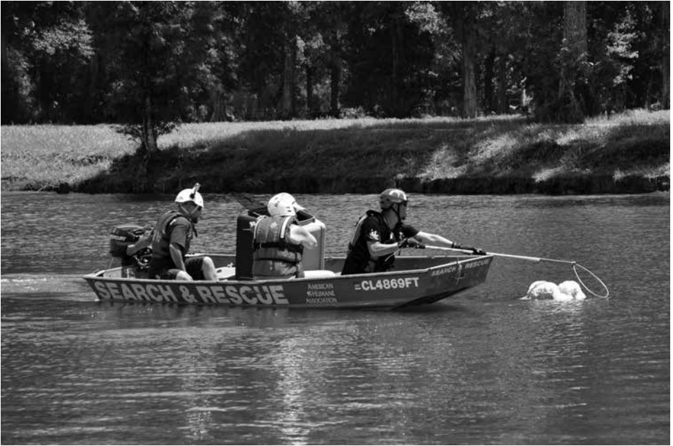
To commemorate the 10 year anniversary of Hurricane Katrina, the LSU SVM and the Louisiana State Animal Response Team hosted a disaster response boot camp to teach animal welfare workers how to rescue animals following a disaster. Real animals were not used in the training exercises pictured here.