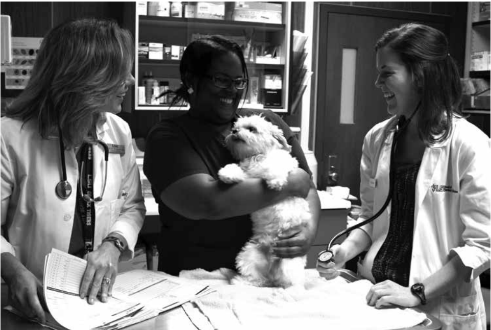
The Community Practice Service gives students the opportunity to learn about wellness, preventative medicine and annual health screenings.

7312 Epidemiological Study Design (4) S Introduction to the basic concepts of epidemiology with emphasis on the appropriate use and interpretation of epidemiological methods.