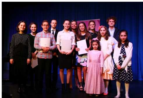
2015 Eisteddfod Winners

Please note that the B'nai B'rith Victoria Scholarship and the 9 Major Prizes will be awarded at the discretion of the adjudicators.