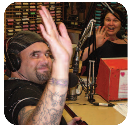
Above: Roominations team in the studio Below left: Girls on Air Trainees

Tamil Manifest Tamil Voice Thursday Breakfast Tuesday Breakfast Tuesday Hometime Two to the Valley Unitarian Half Hour Un Nuevo Mundo Es Posible Voice of Anatolia Voice of Chile Wayward Girls, Wicked Women Wednesday Breakfast Wednesday Hometime Women on the Line Wuigada YarraBUG