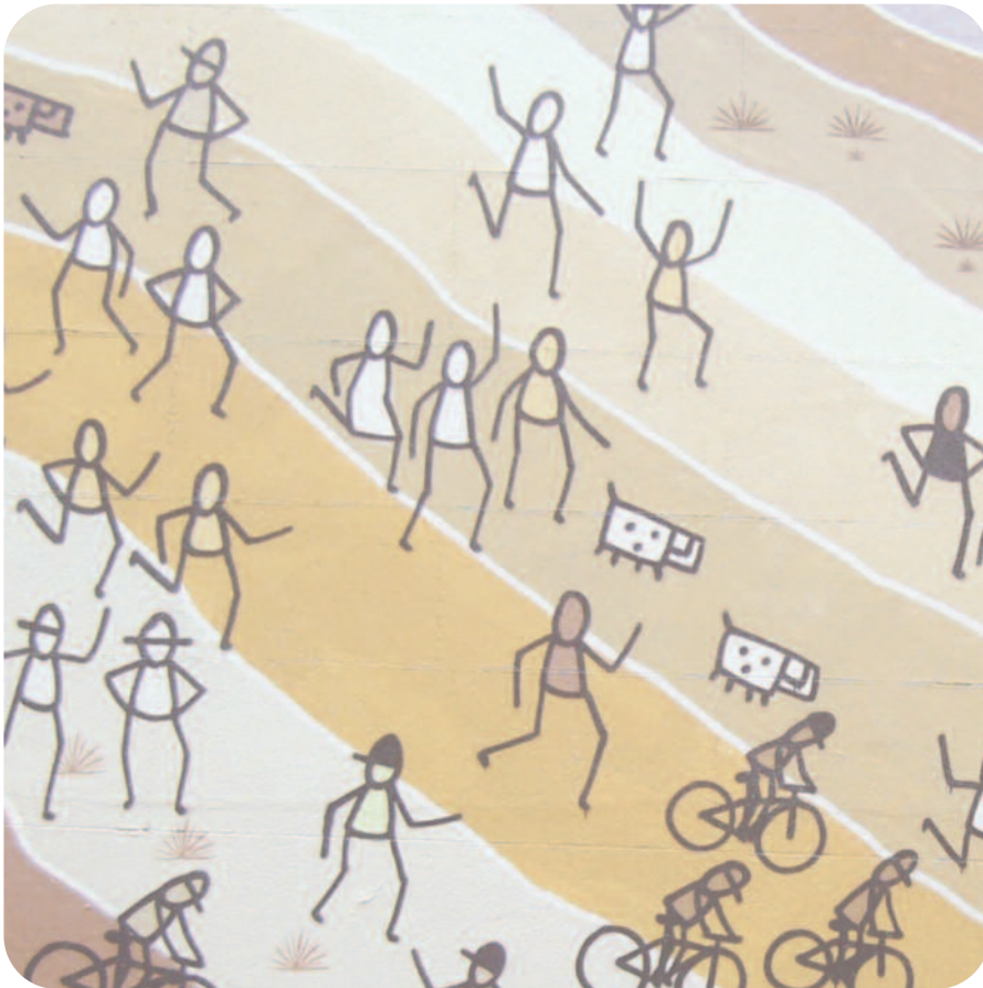
Mural detail. Completed March 2010. Tom Civil