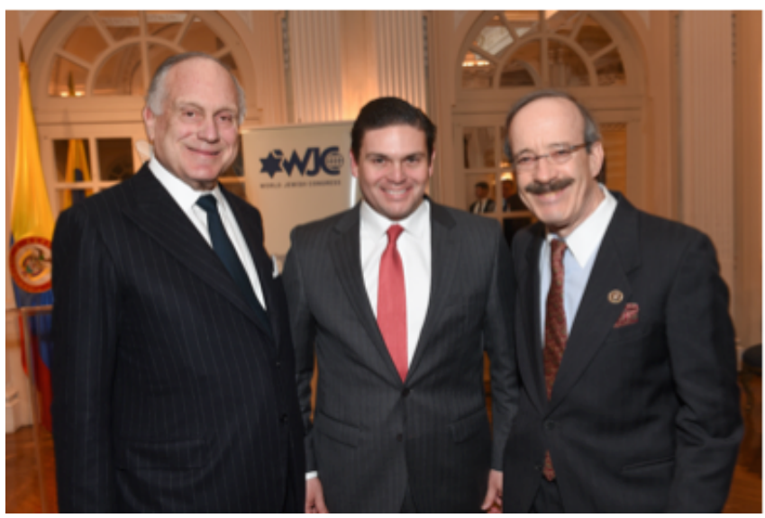
Ambassadors Pinzón and Lauder and Rep. Eliot Engel (D-NY), Ranking Member of the House Foreign Affairs Committee at the Residence of the Colombian Ambassador, March 1, 2016