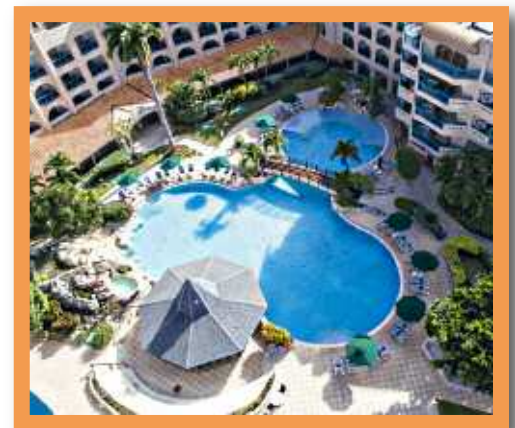
Accra Beach Hotel, Barbados

Click here for more information and to register.