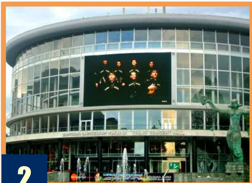
Tbilisi Philharmonic Concert Hall