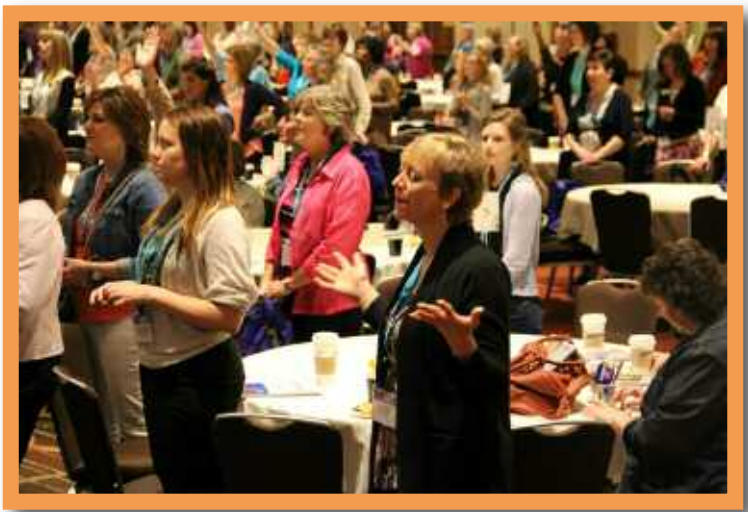
Heartbeat 2015 Conference

Click here for more information on Heartbeat's 45th Annual Conference. Heartbeat International is a World Congress of Families Partner.