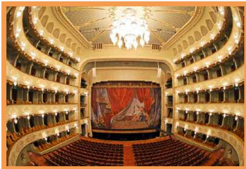
Tbilisi Philharmonic Concert Hall

Click here for more information and to register.