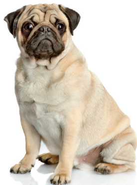
FRONT COVER: CHF Staff dog, Andi, photo by Sharla Seidel BACK COVER: CHF Staff dog, Felton, photo by Sharla Seidel