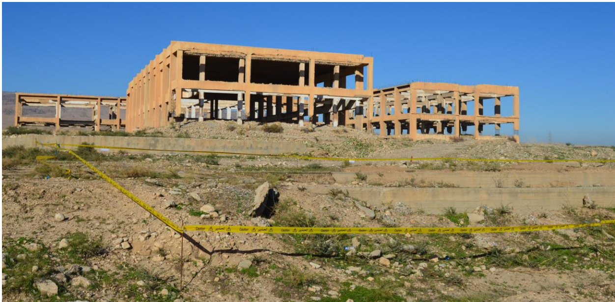
The pool with earth filled in over the bodies and the now-destroyed Solagh Technical Institute in the background

9. Solagh – A massacre of mostly elderly women who were brought to this location from Kocho on Aug. 15, 2014, estimated to be over 80 in number, occurred here. Just south of the Solagh Technical Institution buildings destroyed by ISIS is an empty pool which was converted into the mass grave. It resembles the foundation of a building. The site is covered over, but clothing and bone debris are in the vicinity. Solagh is a wadi coming down from the northeast side of Sinjar city spanning the highway. Maps show Solagh as north of the highway, but the mass grave is in the part of Solagh that is south of the highway. IS held the people of Kocho for some time while encouraging them to convert to Islam. The men and women of Kocho were later separated and moved. The women were held at the Solagh Technical Institution. Later, elderly women were separated (presumably those who refused to convert to Islam). As the younger women were being taken out to be transferred to Tel Afar and Mosul, they heard the gunshots and screams of the older women. Nadia Murad, who has been speaking publicly with Murad Ismael, is a survivor from this location, and her mother was one of those massacred.