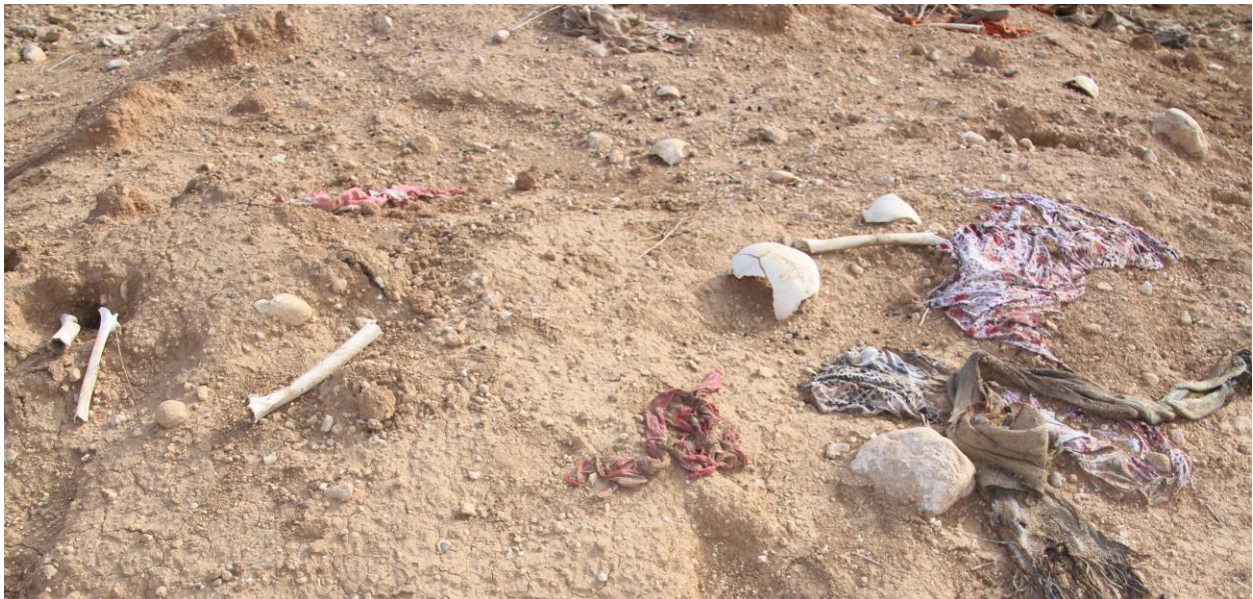
Bones, blood-stained clothing, and a skull at one of the Zumani sites.

12. Zumani 2 – The second large mass grave at the Zumani site is perhaps 200 meters from the first. It is similar to the first with bodies laid on the ground and covered over with earth. Exposed bones and clothing are strewn around the site. It is a berm approximately fifteen meters long.