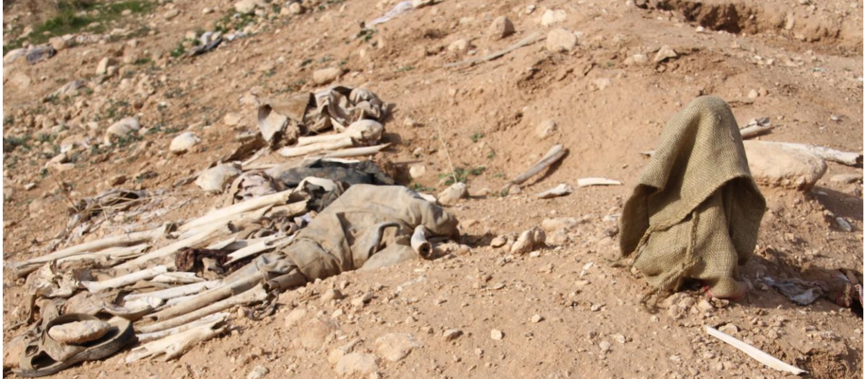
Piles of bones with clothing at one of the Zumani sites.

A large mass grave is located at the edge of a ravine where bodies were left on the surface and then covered over with earth. (No pit was dug in which to place the bodies; nearby areas are present where earth was dug up to be placed over the bodies.) It was shallow and the site is partially exposed with bones visible and scattered about nearby. Clothing is also strewn near the site. It is a twenty meter long berm.