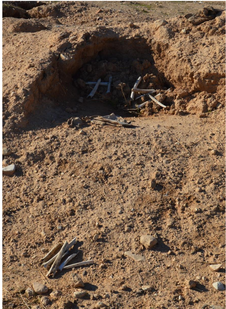
Part of the Hamadan site