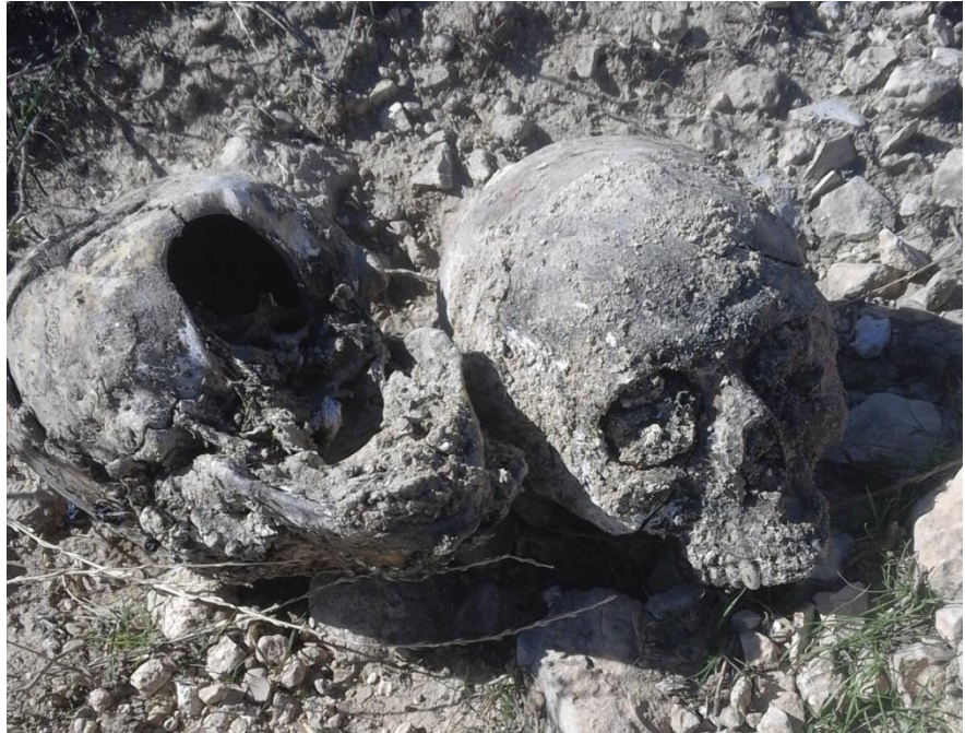
Skulls from a kill site near Qine

15. Qine 2 – Unknown number killed – Mass grave approximately fifty meters from a dirt road leading north toward the mountains, well away from settlements. It is adjacent to a small blockhouse next to a rusted truck hulk. This grave is a ten-meter-long mound with exposed bones and a prominent top half of a skull. The number of bodies under the surface is unknown.