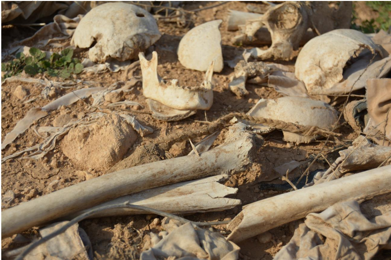
Bones and skull fragments at one of the three mass graves in Zumani, near Sinjar City. Clothing suggests that men, women, and children were killed in this location.

10. Tel ‘Azar crossroads – Site discovered by Yazda on Nov. 16, 2015; survivors estimate at least 41 massacred. Yazda interview a 14-year-old survivor of this massacre who was counted as a child and separated off from the male population that was killed. The people here were farmers. The family that was massacred had stayed at the crossroads to give water to Yazidis that were fleeing from the south. IS massacred the families that lived here as well as some families that had stopped here to rest while fleeing. The boy and his mother fled to the mountain when the