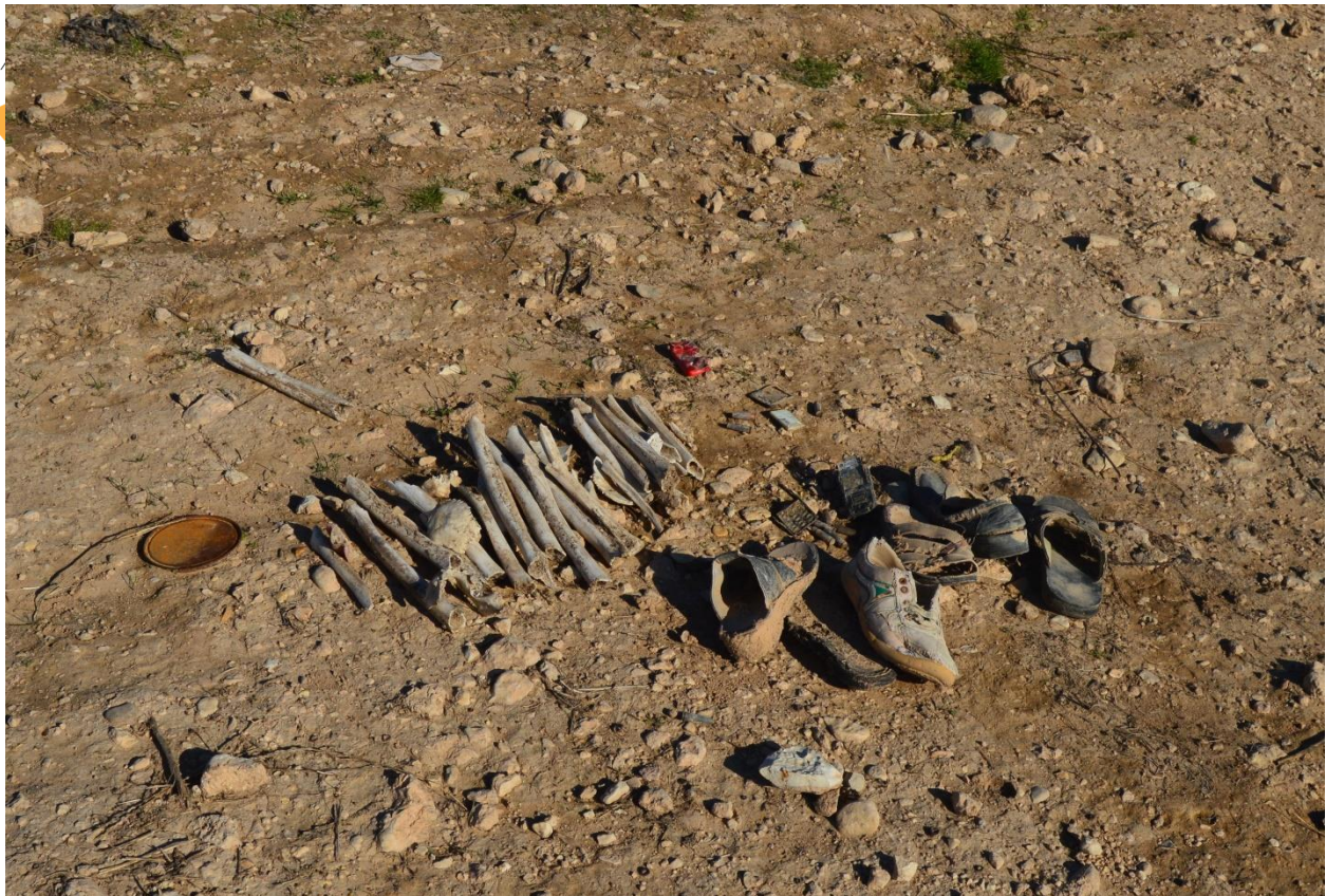
Part of the Hamadan site after tampering

8. Hamadan – Site discovered by Yazda on Nov. 15, 2015 (two days after the liberation of Sinjar City) – At least 21 Yazidis are believed to have been killed here; total number unknown. The site is 100 meters south of a Peshmerga position occupying an abandoned house on the south side of Highway 47. The mass grave is in a nearby field, 200-300 meters north of the town of Hamadan proper. Upon a second visit by Yazda to the site around a month later, Yazda members found that the mass grave had been tampered with. Someone had gathered the exposed bones and shoes together in rows and had placed the shell casings in piles. The site is a shallowly-dug approximately ten-meter-long berm with exposed bones lying around the site. Clothing and other personal items are scattered around.