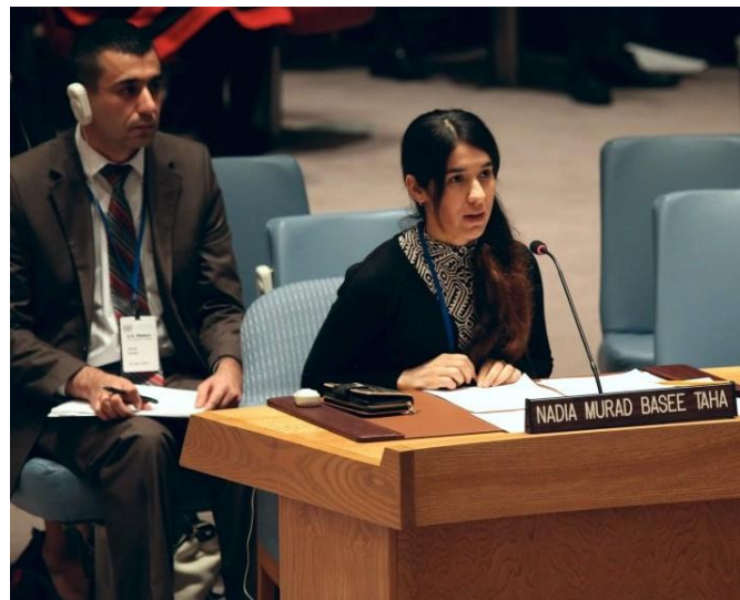
Nadia Murad speaking before the UN Security Council on the Yazidi genocide, Dec. 16, 2015

There were 84 members of a larger extended family that were separated (men from women) in this location. The family were farmers and there was a group of houses in Hamadan that housed this family. The family did not flee on Aug. 3. On Aug. 4, IS came to their farmlands and rounded them up. The women were locked inside a building and the men were massacred at this site. Only one male family member survived, because he was not in the area on Aug. 3. He was interviewed by Yazda. He reconstructed the massacre event through the testimony of kidnapped female family members who were later rescued. The