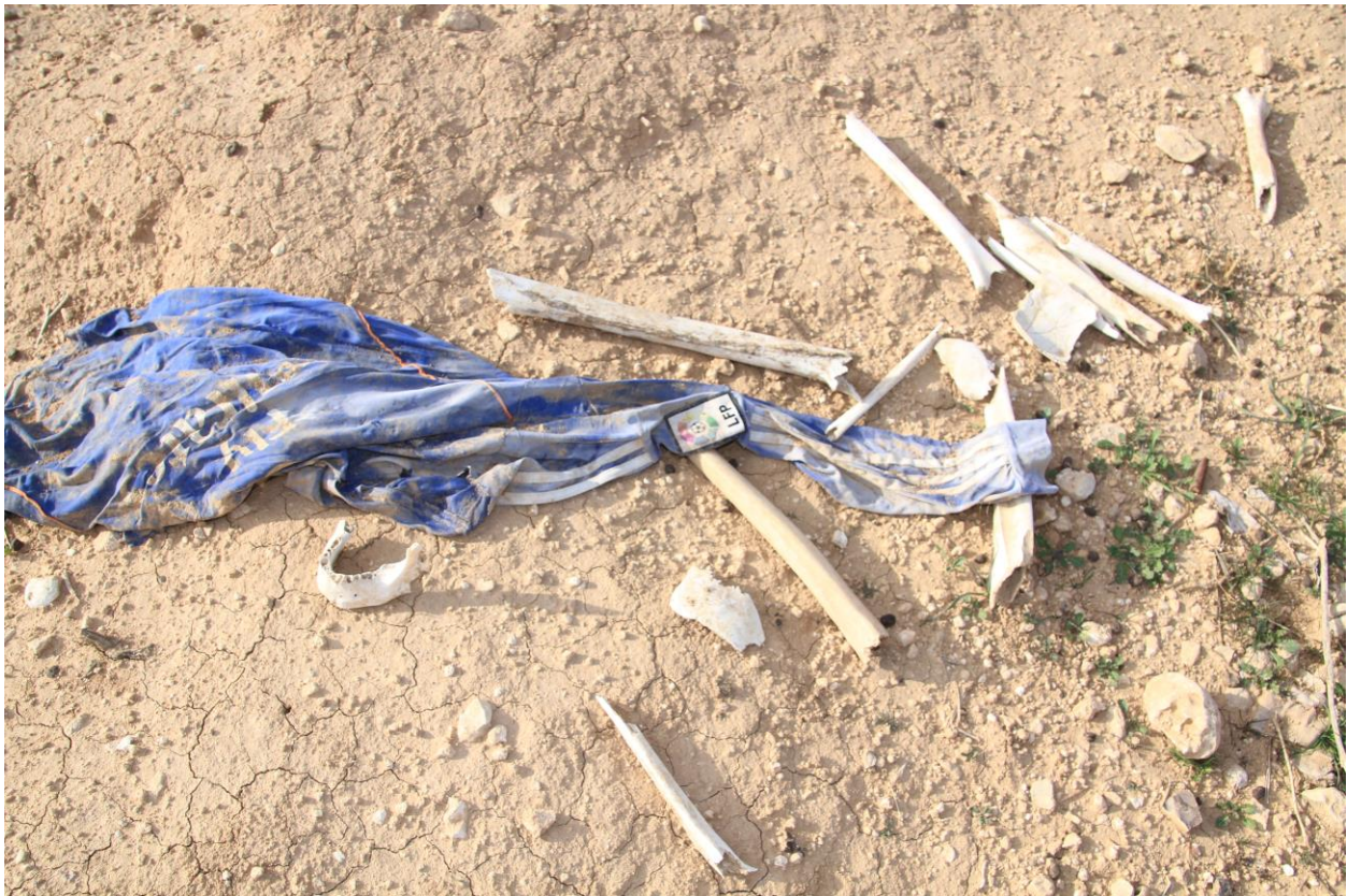
Bones, skull fragments, a jawbone, and a football jersey at one of the Zumani sites.

11. Zumani 1 – The number of bodies contained in the three Zumani sites is unknown, but expected to be a high number. These sites contain bodies of Yazidis who were rounded up as they were fleeing up the switchbacks on the road going up the mountain from the city. Yazda interviewed a Yazidi fighter who sat at the foot of the mountain with binoculars and watched as IS brought truckloads of people from Sinjar City who were shot in this location. Clothing and shoes seen at these three sites by Yazda suggest that those killed may have been a mix of women, men, and children.