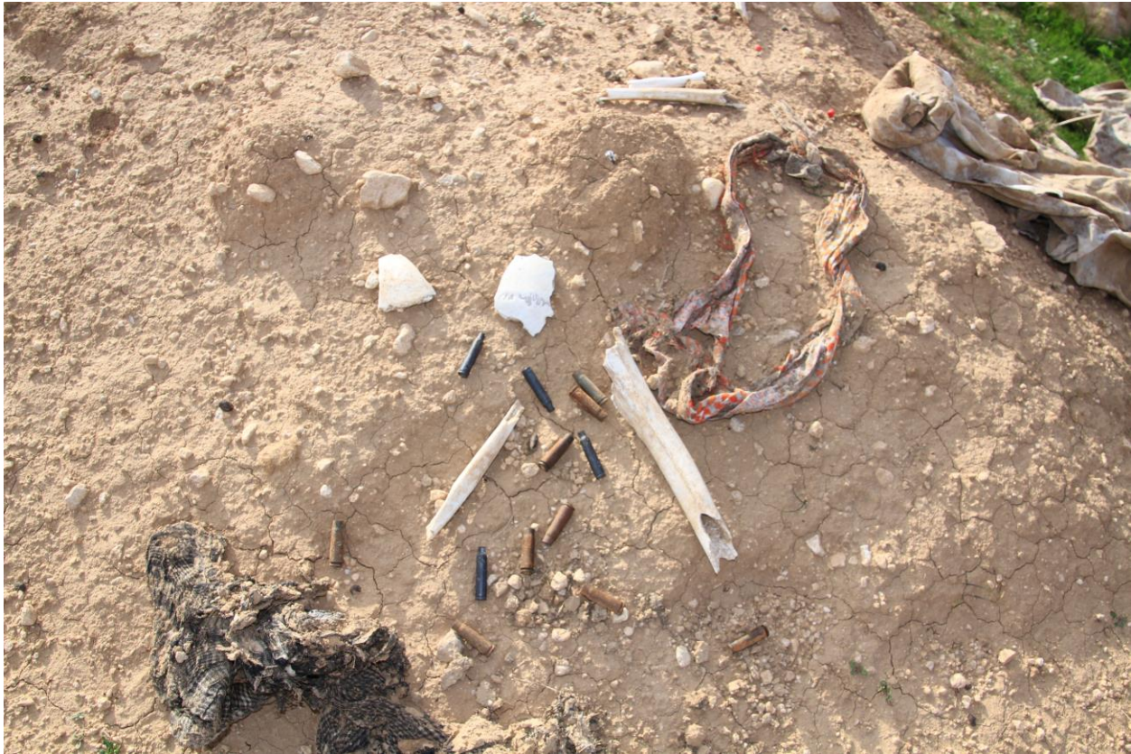
Bone and skull fragments, shell casings, and clothing at one of the Zumani sites.

13. Zumani 3 – The third large mass grave at Zumani is another 100 meters from the second site. It is similar to the other two with bodies laid on the ground and covered over with earth. Exposed bones and clothing are strewn about the site. Bones are scattered in a large radius from each site as if by animals.