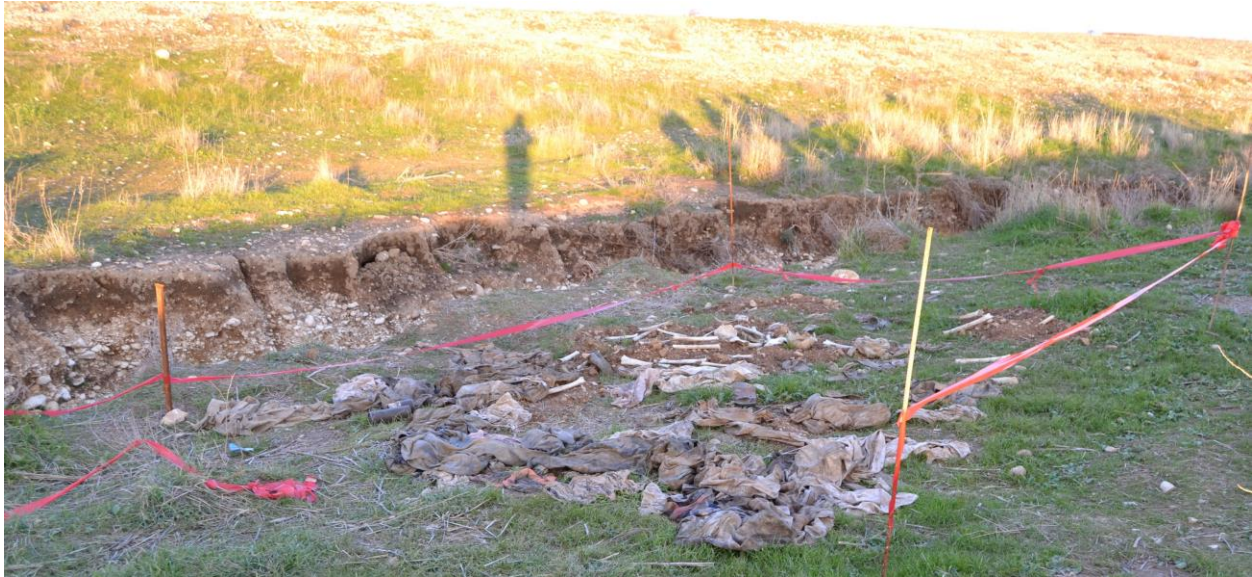
Mass grave at Wadi al-Zleliya