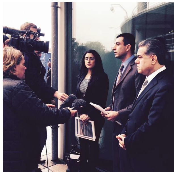
The KRG foreign minister attending the submission of the report to the ICC

On Sept. 24, 2015, Yazda submitted a report to the International Criminal Court requesting that a preliminary investigation into crimes of genocide against the Yazidis be conducted. In a welcome move, the Kurdistan government sent the KRG's foreign minister to attend and support the submission, who afterwards on his social media used the terminology of a "Yazidi genocide"—the first time that we noted a Kurdish official using such language. Though Yazidis still await any public apology or discussion on the events of Aug. 3—and the prosecutions of commanders in Sinjar who abandoned them—this marked a significant and welcome shift in the official rhetoric regarding the Yazidi case.