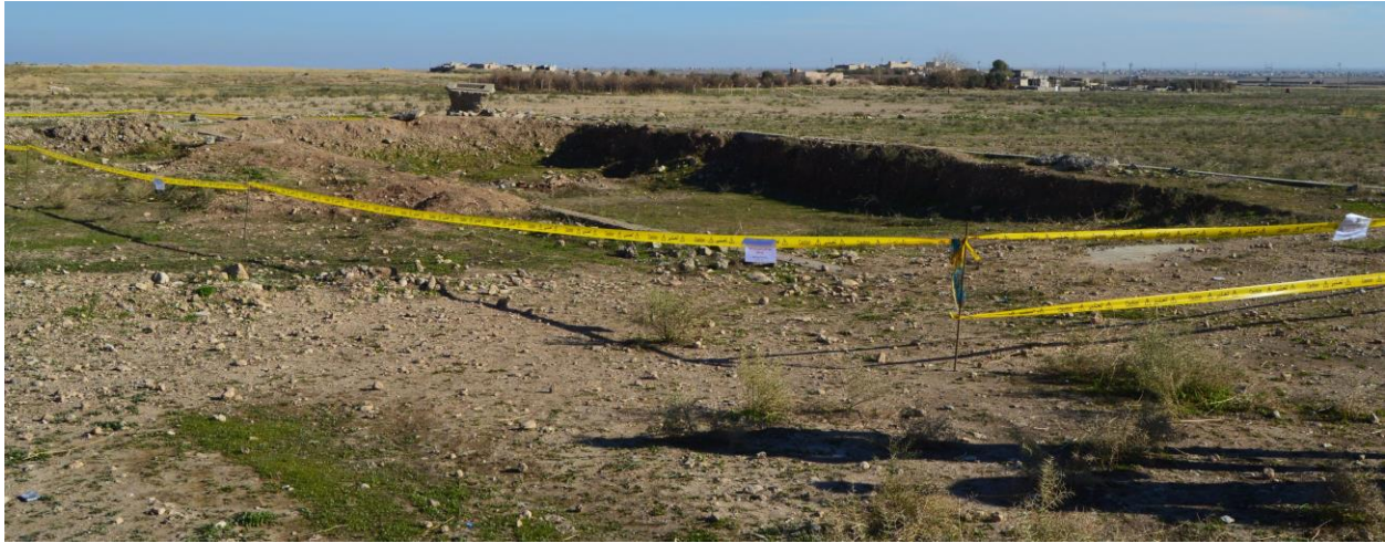
The pool containing a mass grave at the Solagh Technical Institute – Photo: Yazda

10. Tel ‘Azar crossroads – Site discovered by Yazda on Nov. 16, 2015; survivors estimate at least 41 massacred. Yazda interview a 14-year-old survivor of this massacre who was counted as a child and separated off from the male population that was killed. The people here were farmers. The family that was massacred had stayed at the crossroads to give water to Yazidis that were fleeing from the south. IS massacred the families that lived here as well as some families that had stopped here to rest while fleeing. The boy and his mother fled to the mountain when the