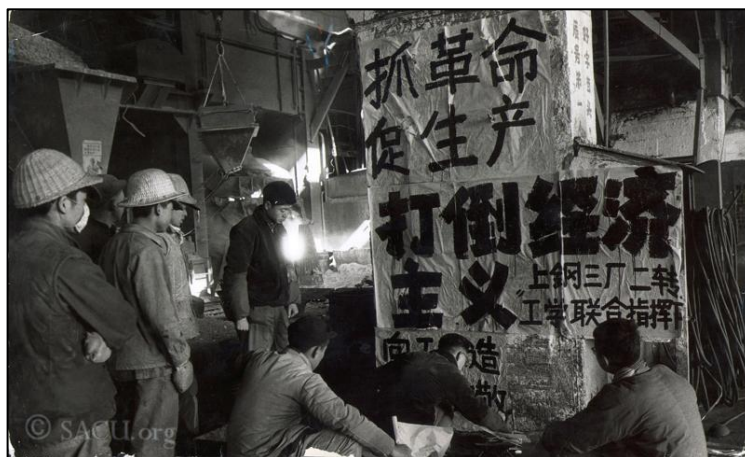
Shanghai factory, 1969. The poster reads: "The working class is the main force in the cultural revolution. The valiant Shanghai workers rose to rebuff Liu Shao-qi's bourgeois headquarters for whipping up the evil counter-revolutionary wind of economism in an attempt to suppress the cultural revolution."

The CRG's crackdown and cooptation was briefly halted, however, in response to what became known as the "Wuhan incident". 153 In July 1967, conservative rebel groups backed by local military officials laid siege to rebel groups in Wuhan, who had tried to seize power in the city. Xie Fuzhi and Wang Li traveled to Wuhan from the CRG in Beijing, intending to mediate the dispute in favor of the rebel forces. But when they arrived, they were promptly arrested by the local military. The allegiances of military