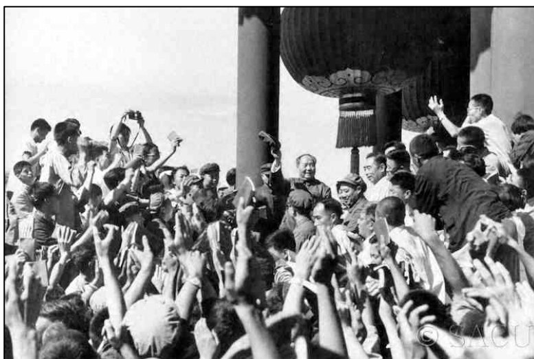
Mao greets students in Beijing, 1967.

Over time, the Red Guard movement struck out at portions of the party bureaucracy as well. But this development threatened to divide the movement: First, because some groups limited their targets to disgraced “black” categories, and refused to attack the party at all. Second, because those willing to attack the party did so for different reasons, and to different extents. Red Guards included the children of elite party cadres, workers and peasants, and declassed former intellectuals. These different class bases implied different orientations toward the party-state, and laid the basis for splits as the focus turned toward the party hierarchy. Of course, all groups in the CR claimed to