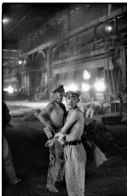
Anshan steel works, 1958.

the Maoist era took place from 1950-1953, when a national Marriage Law legalized divorce and outlawed compulsory marriage, and was popularized in a mass campaign. Though many cadres and sections of Chinese society resisted the effort, women brought thousands of domestic abuse and divorce cases to court: in Shanghai in 1950, 77% of the city's 13,349 divorce cases were filed by women. 60 National infrastructure was also expanded. 5,000 kilometers of rail lines and 14,000 kilometers of roads were constructed in the 1950s, while the number of university graduates rose by tens of thousands, and primary school graduates rose by the millions. 61 By 1957, the vast majority of China's arable land had been cooperativized, and the vast majority of its industries were in the hands of the state. To CCP leaders, these changes in the forms of property constituted the transition from New Democracy to "socialism."