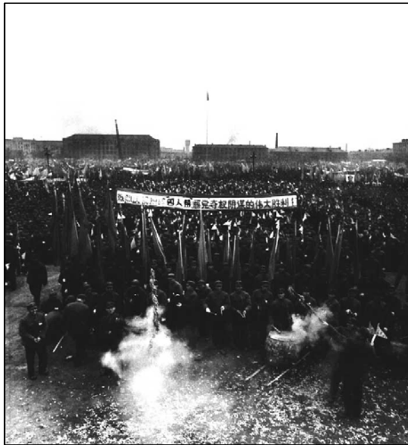
Mass rally in People's Stadium celebrating the “great victory of smashing the Gang of Four's conspiracy to usurp the power of the leadership and the party”, Harbin 1976.

The end of the CR was the breaking point of Maoist politics. Carried to their extreme, Mao’s simultaneous commitments to Stalinist assumptions and mass mobilization against capitalist restoration led to a dead end. The price of this failure was thousands injured and killed, thousands more confused and demoralized, and capitalist exploitation for decades to come.