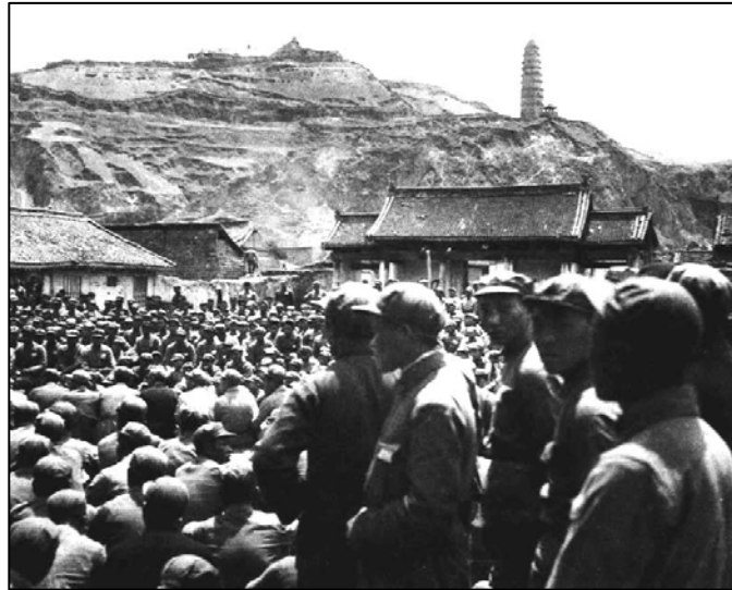
Mass meeting in Yan'an, 1937.

proletarian-socialist world revolution.” This claim is supported by his second assertion, that the political leadership and material support of the USSR will help anti-imperialist struggles move in a socialist direction. “The Soviet Union,” Mao argues, “has reached the period of transition from socialism to communism and is capable of leading and helping the proletariat and oppressed nations of the whole world.” Third, Mao believes that the leadership of the CCP itself guarantees the socialist trajectory of the revolution. The leadership of the “proletariat and the Communist Party,” will complement growth in “the state sector of the economy...and the co-operative sector of the economy” to ensure the transition to socialism.