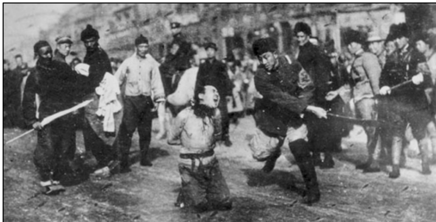
Communist militant executed in Shanghai, February 1927.

Chiang's "coup" didn't pass without consequence: to the south, the left-wing elements of the KMT holding power in Wuhan split with Chiang. The CCP leadership sought to take the lead in the situation by forming soviets of workers and peasants in the city, but were again restrained by the Comintern. To Stalin, the left-KMT government was the "center of the revolutionary movement" in China, and the CCP should actively support it. The CCP relented, thereby clearing the way for the Wuhan government to