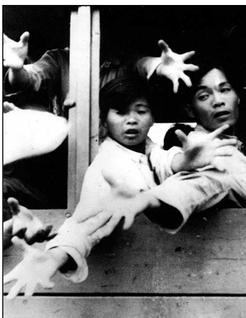
Chinese refugees ask for food in Hong Kong, 1962.

At a CCP conference in Lushan in July 1959, many party leaders called for an end to the GLF in the face of the growing crisis. Defense Minister Peng Te-Huai led the charge by criticizing Mao in an open letter. Mao made a brief self-criticism before the party, but soon doubled back, and attacked Peng and his supporters for “right deviationism.” Peng was removed, and Lin Biao, one of Mao’s close allies, was installed in his place as head of the army. A campaign against right deviationism was then executed throughout the party over the following months, purging critics of the GLF, and pushing the campaign ahead even as famines deepened. The situation was then worsened by a series of natural disasters: in July 1959 the Yellow River flooded croplands, and in 1960 droughts affected around half of China’s agricultural areas. (Notably, however, the flood cycle in 1959 was less pronounced than in 1954 or 1973, and drought conditions in 1960 were less severe than cyclical droughts in 1955, 1963 and 1966. 93 Natural calamities contributed to famines during the GLF, but were not their main cause.)