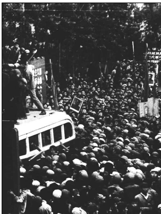
Rebel factions battle for control of a broadcasting bus in Heilongjiang province.

The conflict between the WGH and the Scarlet Guards, and others like it around the country, was essentially a proxy battle between the party factions with which the two groups were aligned. While both courted sanction from Mao, the WGH was embraced by the CRG, and the Scarlet Guards were aligned with the local Shanghai party committee. Many CR factional conflicts were cast in this mold at first. However, with the conservative wing decisively defeated in Shanghai, this initial struggle quickly gave rise to new oppositions within the triumphant "radical" camp itself. The process began when some workers began to mobilize for their own interests, in growing antagonism with the party-state as a whole. In Shanghai this shift took the form of the "wind of economism."