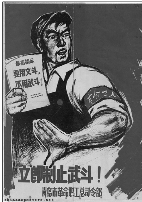
“Stop the armed struggle at once!” 1967 poster from Qingdao Municipal General Command of the Revolutionary Trade Unions.

In January, government and means of production briefly passed “from the hands of the bureaucrats into the hands of the enthusiastic working class,” and “for the first time, the workers had the feeling that ‘it is not the state which manages us; but we who manage the state.’” Later, “in the gun-seizing movement, the masses, instead of receiving arms like favors from above, for the first time seized arms from the hands of the bureaucrats by relying on the violent force of the revolutionary people themselves.” This move allowed “the emergence of an armed force” organized by the people, which became “the actual force of the proletarian dictatorship...They and the people are in accord, and fight together to overthrow the ‘Red’ capitalist class.”