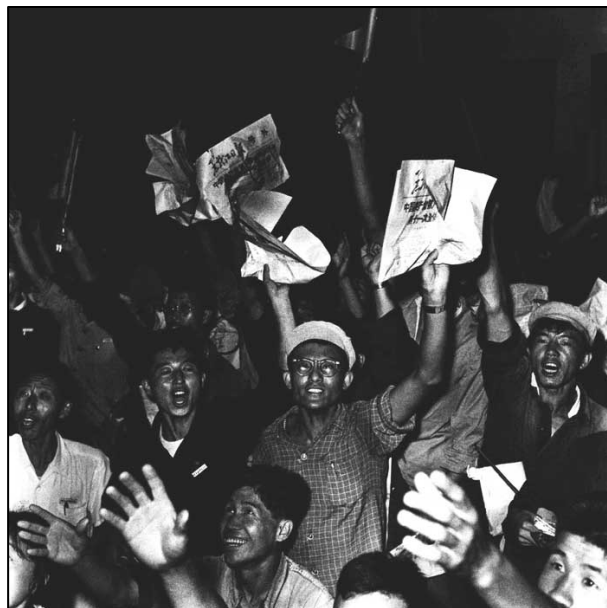
Crowds celebrate in the streets on August 13th, 1966, to celebrate the adoption of the CCP’s “Sixteen Articles”.

The same month, a set of Sixteen Articles on the CR were released by the CCP Central Committee. The Articles specified the method through which the movement would be carried out, and effectively opened the floodgates to mass participation across the country. In itself, the Articles were not particularly radical. As in previous mobilizations, cadres were to stimulate mass activity and manage contradictions among the people. The target of the CR was to be a “handful” of “anti-Party, anti-socialist rightists” within the bureaucracy, rather than the party-state itself. The Articles insisted “the great majority” of party cadres were “good” or “comparatively good,” and thus the movement would ultimately unify “more than 95 per cent of the cadres” behind a revolutionary political line. Furthermore, the campaign was in no way to interfere with the proletariat’s ability to work: “Any idea of counterposing the Great Cultural Revolution to the development of production,” the document insisted, “is incorrect.”