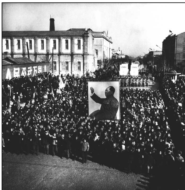
Celebrating a three-in-one power seizure, Harbin 1967.

The February crackdown led to a new round of divisions in the rebel ranks. Now the rebel faction split between those already included in the new three-in-one committees, and those excluded from it. Within the latter camp, tensions remained between those who hoped to win inclusion in the new political order, and others who now sought to overthrow it. Similar splits occurred across the country: in Tsinghua University in Beijing, the Jinggangshan group split over whether to accept rehabilitated cadres in the new three-in-one committees. The highly radical faction, most of whose leaders and membership was from peasant and worker backgrounds, opposed the rehabilitated cadres and called for “mass supervision” of the committees instead. 147 In Shanghai, a similar tendency cohered around a group known as Lian Si.