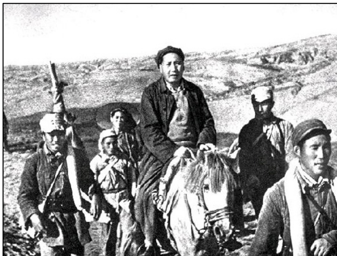
Mao on the long march, 1930s.

The Long March sparked the ascendance of Mao to the leadership of the party, a decisive break with Soviet control, and the gradual marginalization of the party's Soviet-oriented leaders. Over the course of the retreat, the CCP lost contact with the Comintern completely: communication was broken in August 1934, when the CCP's underground radio transmitter in Shanghai was destroyed. In January 1935 the CCP Politburo held a meeting in Zunyi, in Kweichow province in southwest China. The "28 Bolsheviks" group was criticized for their failed military strategy, and officially dissolved. Several of the group's members joined Mao's wing of the party, while Wang Ming remained in Moscow. Only after winning control of the party did Mao re-establish radio contact with the Soviets, a year and a half later, in June 1936. 15