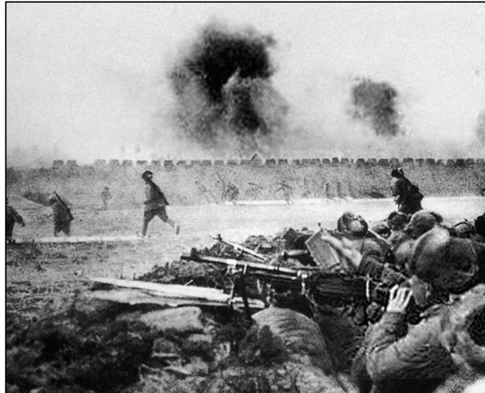
The Red Army battles Kuomintang forces at Jinzhou, 1948.

As the KMT collapsed and the Red Army swept toward the tropics, peasants across China began to seize land en masse . They took over lands not only from “traitors,” in line with the CCP’s moderate land reform policy, but from all manner of landlords. The upsurge forced the party to reassert control over mass self-activity again in 1948. Mao repeatedly warned against “adventurist policies”: “The industrial and commercial