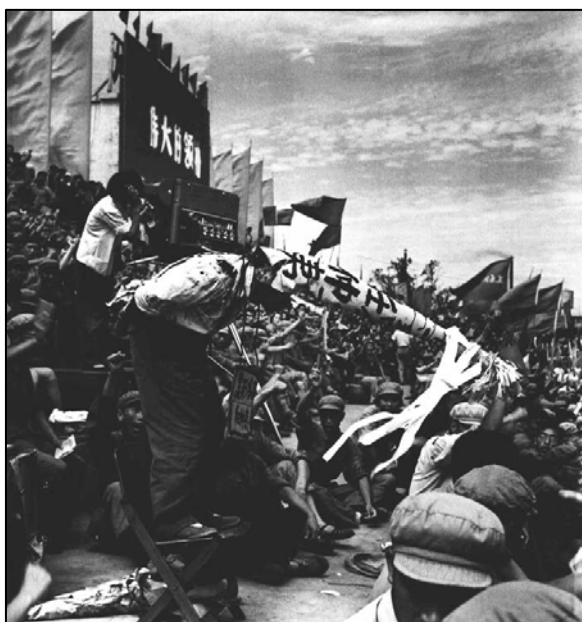
Mass criticism of “black guard elements” in Harbin.

Yu Luoke, a 24-year old factory apprentice, helped initiate this trend by publishing On Class Origins in January 1967. The piece offered a thoughtful critique of bloodline theory, and it circulated widely on a national level. Yu highlighted the logical fallacies of the bloodline conception: one’s class position was determined by a variety of factors beyond one’s family background, and clearly couldn’t be reduced to the status of one’s father. He also cast the bloodline system as a caste order, questioning whether there was a difference “between those with bad family backgrounds” in China, and groups like “blacks in America, untouchables in India, and Burakumin in Japan.” Yu even went on to propose that the children of cadres were becoming “a new aristocratic stratum” in Chinese society, and that bloodline theories of class legitimized their ascent. 127