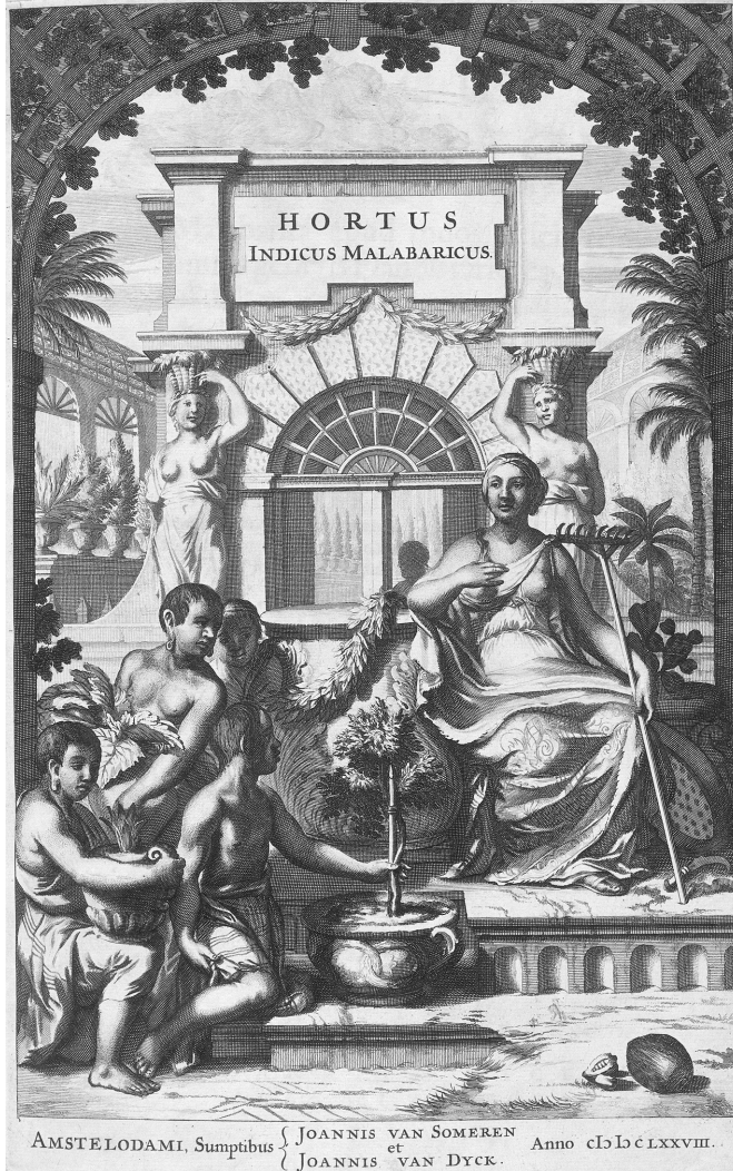
FIGURE 1. Frontispiece of Hortus Malabaricus vol. 1 (1678). Anonymous etching of the Garden of Malabar in which four kneeling indigenous Malayalee children, identified by their elongated earlobes, offer potted plants to the seated figure of Indian Botany.