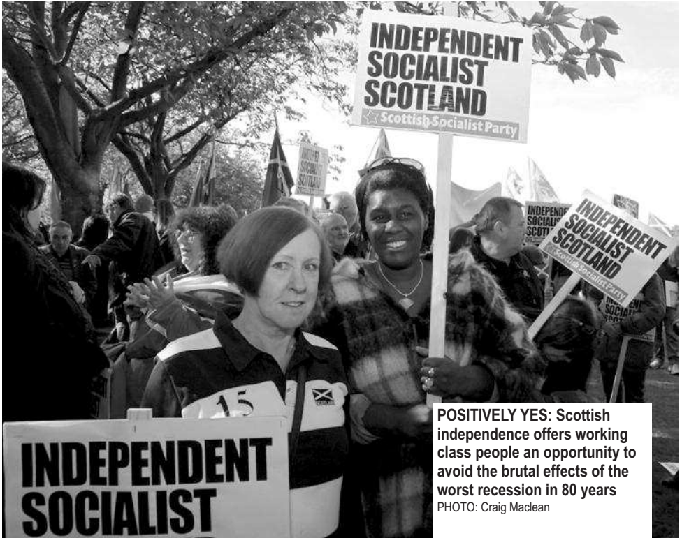
POSITIVELY YES: Scottish independence offers working class people an opportunity to avoid the brutal effects of the worst recession in 80 years

far has been based on building the biggest grassroots organisation the country has ever seen, and capitalise on the unpopularity of the ConDem government.