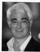
ALASTAIR DARLING: UK OR?