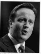
DAVID CAMERON: master of cuts