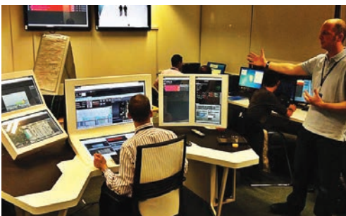
Application of multiple system data, Verint's projects. Top: ESS Bottom: TASS