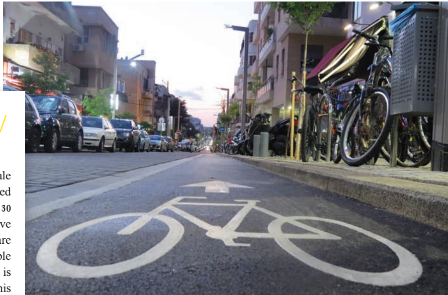
Encouraging Cycling in the City, 2MOVE2

substituting motorcycles used by the municipality with electric-run ones and on-street charging stations across the city; improving loading and unloading policy; providing transportation solutions for labor-intense areas, such as shuttles and car sharing; green routes. In one of the city's neighborhoods, a campaign is currently underway to encourage use of bicycles. Upon completion, the project's effectiveness will be measured, and lessons-learned will be implemented for the future. In addition, the municipality is reviewing a model for transportation division at the city center, to encourage bicycle riding and walking. "I already see the huge potential of this programme, and anticipate that it will change the city's landscape," says Dr. Maor. "I truly hope that other cities will join us."