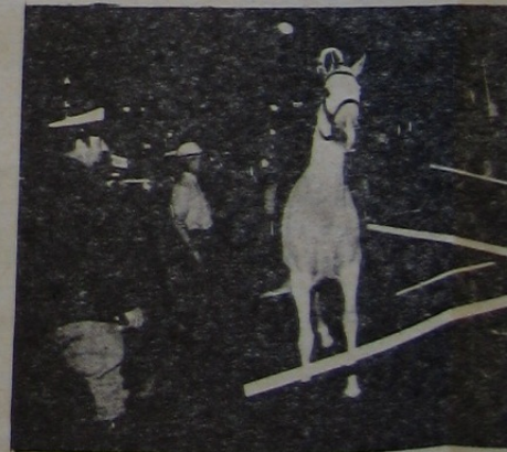
"Boys in Blue" meets resista