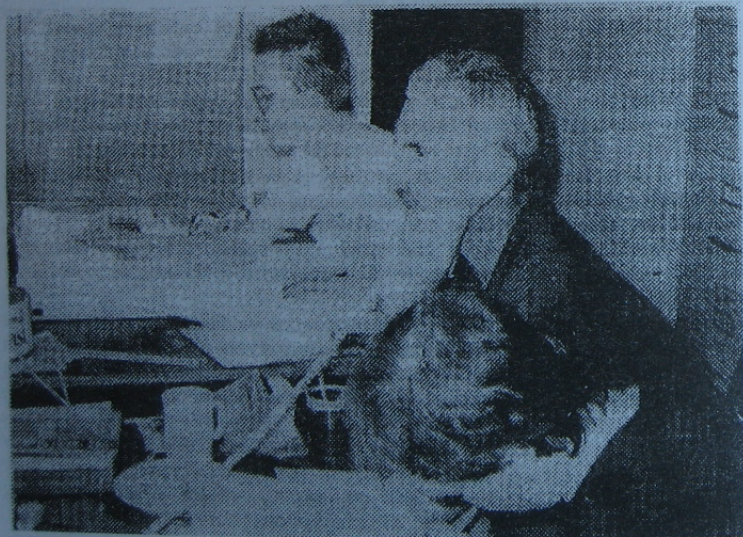
WORKERS CONTROL IN ACTION: Sth Melb. Depot trammies writing out time table cards for free tram service on January 1st. 1990

If more solidarity had come from elsewhere in the industry, and outside, the Depot workers would have won. But, for all that, they did fight well in their unfinished revolution, and conductors are still on Melbourne trams.