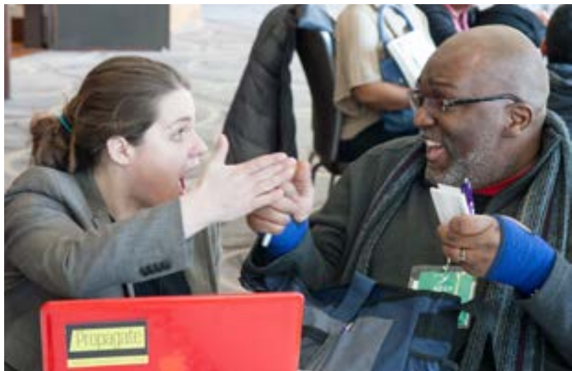
Teacher provides feedback to an entrepreneur at an ed tech summit in Baltimore

Random assignment to create the comparison groups is the preferred approach but is not always feasible, so other matching techniques are often used. It is important to understand and acknowledge their limitations when making claims about the impact or effectiveness of your app or tool.