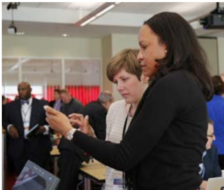
District leaders learn from each other at the Future Ready Summit in Raleigh, NC

Not every teacher will be an early adopter, and not every teacher will pick up your product with a curious willingness to play and see what it can do. No matter what you build, plan an accompanying professional learning component that outlines the basic structures, functions, and abilities of your tool. An online training module, space for a community of users to collaborate, or co-created collection of suggestions will help more reticent users start to feel at home with