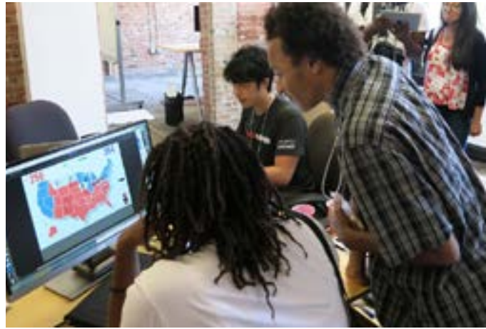
Students test games at White House Education Game Jam

Depending on what your app or tool does, you will need to determine the best way to measure effectiveness. If you are trying to improve learning in academic subjects, in addition to demonstrating that you are aligned with relevant college and career ready standards, the tests, quizzes, and checks for understanding you provide must be validated against the measures educators care about: their own classroom assessments as well as standardized tests. If you are looking to support non-cognitive factors such as grit, persistence, and