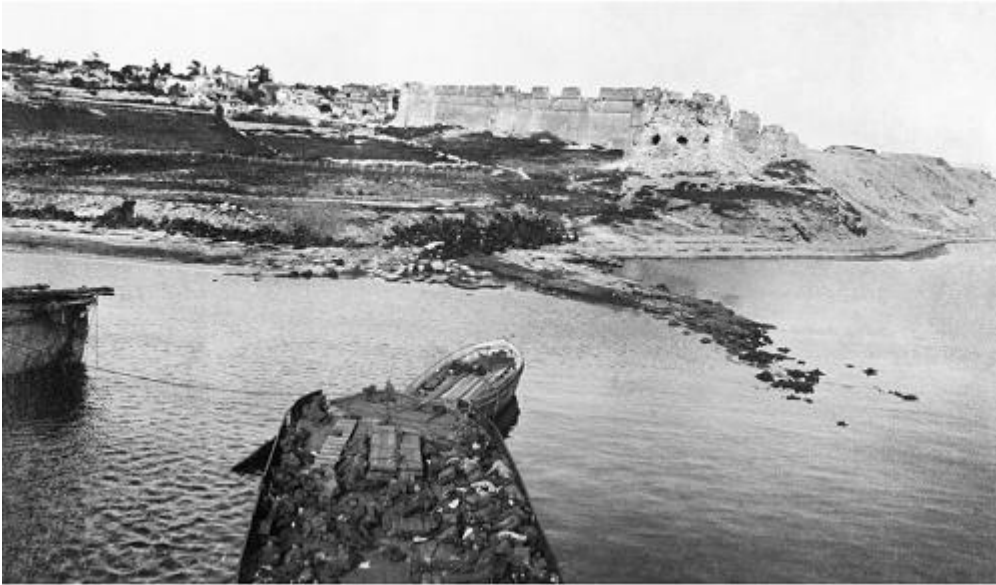
The view seen from the bridge of the SS River Clyde with V Beach and the fortress at Sedd el Bahr in the background. Many of the men lying on the deck are dead or injured.