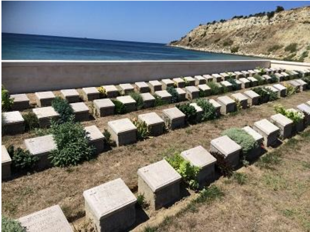
Hundreds of Irishmen are buried in the cemetery overlooking V Beach where many of them fell.