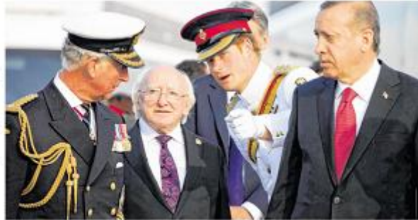
President Michael D. Higgins, Prince Harry and Turkish president Recep Tayyip Erdogan in Gallipoli yesterday.