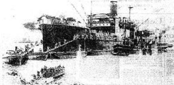
An Ottoman sailor's depiction of the "Silver Cyclops" landing at Cape Helles.

THEIR task was to be the first of getting the first battalions of the Royal Dublin Fusiliers ashore at "D Beach", at the mouth of the Gallipoli peninsula on a bright Sunday morning in 1915. The task was to be a deadly one. The British Army was to be the first to be killed on the Gallipoli peninsula.