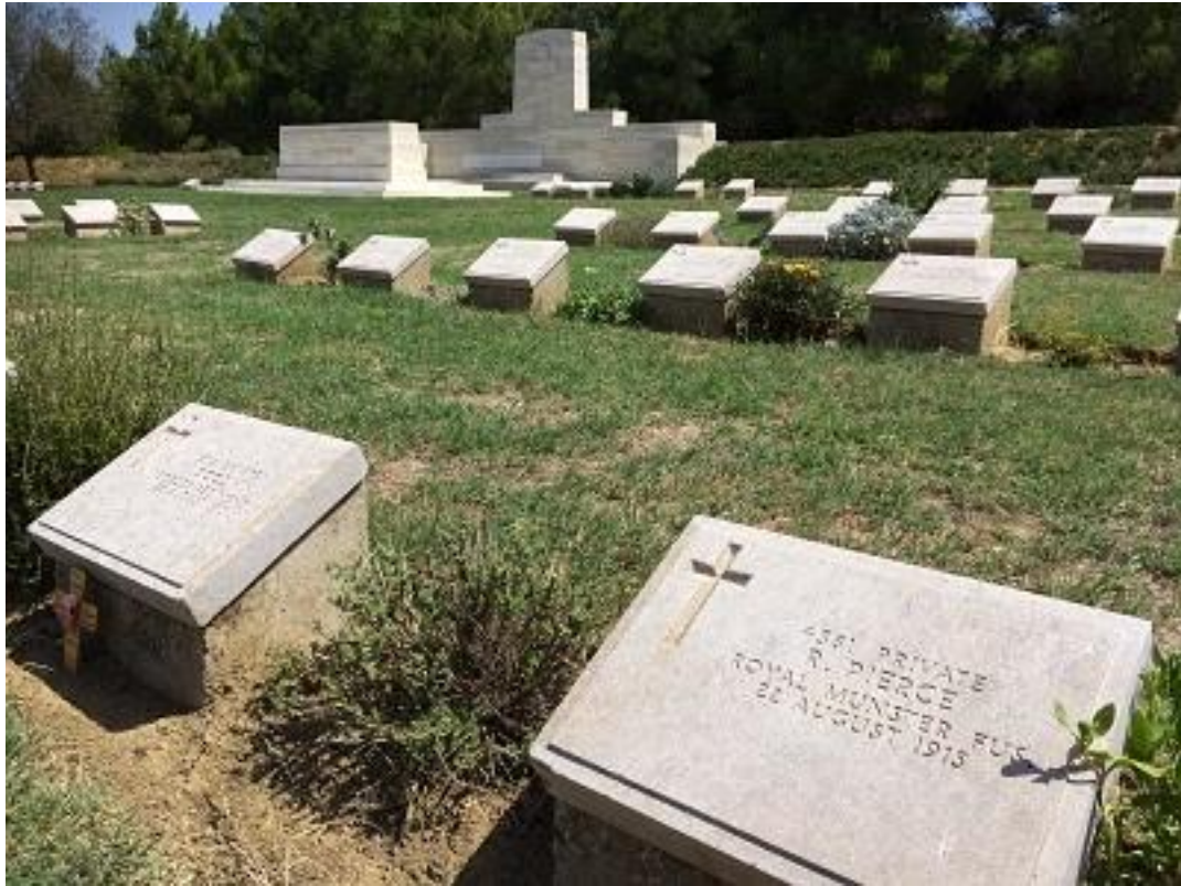
The Royal Munster Fusiliers were involved in the Suvla Bay landings and many died in the attempt to achieve a breakthrough.