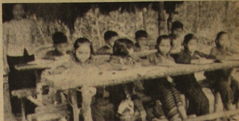
In small schools, children like these m'Nog kids learn their ABC's; written scripts for the tribal peoples have been invented by the NFL.

In which case history of the way in which the Diem government lost control of the villages is given by Denis Warner in Chapter 8 of "The Last Confucian". The account is based largely on documents found on Viet Cong cadres captured while operating