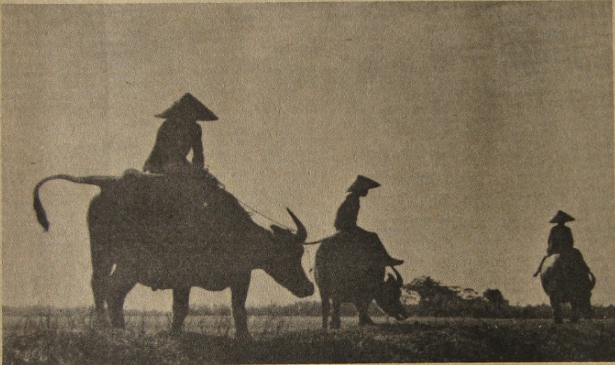
Ricefields, buffaloes, and children: the perennial image of peace in Viet-Nam. — A pointed absence of American G.I.'s.