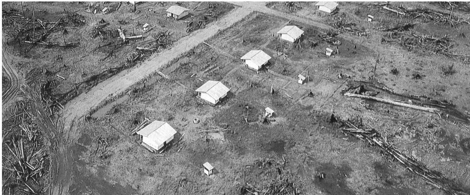
Loggers tear down the forest and are swiftly followed by government-sponsored settlers: "Everything is moving towards a boring oneness."

I have seen two ends of this world. Two powers are struggling to bring this world to two different ends. The first one is influenced very strongly by the corporations, led by a small amount of 'powerful' people on this earth. The second end is led by the common people, the population of the world. It depends on the other three enemies of tribal people; religious organisations, governments, NGOs/AOs to decide either to serve the common people's wish or to submit to the fourth enemy of the tribal people, i.e. multi-national corporations.