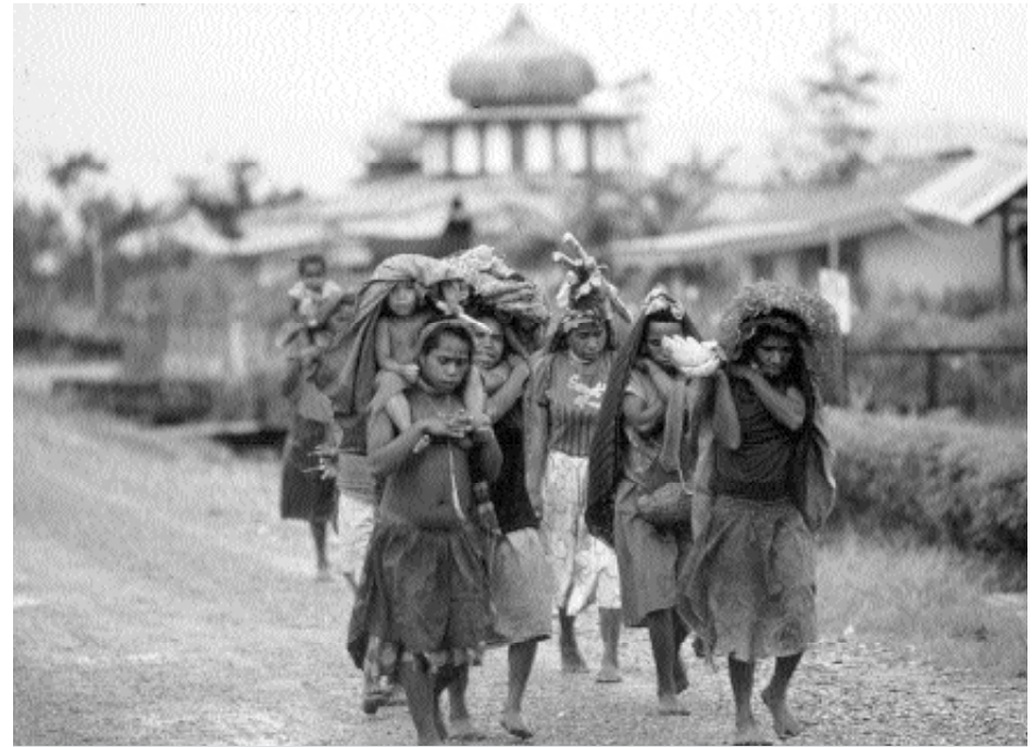
Mosques and Churches dominate modern architecture in Papua: "Religion is a tool used by those in power to control the human beings of this earth."

The term 'tribal people/community' is perhaps inappropriate to refer to all people concerned about the destruction of bio-diversity. It actually refers to the whole bio-diversity of the planet Earth that consists of plants, animals and human beings and other resources on and in the earth. Tribal community best represents this concept of 'natural life' on this planet. Tribal community will vanish in the early 21st century if we do not do anything about our existence from now on. Of course, we are already late in the day, but better late than never. The enemies are blind, they are deaf, they are mad. They have done, are doing, and will do whatever they can to destroy the natural life. What tribal community should do is to realise this and act upon this knowledge to resist properly and effectively.