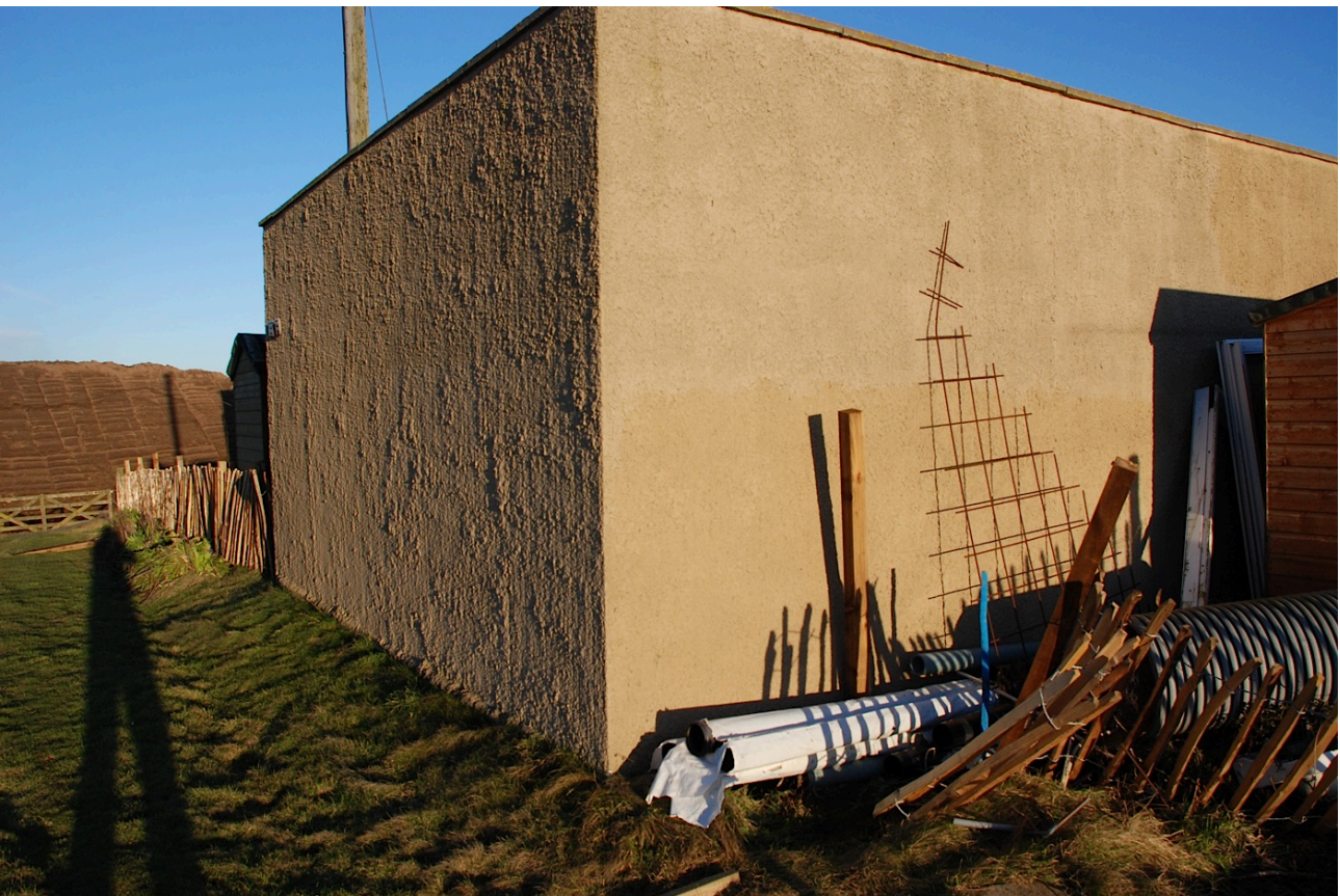
Figure 10 Blue post erected by Trump Organisation demarcating their alleged boundary