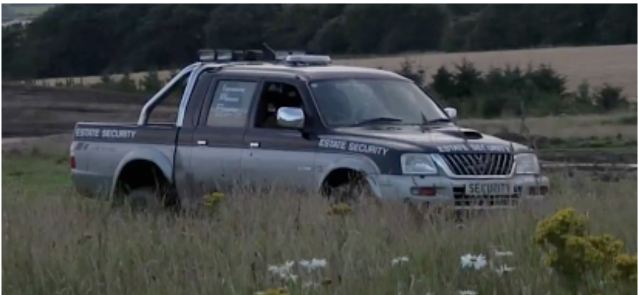
Figure 15 Trump Organisation estate security vehicle (note lack of licence plates)

“The security were really annoying at first because they came down six times a day. They just came down and then turned and went back and then about half an hour after they were back again ..... just for nae reason ..... it was just just hassle.” 38