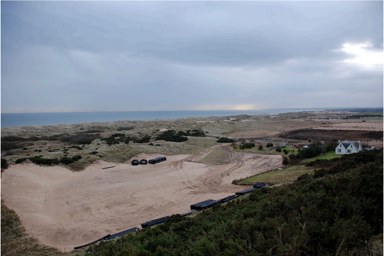
Figure 13 Extensive vegetation stripped in contravention of planning consent