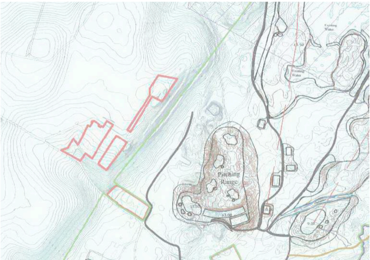
Figure 14 Approved Earthworks Plan showing no planned bunds or removal of vegetation as shown in Figures 11 and 13. Extract from Planning Consent APP/2010/1535 "Approved Earthworks 5.7.2010