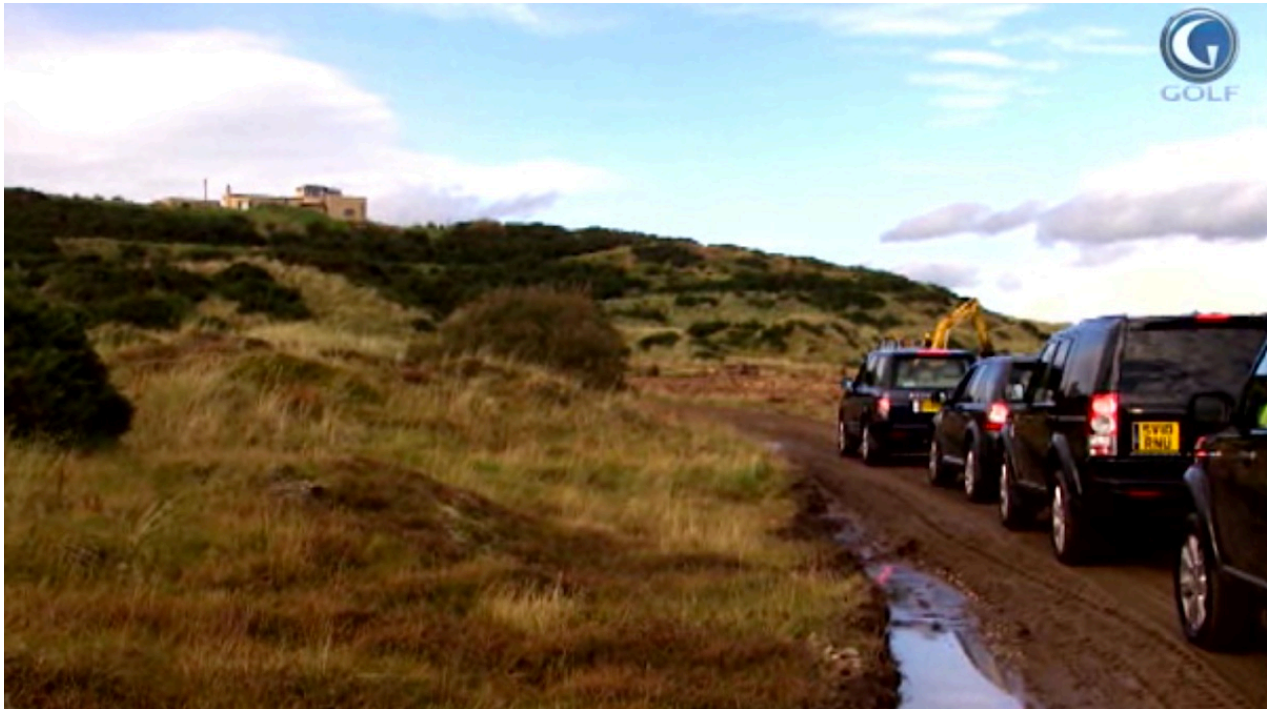
Figure 6 Donald Trump's convoy 7 October 2010

boundaries defined on the Ordnance Survey map. 24 The boundaries of the Milnes' property is shown in Figure 5.