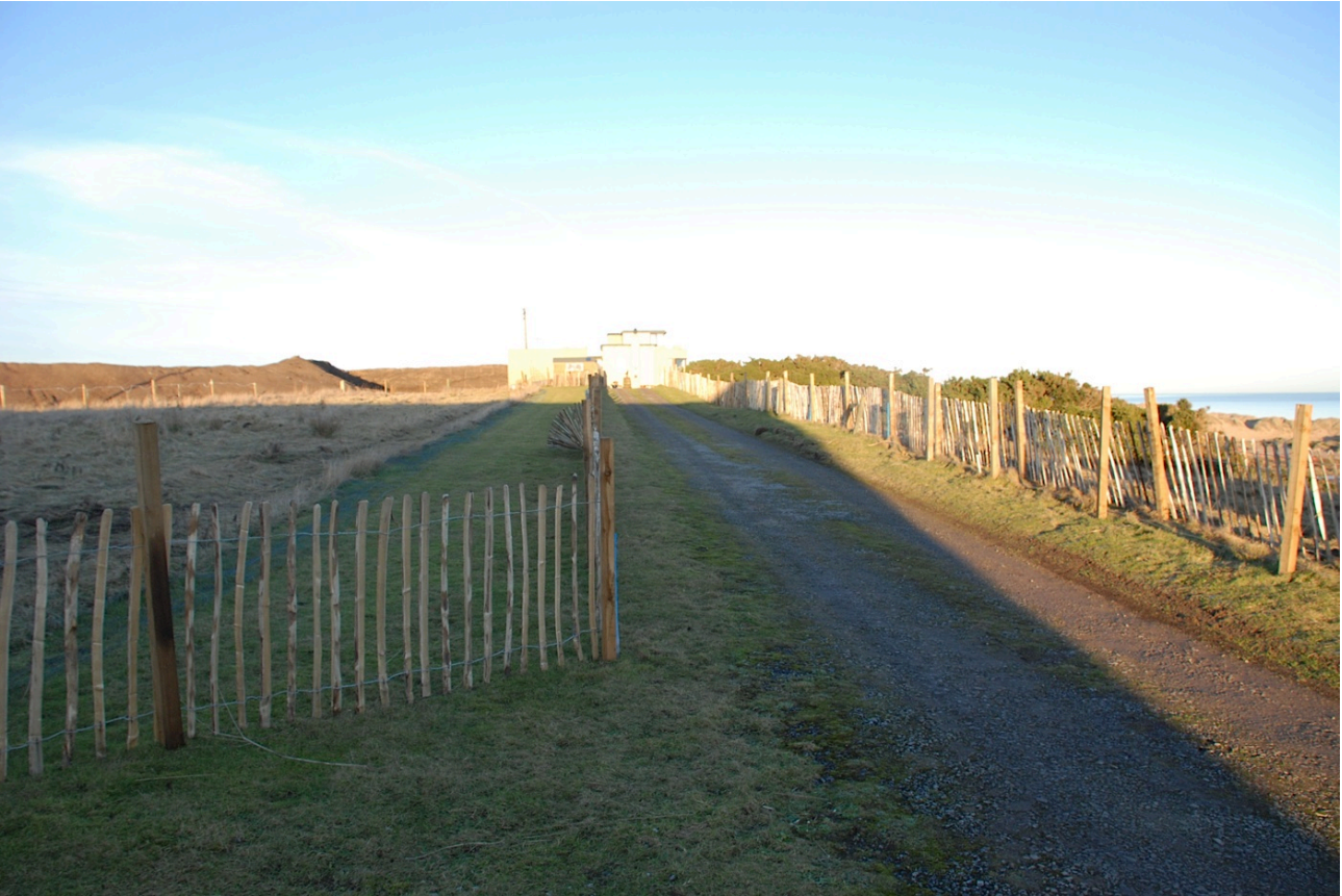
Figure 9 New fence erected by TIGLS along drive to Hermit Point