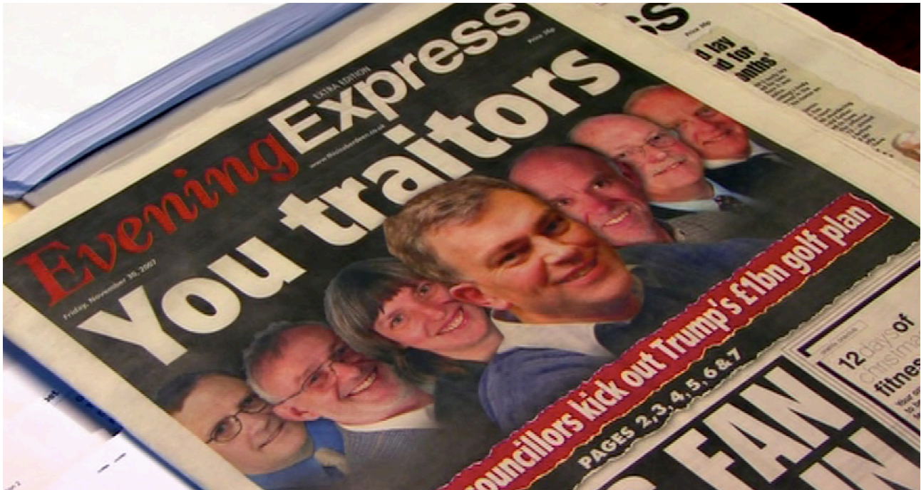
Figure 17 Evening Express 30 November 2007

Perhaps the most notorious example of this was following the planning decision on 29 November 2009 to reject the planning application. The Evening Express published the pictures of all seven councillors who had voted against the application under the headline "You traitors". The paper's editorial, "Betrayed by stupidity of seven", described the councillors as "small-minded numpties", "misfits", "buffoons in woolly jumpers", traitors to the North-east" and "no-hopers". 66