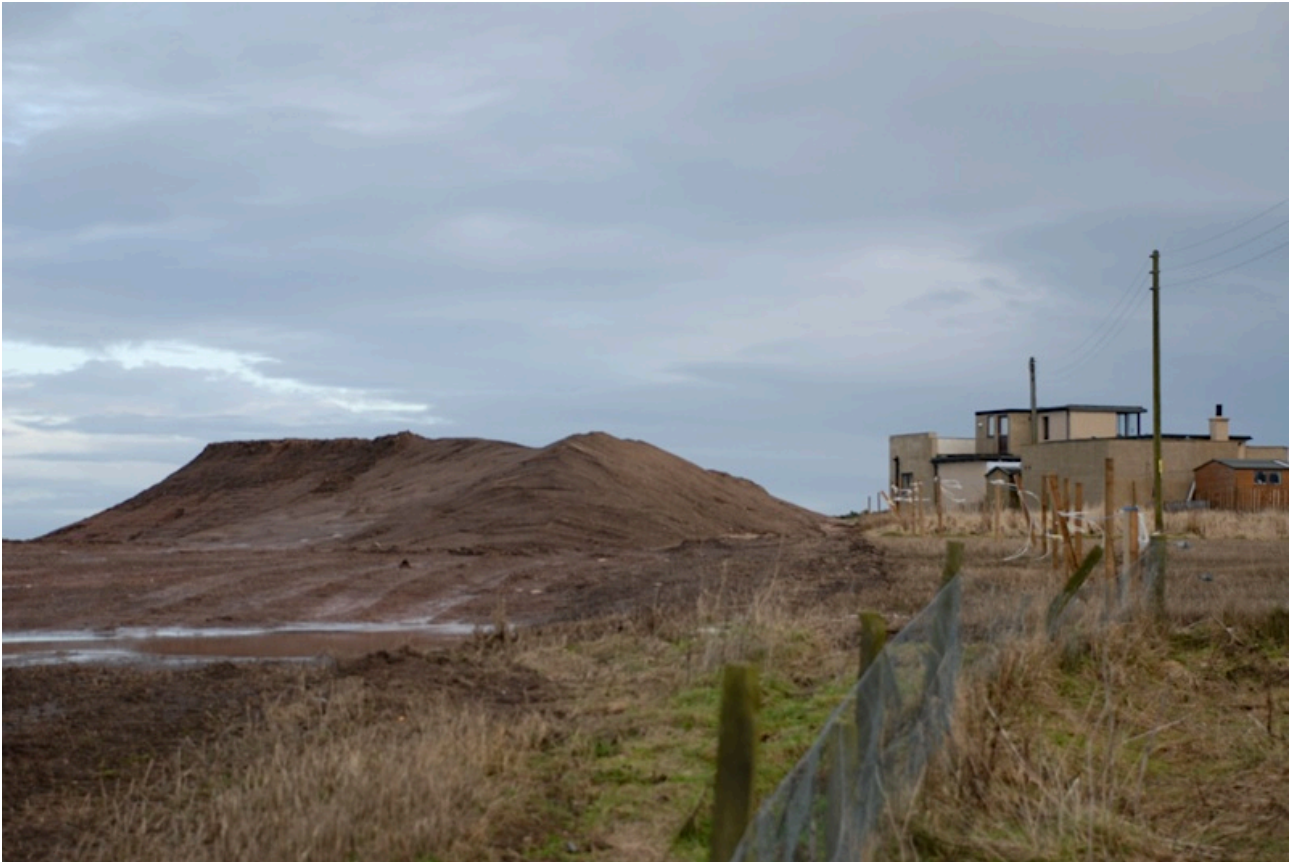
Figure 11 Bund constructed behind Hermit Point

On 21 October 2010, after TIGLS removed the existing fence, a large 20 ft high mound of earth - a bund or “berming” as Donald Trump referred to it - began to be erected on the north-west side of Hermit Point (see Fig. 11). On 27 October more soil was added to the bund.