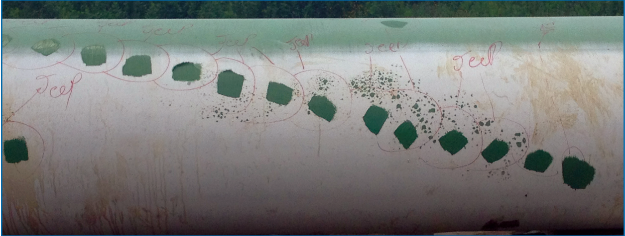
Patches have been applied to cover “holidays,” or holes and pipeline damage. Some of the patches are peeling before the pipeline is to be buried in the ground.