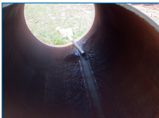
The two shots are of the exterior and interior of a massive dent from the inside of a pipe section near Jacksonville, Texas.