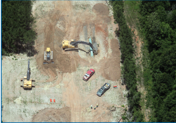
In filling the trench on this construction site near Lufkin, the trackhoe's bucket is pulling soil near the pipe, affording the possibility for the bucket to hit the line.