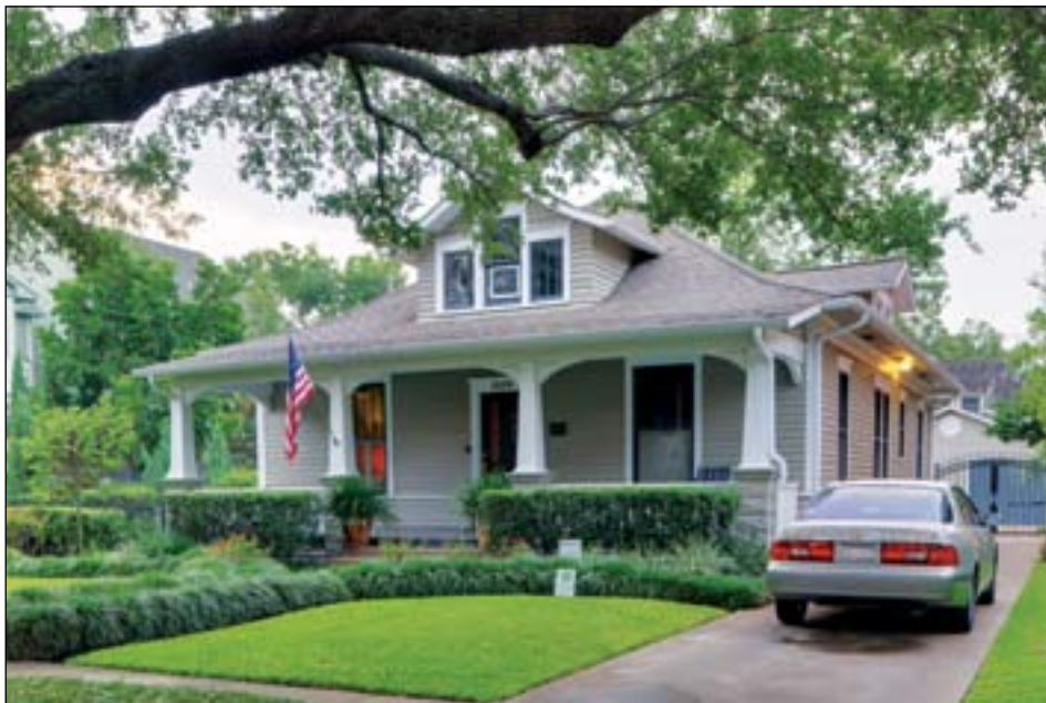
Bungalow home, the George L. Burlingame House.