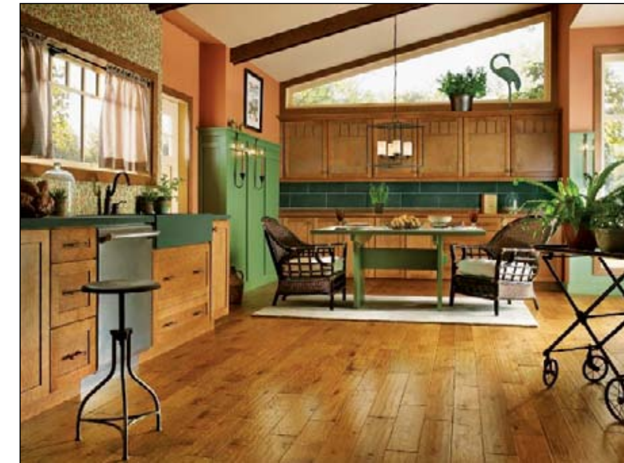
Hickory engineered wood flooring.

So...let's get on to wear and tear. Solid wood will mark. Period. If you're going to get stressed about dings and scratches forget it. Unless you want to put socks on your dogs and make your house guests