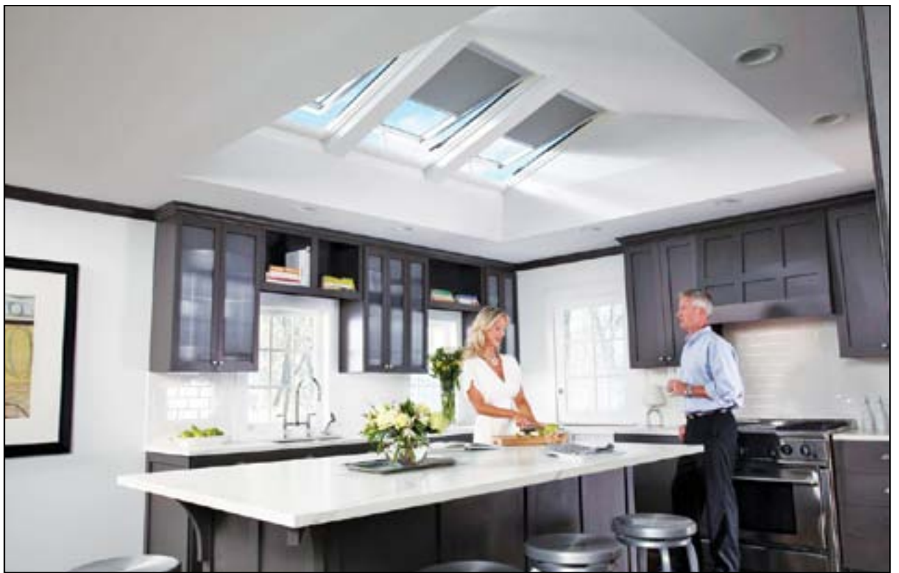
Balanced natural light and passive ventilation come with decorating flair when skylights are added to a room. Operated by touchpad remote control, Energy Star-qualified solar powered fresh air skylights and blinds, along with installation costs, are eligible for a 30 percent federal tax credit. Get details at www.whyskylights.com .

You already have a guest bedroom, so there's no need to leave Junior's old room set up as a bedroom. Turn it into