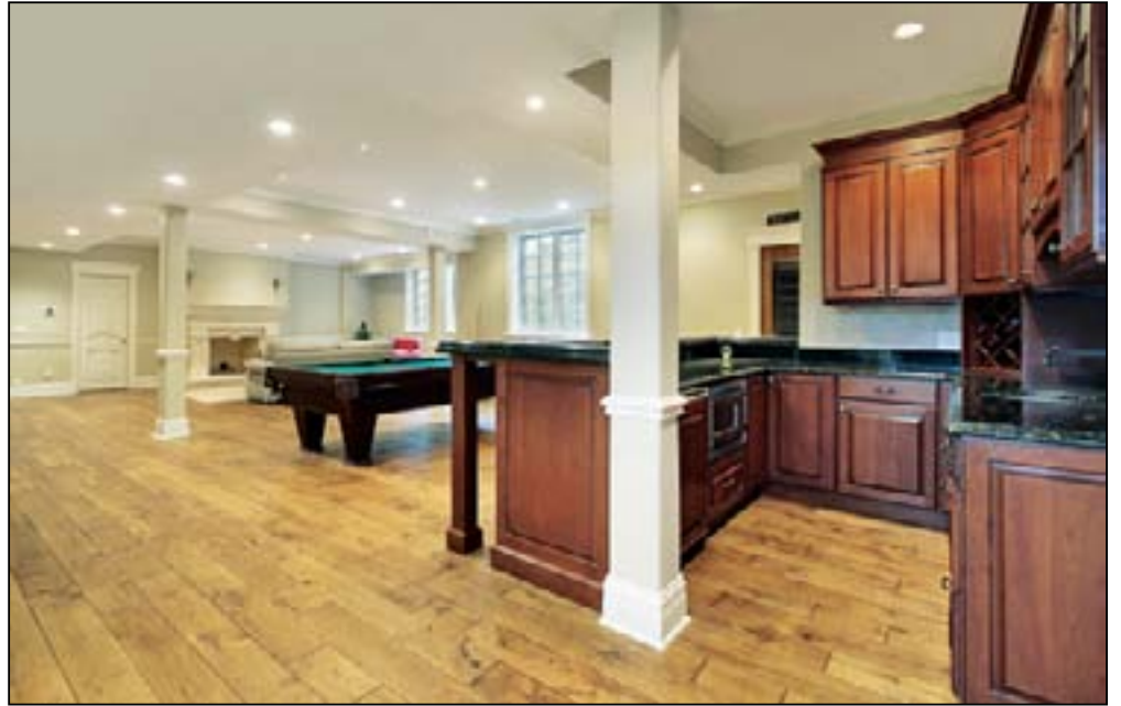
Remodeling your basement is where the biggest bang for your buck comes in, especially if you have a small home.

Have a two bedroom, one bathroom home? You can