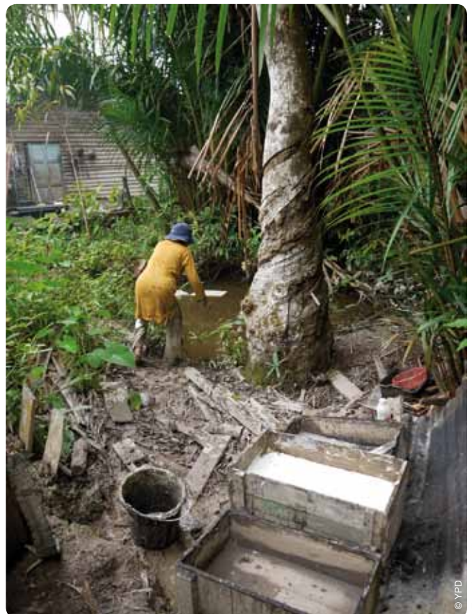
Tapping a rubber tree

description of the way in which KFCP is to be implemented sets out a staged approach for incentive payments to individuals and organisations relating to the ecological services provided. The KFCP ‘Integrated Safeguards Data Sheet’ (World Bank, 2010b) available on the World Bank website states that initial payments for eco-system services related to the project will initially be “performance based”, 10 and then “outcome based”, so that they are “commensurate with verified reductions in greenhouse gas emissions.” This is intended to be “initially as a proxy for a future forest carbon market but possibly later based on tradable credits in a real carbon market.” (World Bank, 2010b)