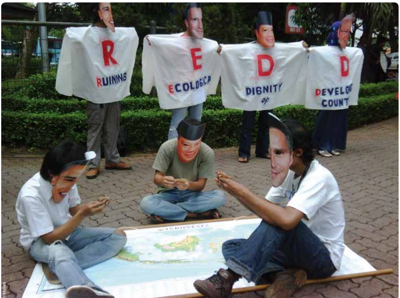
WALHI and La Via Campesina outside AusAid in Jakarta

Given the importance of deforestation and land degradation in contributing to the climate crisis, and the significance of forests to biodiversity, livelihood and indigenous sovereignty, it is vital that we consider measures to maintain and extend forests. But it is also important to bear in mind that any effective response to the climate crisis must be founded on environmental effectiveness and historical responsibility.