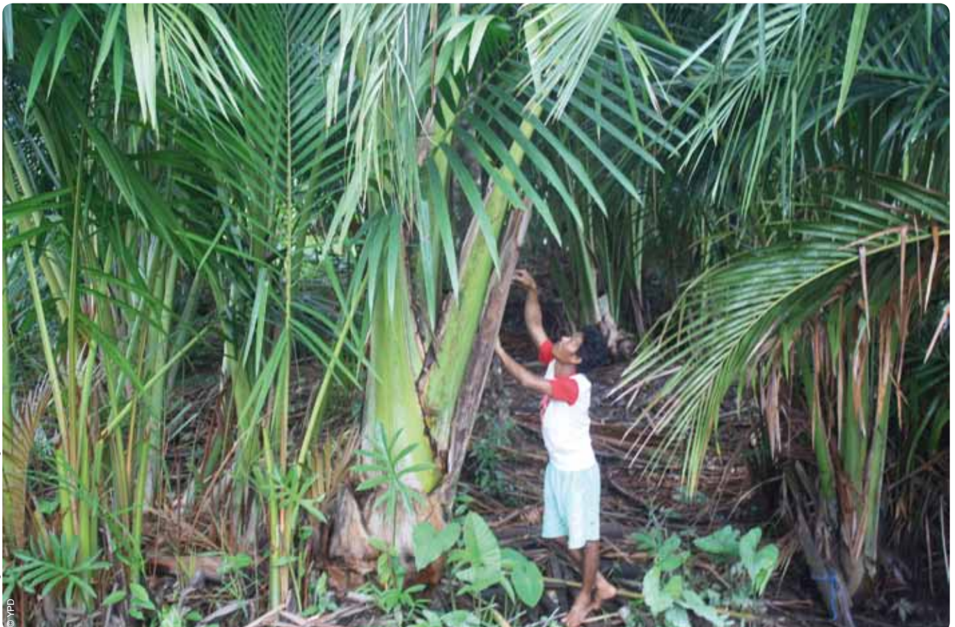
Harvesting materials from a forest garden

ARPAG claims that an expansion of 360,000 ha of palm oil concession is planned within the ex-Mega Rice Project area. The KFCP project and other REDD projects fail to provide adequate structural incentives to shift away from such extensive and unsustainable land uses. As further evidence of this, in May 2011 the Environmental Investigation Agency and Telapak found that palm oil firms were illegally clearing land in Central Kalimantan, in an area which would have been part of a moratorium on new logging concessions established under the Norway-Indonesia REDD+ Partnership (EIA & Telepak, 2011). This highlights the persistence of illegal deforestation in Indonesia, and the potential for local and national 'leakage' under policies that rely on carbon markets rather than more fundamental policy changes.