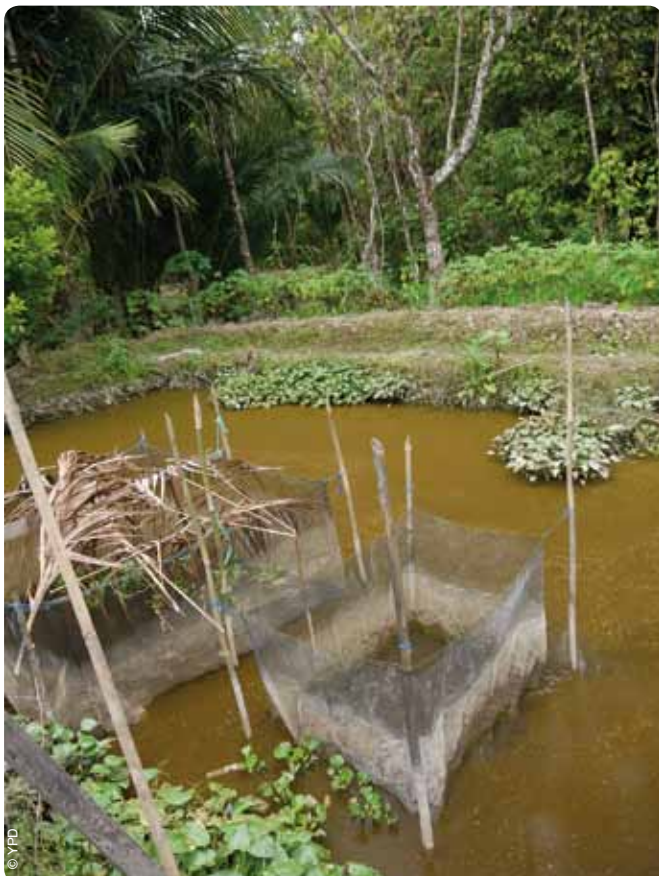
A local fishery

There are other concerns about the way the project is being implemented as well. One particular community concern is that as well as blocking the ex-Mega Rice Project canals which were originally designed to drain the peatland, the KFCP project will also block tates and handel , which are small-scale, hand-made canals used for rice paddy irrigation and transport by the communities. If these waterways are blocked, community access to rubber and rice cultivation land elsewhere in Block A will be severely restricted, and villagers' access would effectively be confined to a five kilometre strip of land alongside the Kapuas River. According to community members, they have not received a map of planned dams and weirs, nor have they been given assurance that this will not occur by the KFCP project implementers.