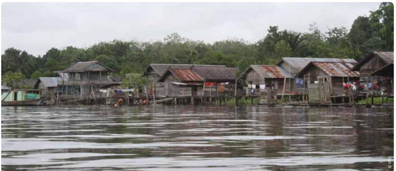
Villages along the Kapuas River