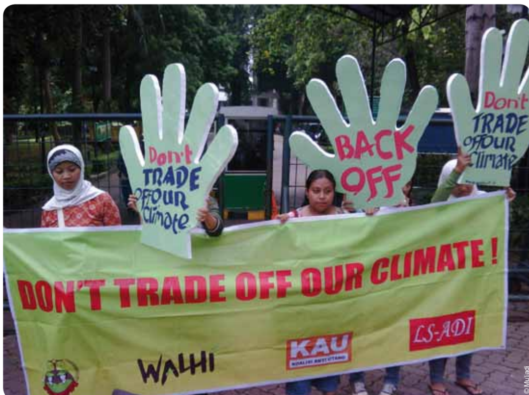
WALHI and La Via Campesina outside AusAid in Jakarta

The question of how REDD impacts upon communities living in and around forested areas has also been an important issue in the UNFCCC negotiations. Following demands from indigenous peoples' organisations and social and environmental movements, COP 16 in Cancun decided on a set of safeguards that are supposed to protect community rights. However, the text on monitoring, verification and reporting (MRV) of these safeguards was significantly watered down, with text on a system for monitoring of the implementation of safeguards being replaced with text calling for countries to merely develop a "system for providing information." (UNFCCC, 2010:A71(d)) As such, the current draft text is too weak to ensure that the rights of indigenous peoples and forest-dependent communities will be protected and promoted.