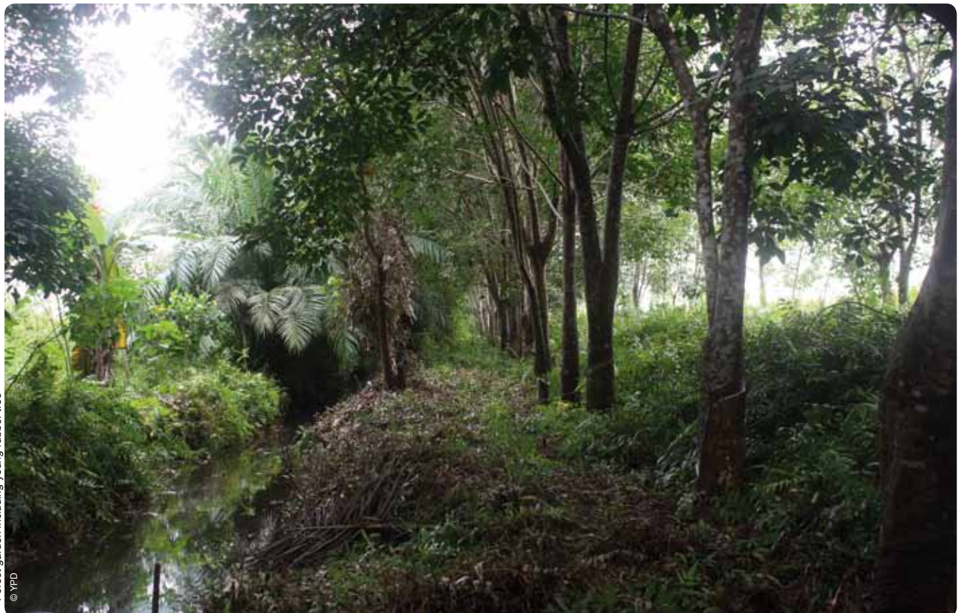
Forest garden including young rubber tree

However, the Rimba Raya project has since been substantially downsized: in August 2011, the Indonesian Forestry Ministry reneged on its commitments to the project in order to allow PT Best Group to turn half of the land - originally intended to conserve 91,000 ha of tropical rainforest and peat swamp - into a palm oil plantation (Fogarty, 2011). The case is currently before the Indonesian government's Ombudsman.