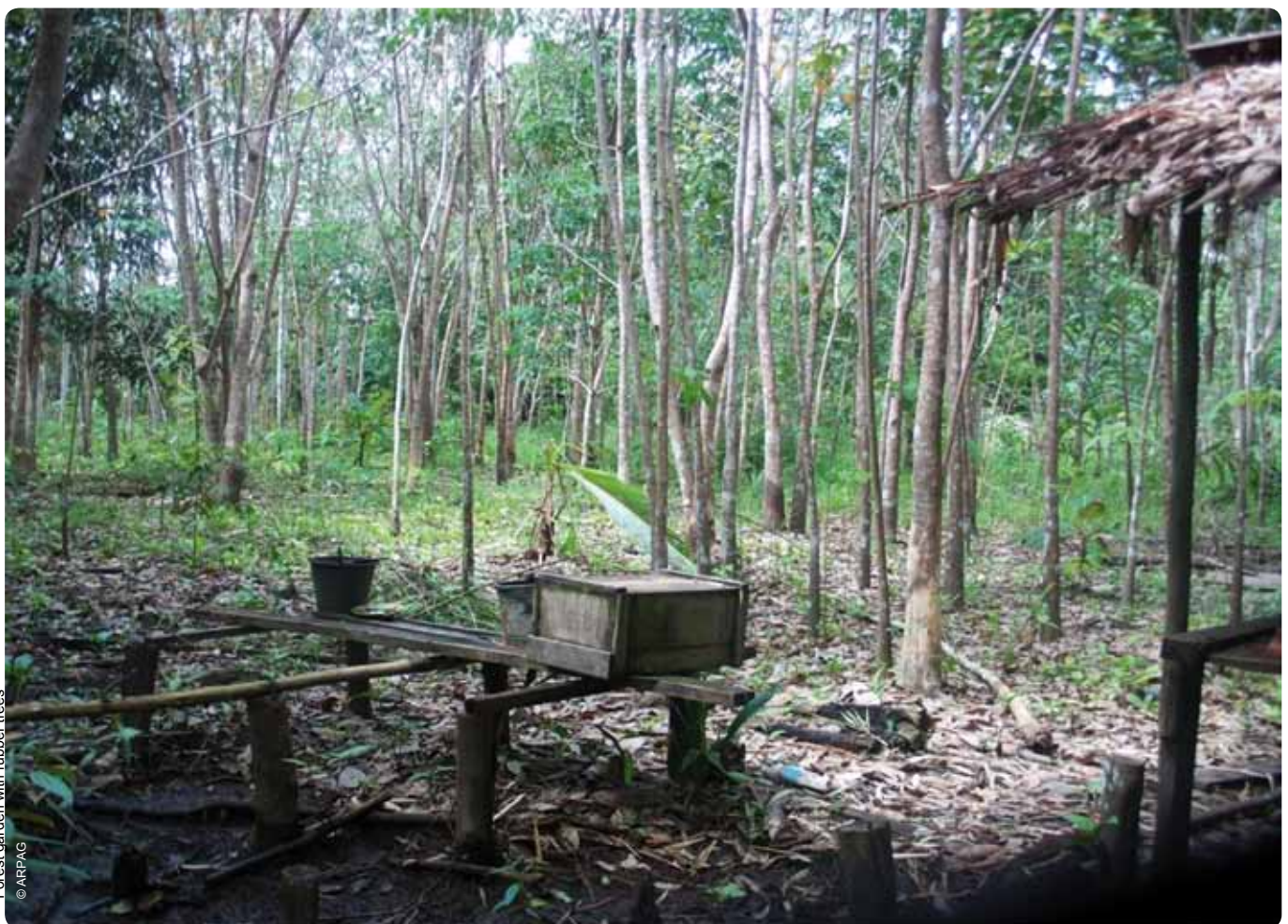
Forest garden with rubber trees

This report analyses the social and environmental effectiveness of the KFCP in the light of new developments in both Kalimantan and national REDD policy in Indonesia. It finds that REDD forest carbon offsets are a false solution to climate change.