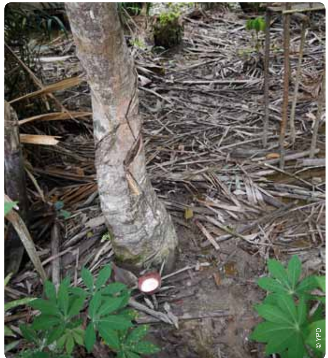
A tap on a rubber tree

The final document resembles an unambitious combination of all drafts, and is estimated to cover 7.2 Mha of primary forests, 11.2 Mha of peatlands, and 4.1 Mha that fall into neither of these categories (Murdiyarso et al , 2011). The moratorium uses the definition ‘primary natural forests’— which effectively means only those forests where no license has ever been applied. Lands which have previously been degraded, which might be managed as forests in the future, are excluded. The final set of non-binding instructions provides only minimal protection for Indonesia’s forests. It does not apply to existing concessions or concessions that have ‘approval in principle’ from the Minister of Forestry, or the extension of these agreements, or to land needed for