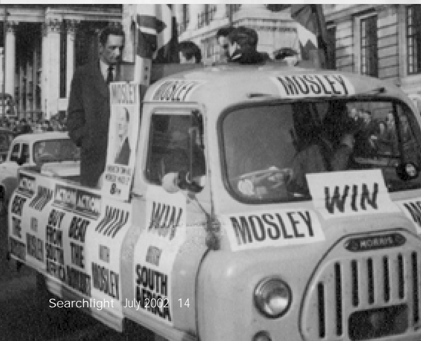
Above and below Mosley heavy mob trying to intimidate protest rally after the Sharpshville Massacre 1960

The 62 Group followed in the footsteps of the militant defenders of the Jewish community who had come before it. With arsons being carried out on synagogues and serious provocations against Britain’s Jews, the community needed a force that could physically defend it. The antisemites soon discovered – often after hitting the pavement – that the stereotype of the weak, cowardly Jew was just another Nazi myth. Just as Judah Maccabee and his followers in biblical times had dealt hammer blows against the enemies of the Jewish community, so too did the 62 Group against their enemies in the 1960s. Like those who fought at the Battle of Cable Street in 1936 and the 43 Group in the 1940s, their activities are an inspiration, not only to Jewish people, but to communities that face racist attacks everywhere.