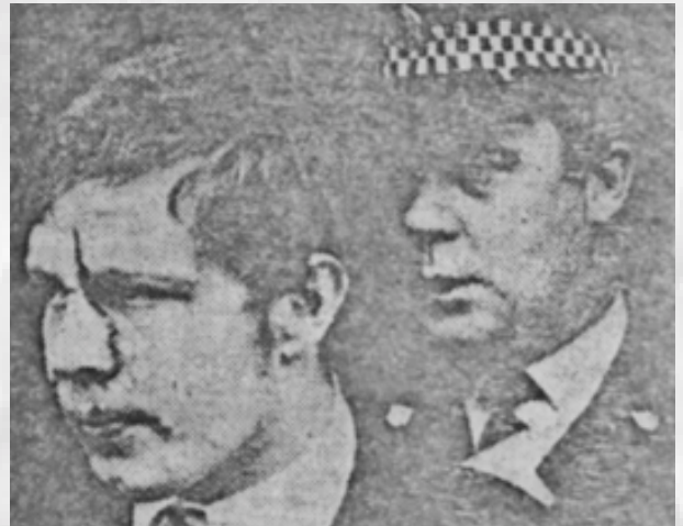
Below German SS men's bodyguard after 62 Group ex-servicemen got through with him Brighton 1971